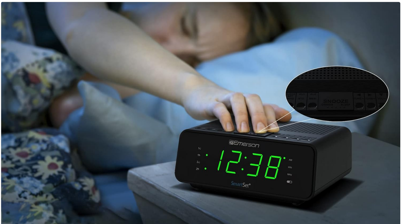
Figure 3: A hand reaching to press the large SNOOZE button on top of the clock radio.