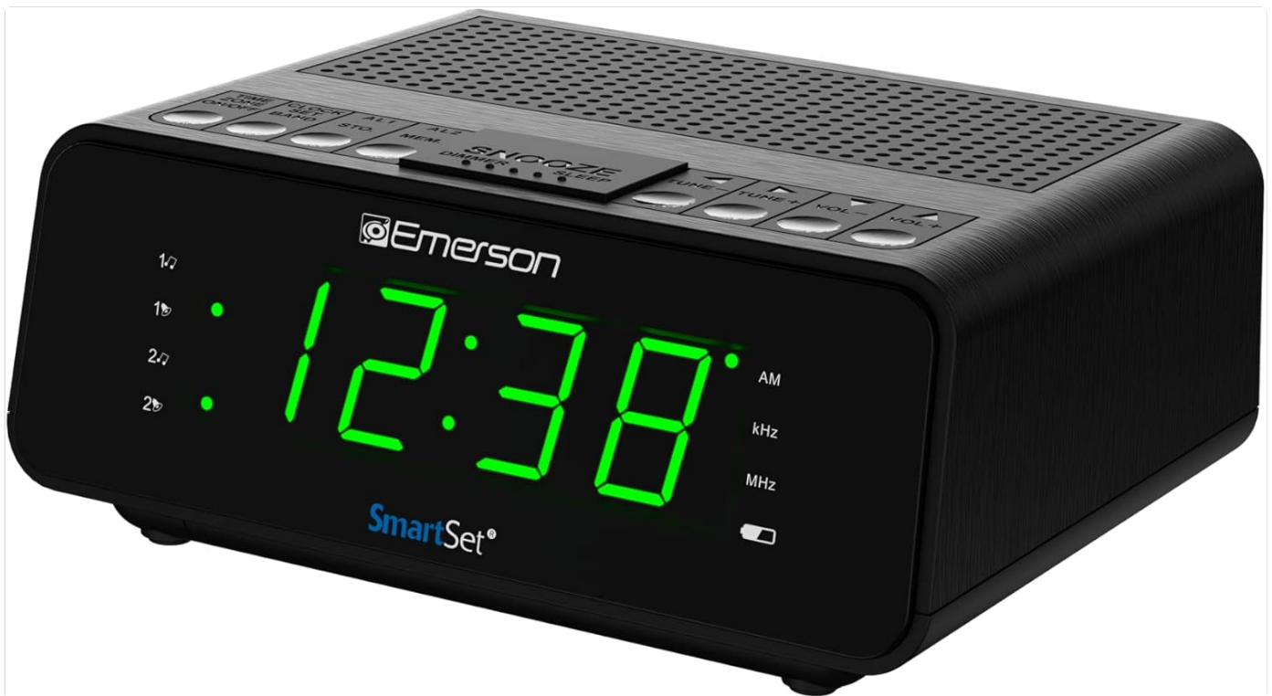
Figure 2: Front view of the clock radio, showing the large green LED display.