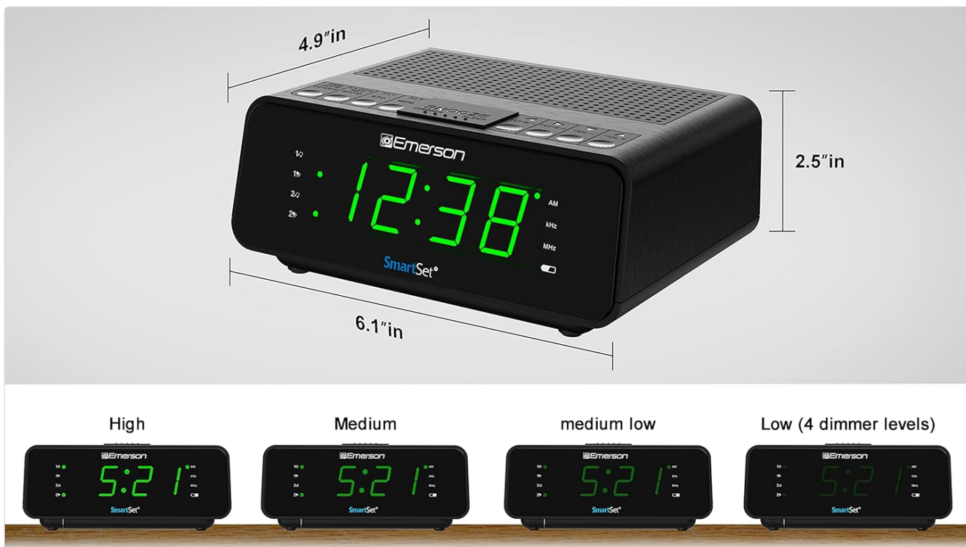
Figure 4: Illustration of the four dimmer levels available for the LED display, from High to Low.

To adjust the brightness of the LED display: