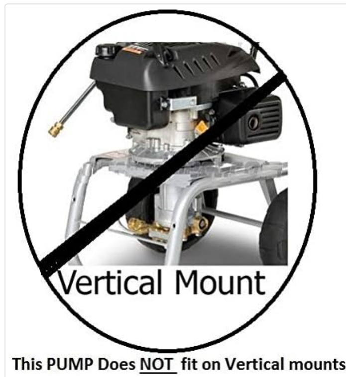
Image: A visual warning indicating that this pump is not suitable for vertical mount pressure washer engines.