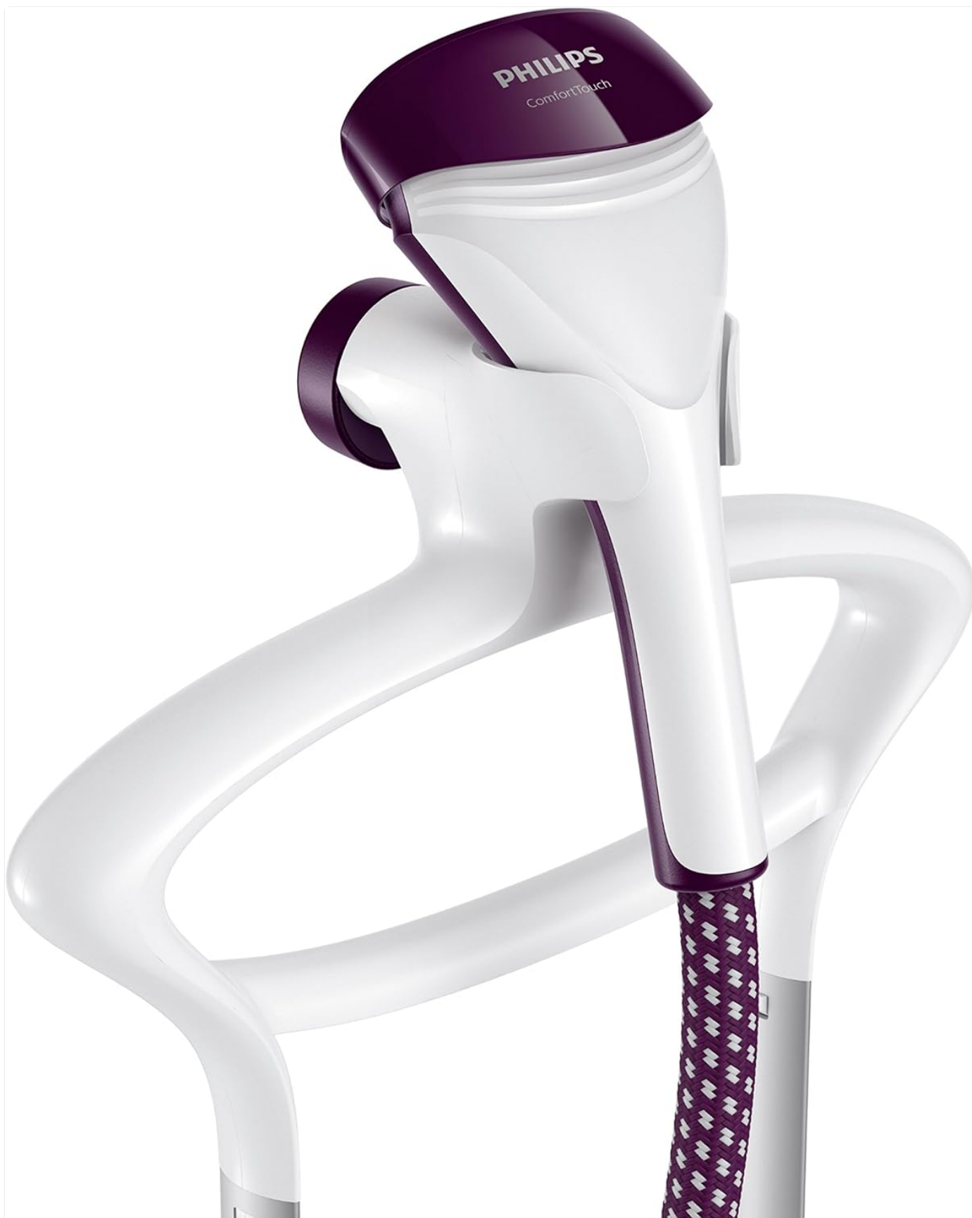
Figure 2: Steamer Head and Controls

This image provides a close-up view of the steamer head, highlighting its design and steam vents. The ergonomic handle and the flexible connection to the hose are visible, demonstrating the FlexHead technology for easier steaming.