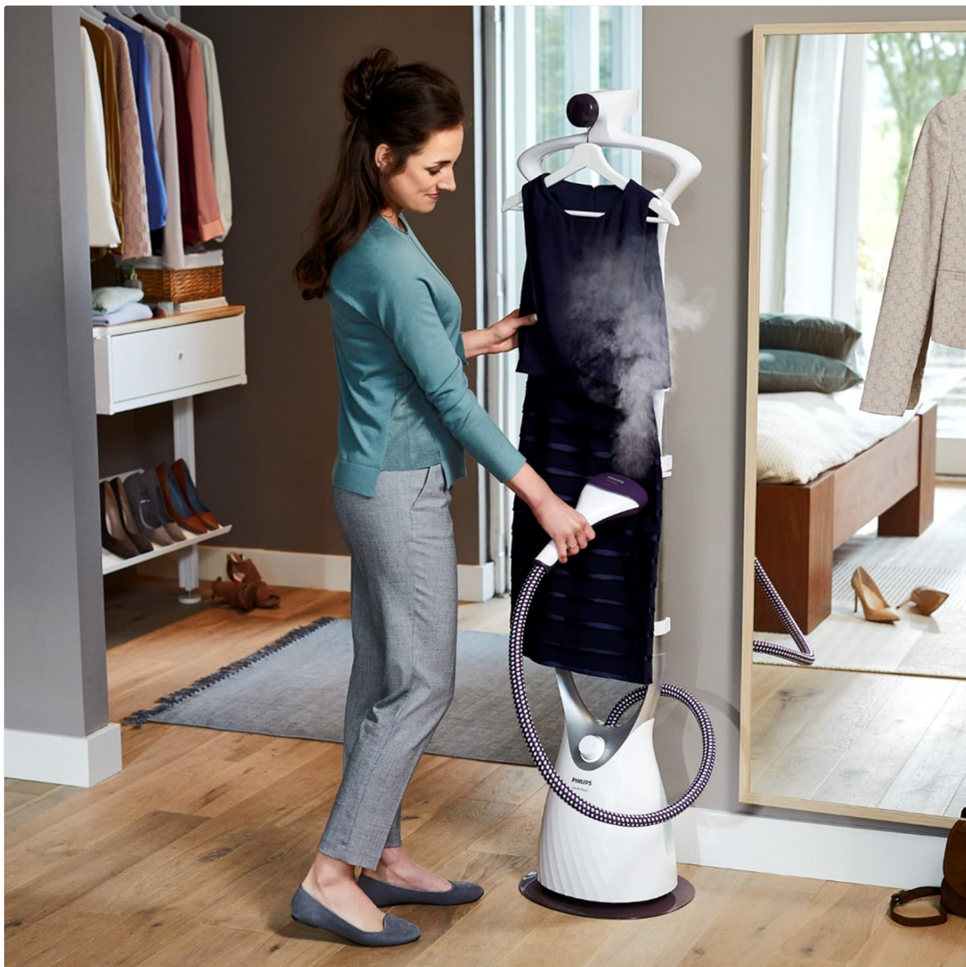
Figure 4: Steaming a Garment

This image shows a user actively steaming a dark dress using the Philips ComfortTouch Garment Steamer. The garment is hung on the integrated hanger, and the user is holding the steamer head, demonstrating the ease of use and the upright steaming process.