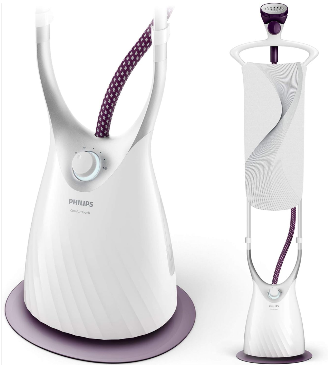
Figure 1: Philips GC557/30 ComfortTouch Garment Steamer

This image displays the complete Philips GC557/30 ComfortTouch Garment Steamer. It features a white main unit with a purple base, a flexible hose, a steamer head, and an integrated StyleBoard for support during steaming. The design emphasizes ease of use and stability.