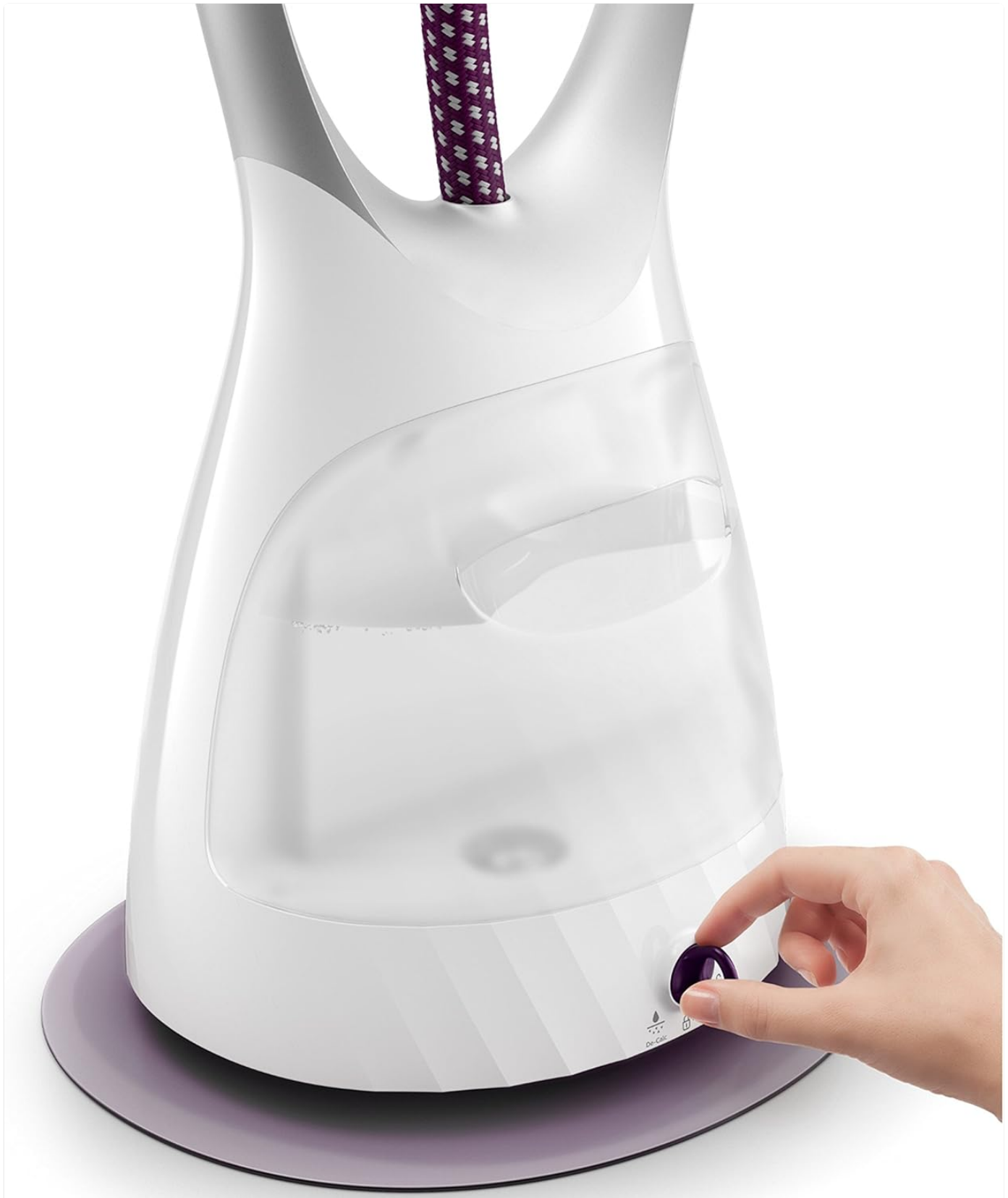
Figure 3: Water Tank and Steam Settings

This image shows a hand interacting with the water tank and the steam settings dial on the main unit. The transparent water tank allows for easy monitoring of the water level, and the dial indicates various steam settings.