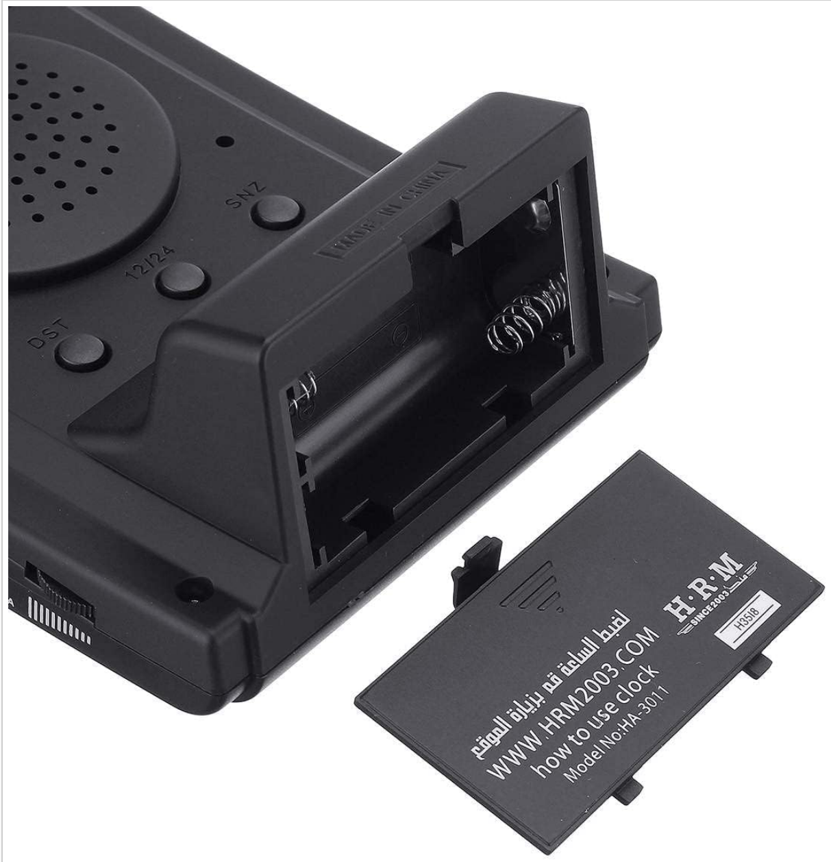
Image 4.1: Rear view of the clock showing the battery compartment.