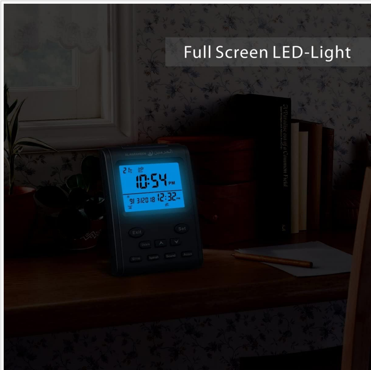
Image 5.2: The clock display illuminated by its full-screen LED light in a low-light setting.

To illuminate the display in dark environments, press the Stop/Light button located on the top edge of the clock. The backlight will activate for a few seconds.