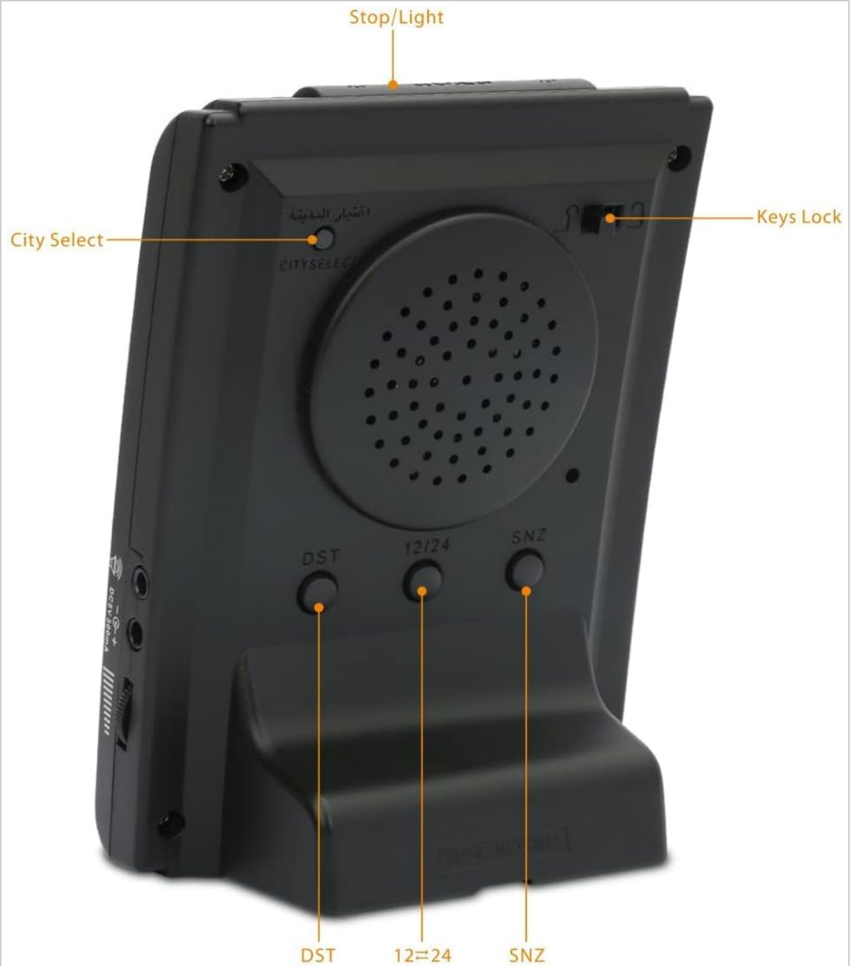
Image 4.2: Rear view of the clock highlighting control buttons and switches.