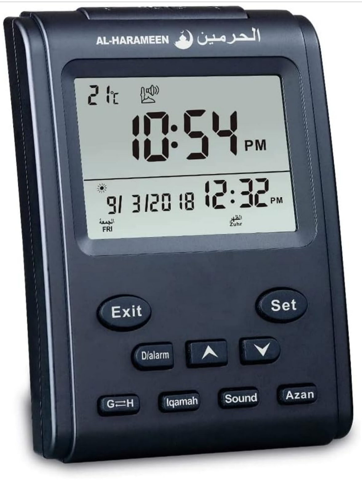
Image 1.1: Front view of the AL-HARAMEEN HA-3011 Azan Clock, displaying time, date, and prayer information.