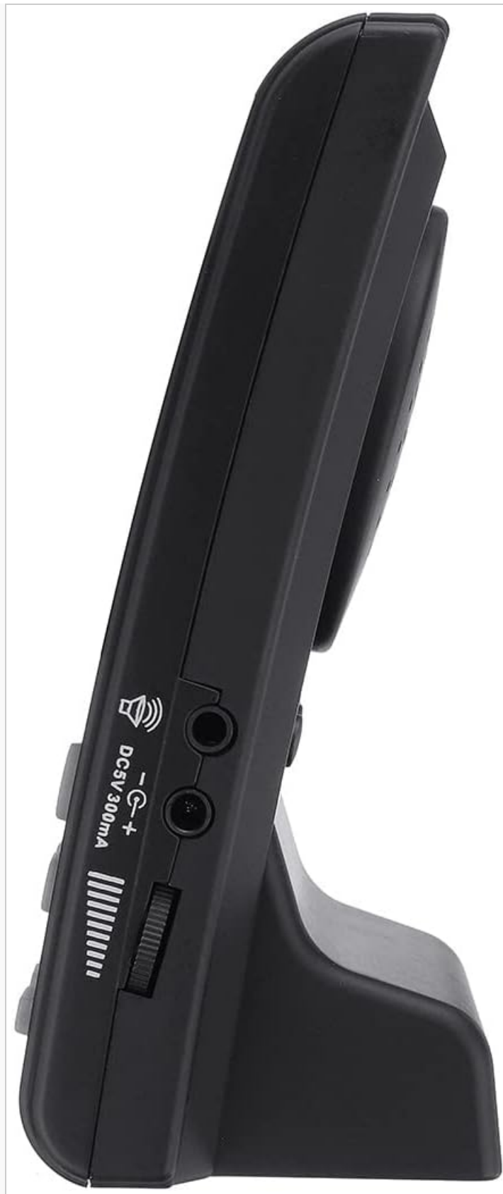
Image 5.1: Side view of the clock, indicating the volume control slider and power input.