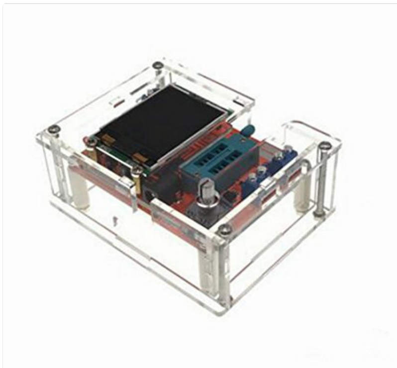
Image 1.1: The Q-BAIHE GM328 Transistor Tester, fully assembled in its protective clear acrylic case.

The Q-BAIHE GM328 is a versatile multi-functional transistor tester designed for automatic detection and analysis of various electronic components. It can identify NPN and PNP transistors, FETs, diodes, dual diodes, thyristors, and SCRs, automatically determining their pinout. Additionally, this device functions as a square wave and PWM signal generator, making it a valuable tool for electronics enthusiasts and professionals.