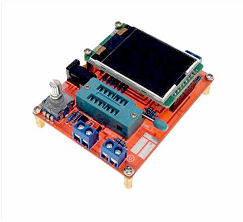
Image 6.1: The GM328 PCB, highlighting the ZIF socket for component insertion and test points.

The GM328 features a ZIF (Zero Insertion Force) socket for easy component testing. The device automatically identifies the component type and pinout.