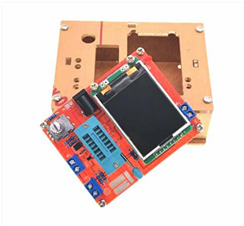
Image 4.2: The main PCB board being fitted into the lower section of the acrylic case.