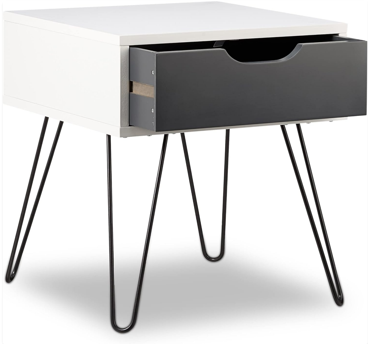
A view of the nightstand with the drawer open, highlighting the internal storage capacity and the drawer's stop mechanism.

The integrated drawer provides convenient storage for personal items. To open, gently pull the drawer from its recessed handle. To close, push the drawer back until it is flush with the nightstand's front. The built-in stop mechanism prevents the drawer from being pulled out completely, enhancing safety and preventing accidental drops.