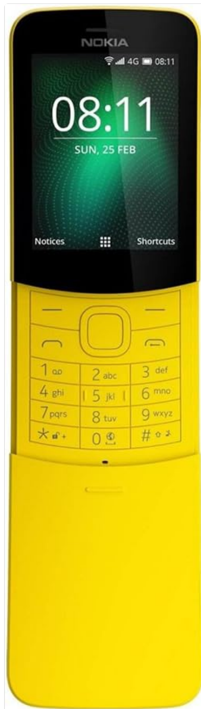
Image: Front view of the Nokia 8110 4G with the slider open, displaying the screen and the full alphanumeric keypad.