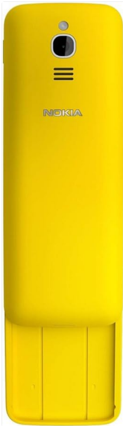
Image: Nokia 8110 4G with the slider open, showing the keypad and the internal compartment for SIM and battery access.