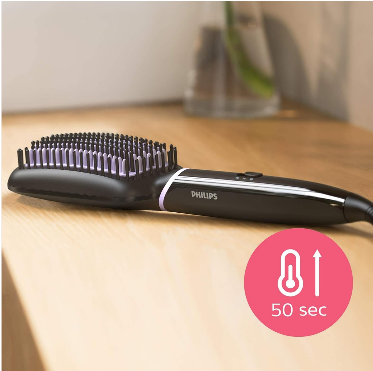
The heated brush ready for use, with an icon indicating its rapid 50-second heat-up time.