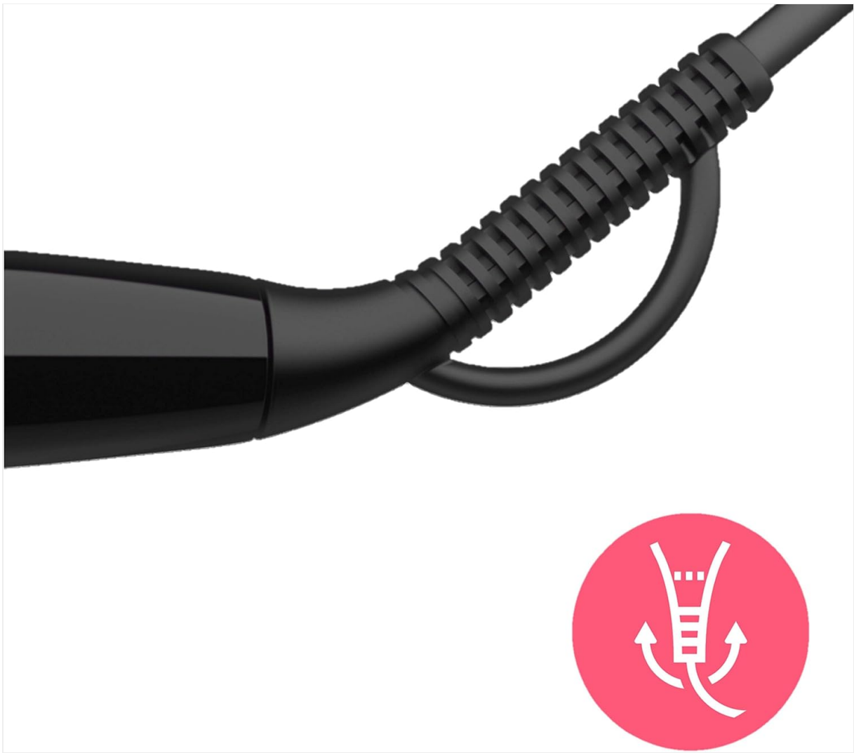
Detail of the swivel cord connection, designed to prevent tangling during use.