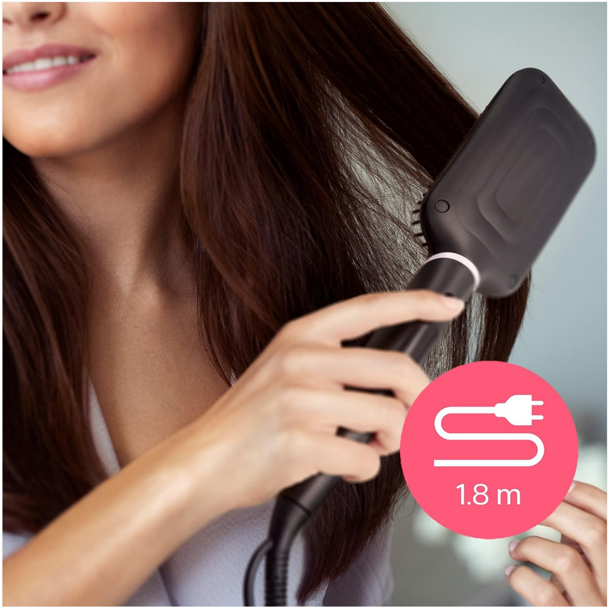
The power cord of the heated brush, with an icon indicating its 1.8-meter length for flexible use.