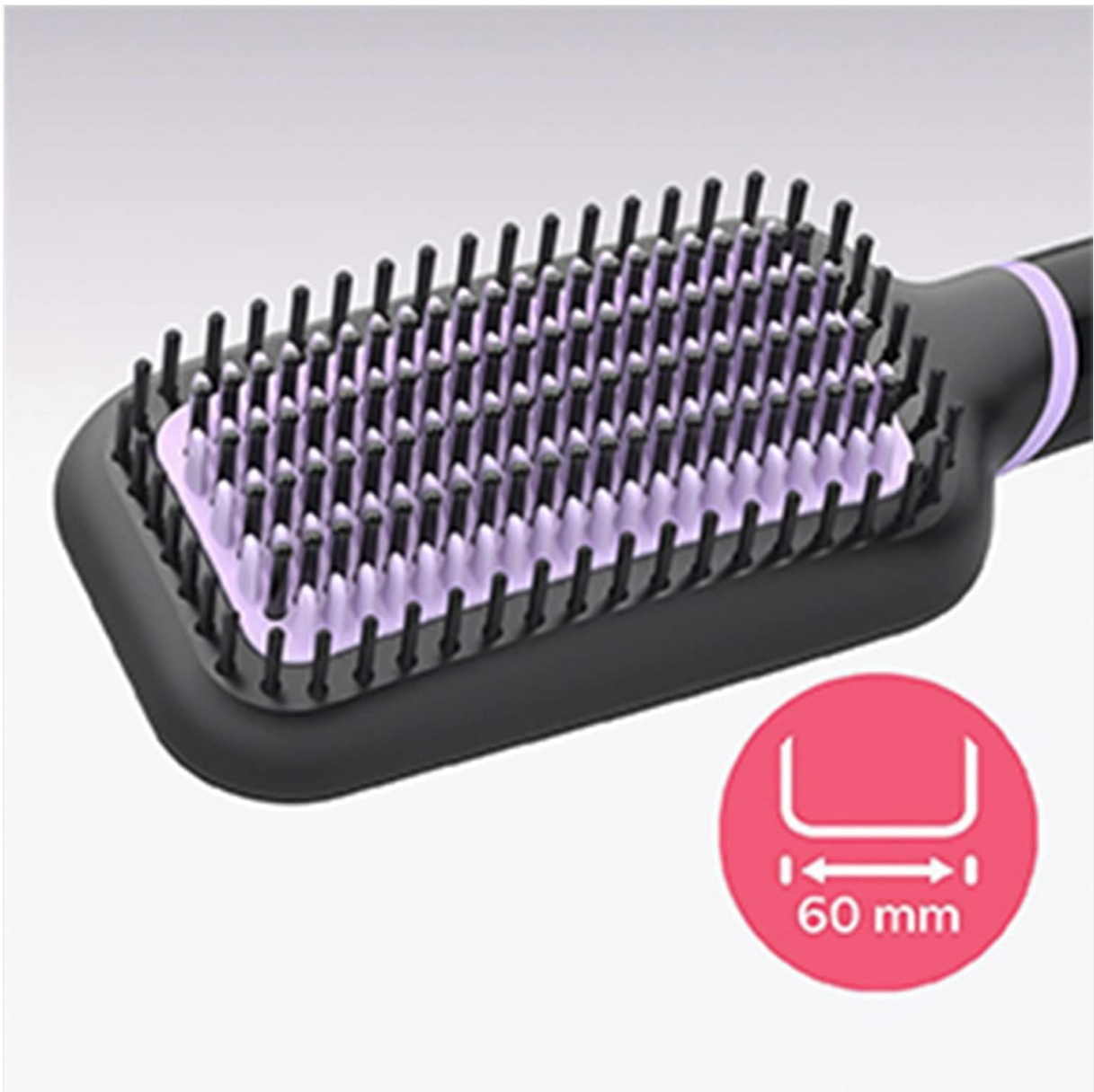
Detail of the brush head, illustrating the 60mm wide paddle design for efficient styling.