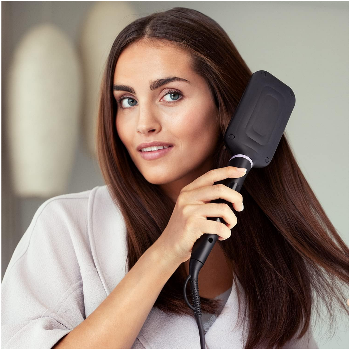
A user demonstrating the application of the Philips BHH880 heated brush for hair straightening.