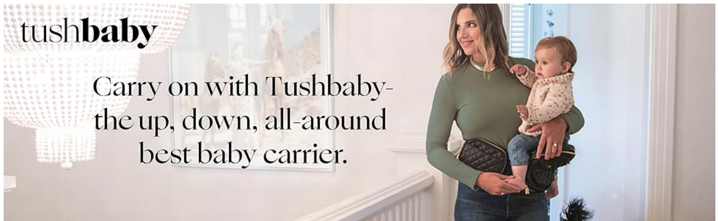
Image: A woman comfortably carrying a baby on the Tushbaby hip seat, illustrating the ease of use.

The Tushbaby Original Hip Seat Baby Carrier is designed to provide ergonomic support for parents and comfort for babies and toddlers. It allows for multiple carrying positions, reducing strain on the back and arms while keeping your child close. This manual provides essential information for safe and effective use of your Tushbaby carrier.