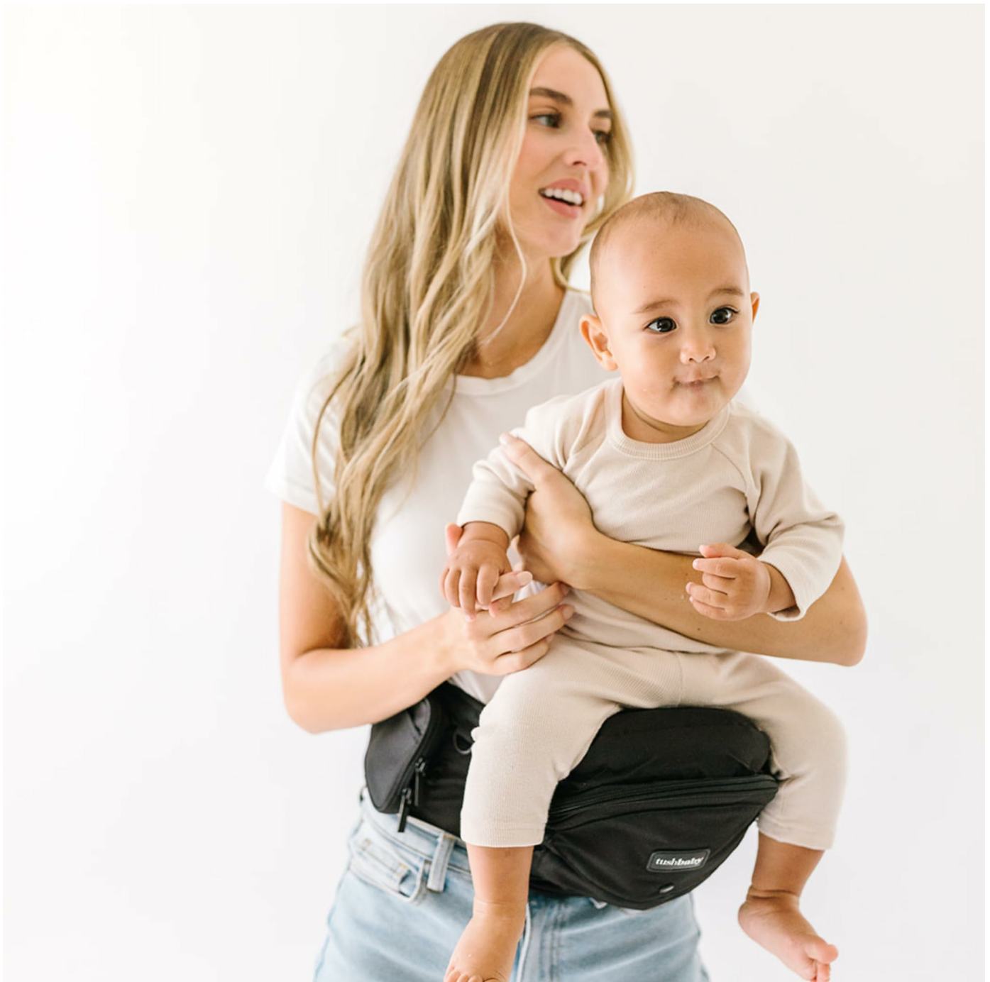
Image: The Tushbaby Original Hip Seat Baby Carrier in black, showcasing its design and adjustable features.