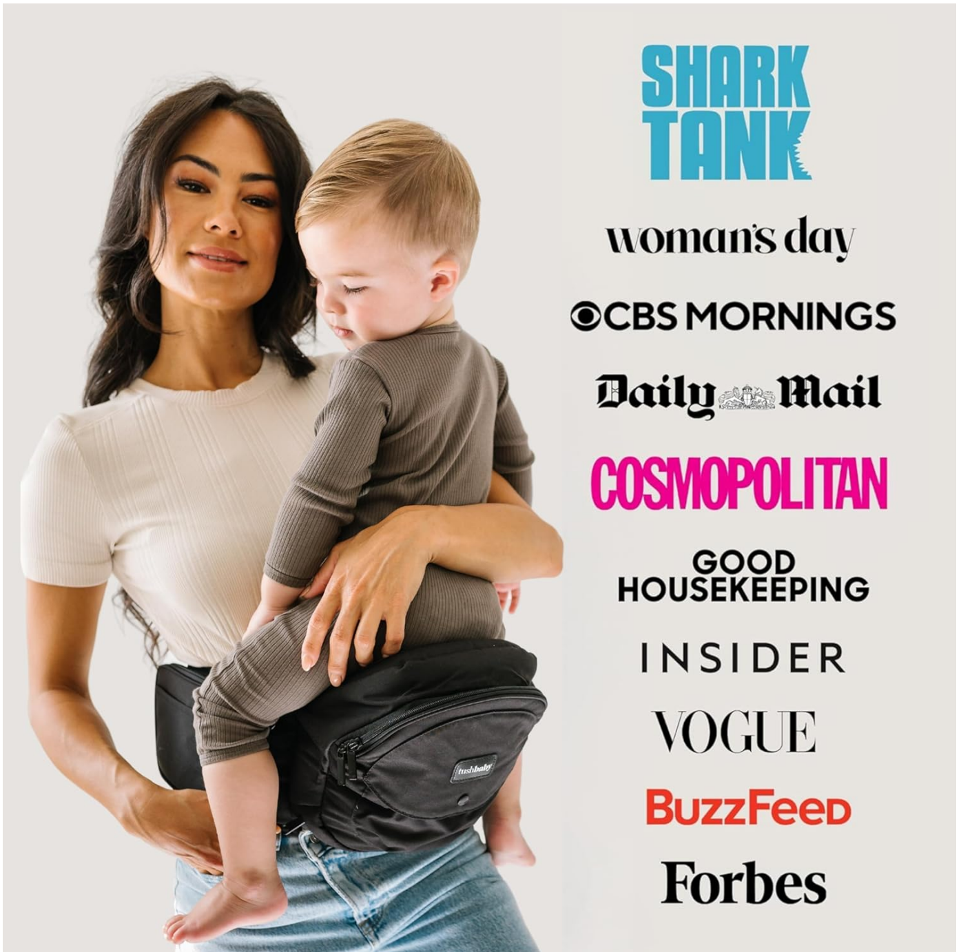
Image: A caregiver carrying a toddler on the Tushbaby hip seat in a side carry position, highlighting its use for older children.