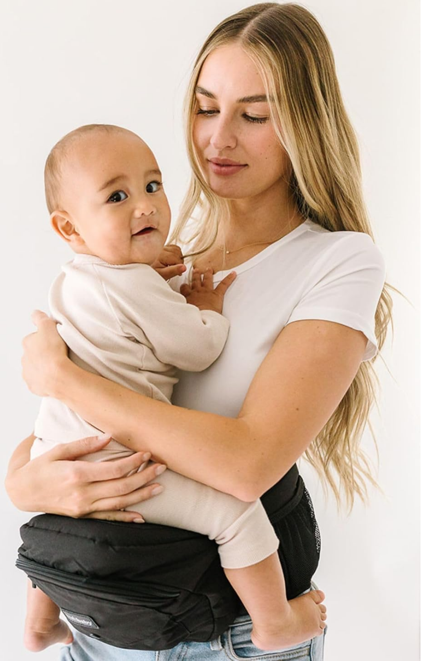
Image: A caregiver holding a baby in the face-to-face position using the Tushbaby hip seat, demonstrating one of the versatile carrying options.