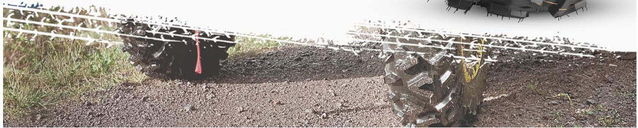
Close-up view of the tire's unique directional tread pattern, emphasizing its design for grip and durability.