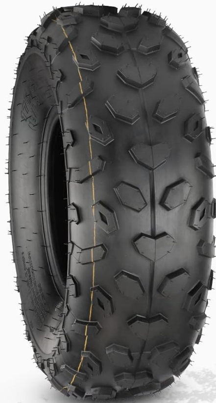
Image showing the MaxAuto ATV Tire 19x7-8, highlighting its robust tread pattern and sidewall markings.