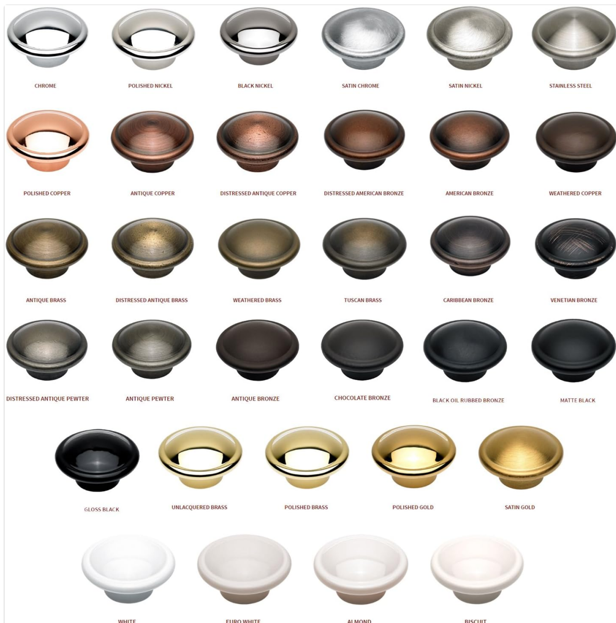
Image 4: A comprehensive chart displaying various finishes available for Waterstone products, including Polished Nickel, Chrome, Antique Bronze, and many others.