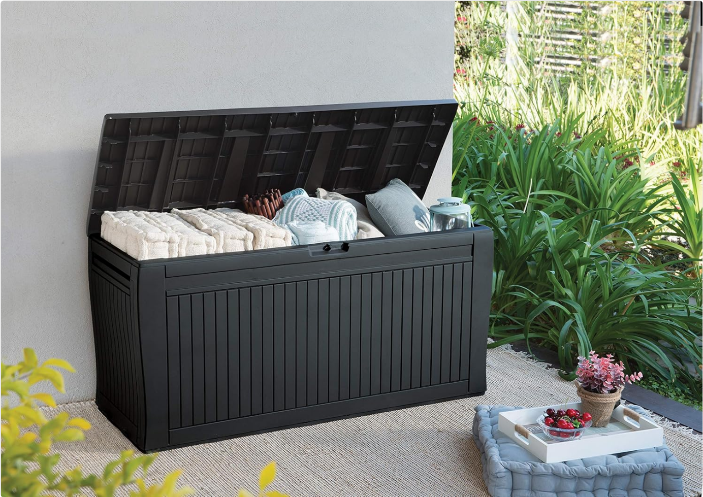
Figure 4: Storage box with lid open, showing internal capacity for cushions.

seating option. Ensure the lid is fully closed and secure before sitting.