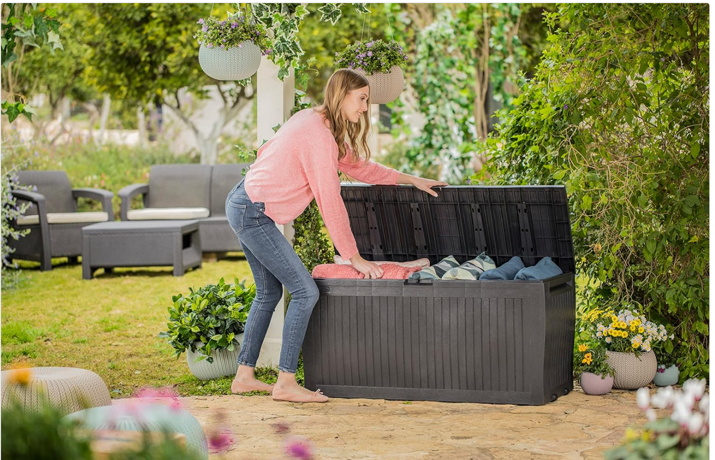
Figure 7: User interacting with the storage box.