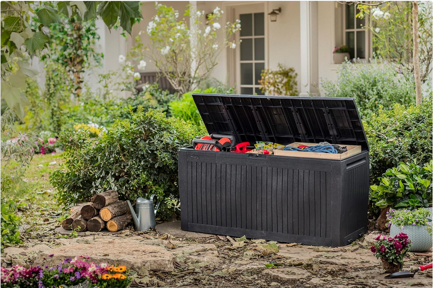
Figure 6: Storage box with lid open, showing internal capacity for garden tools.