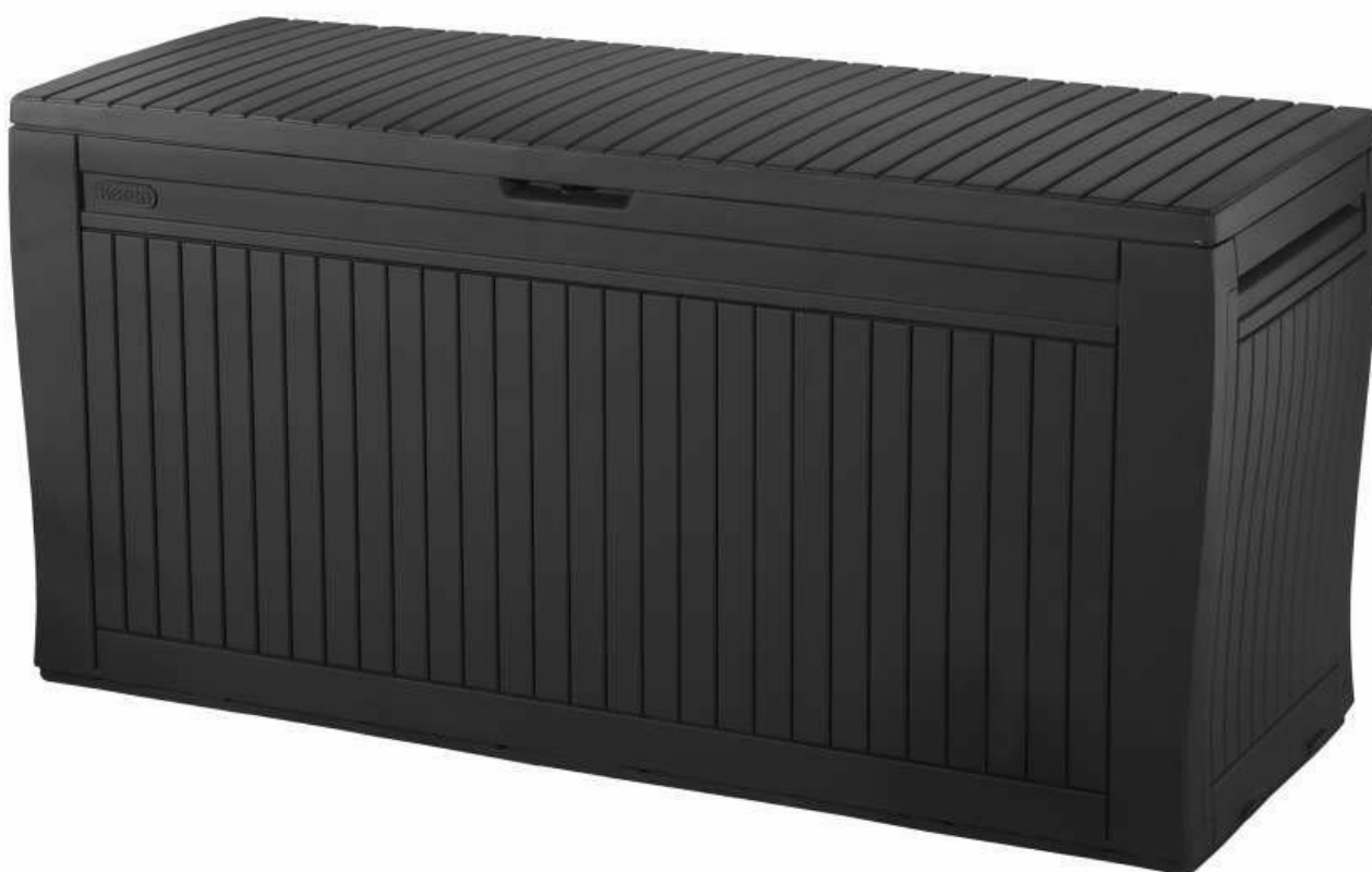
Figure 2: Components of the Keter Comfy Storage Box