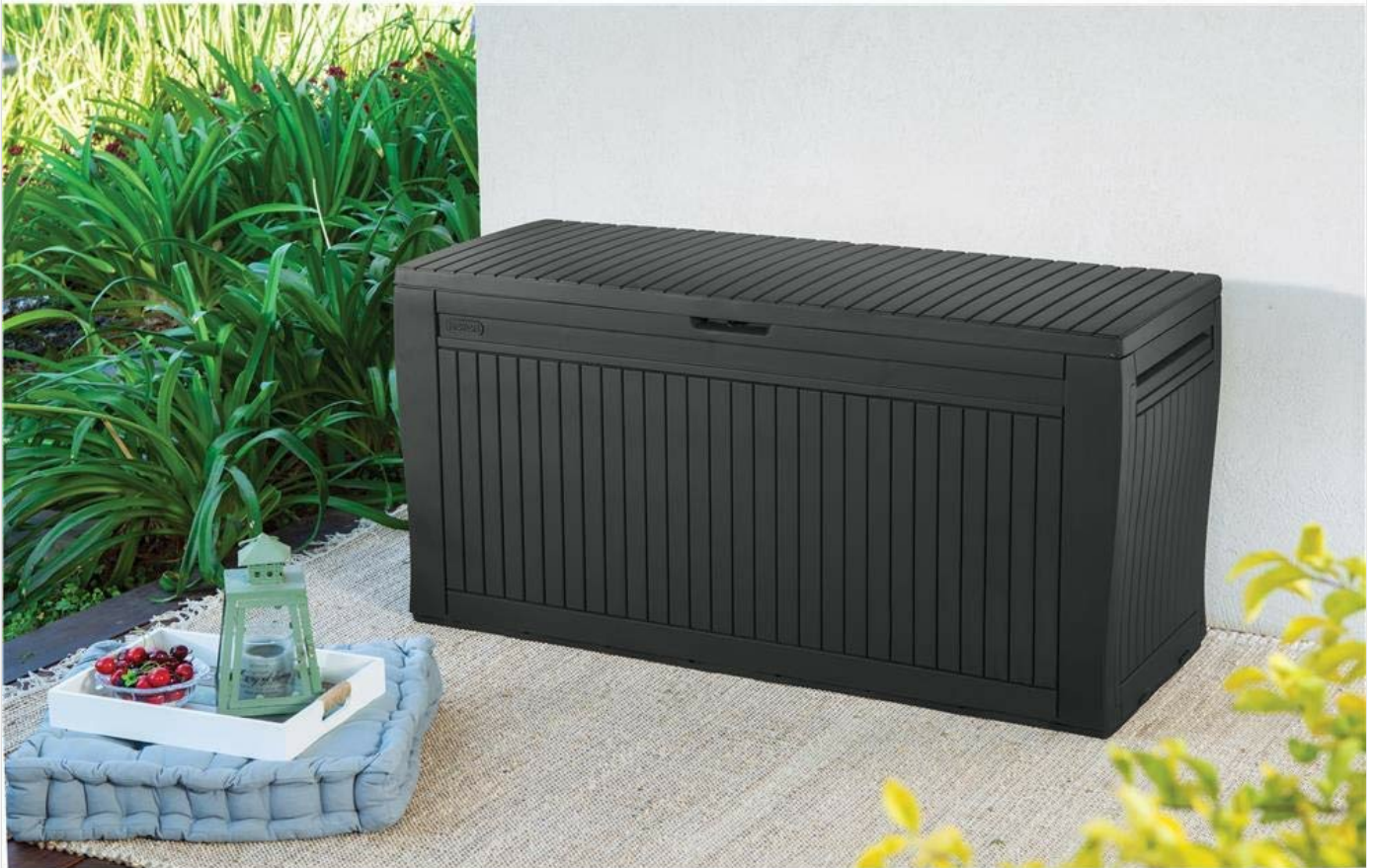
Figure 3: Assembled Keter Comfy Storage Box in a garden setting