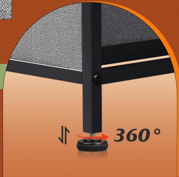
Figure 2: Detail of fabric drawer material and adjustable foot.