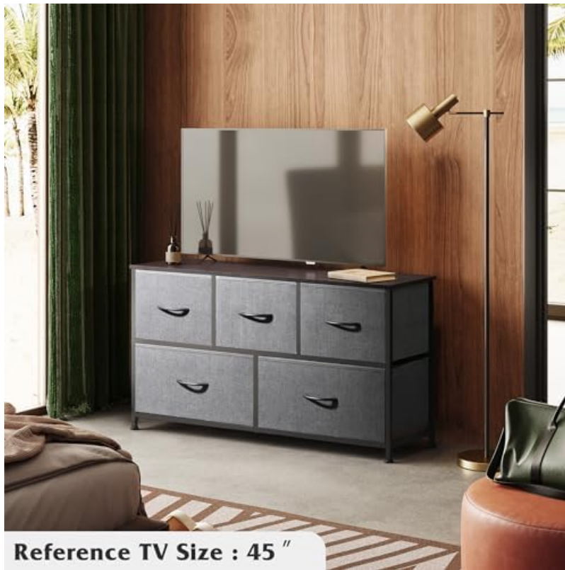
Figure 4: WLIVE dresser functioning as a TV stand.