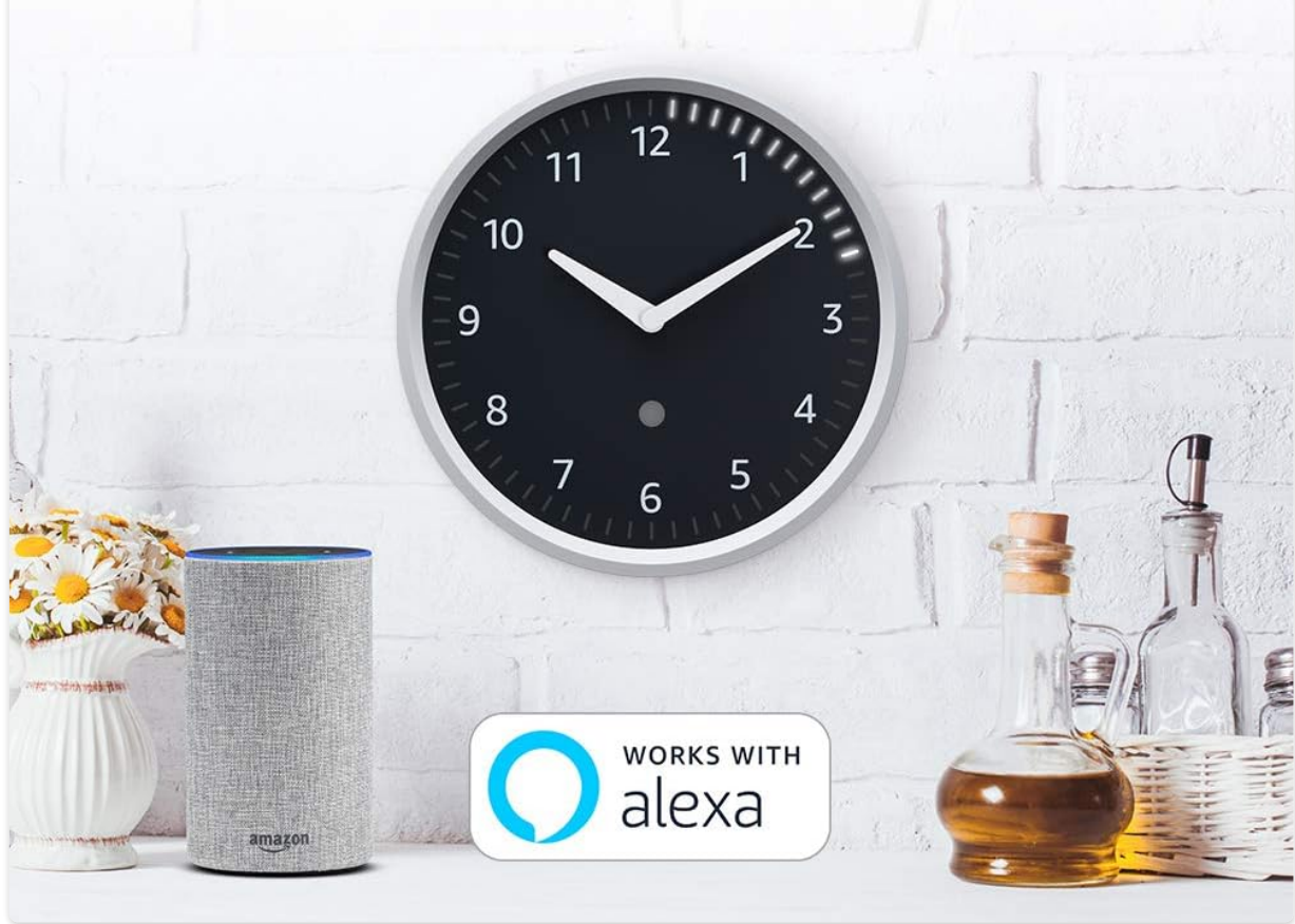
Image: The Amazon Echo Wall Clock displayed alongside a compatible Echo speaker.

An Echo companion to see timers at a glance