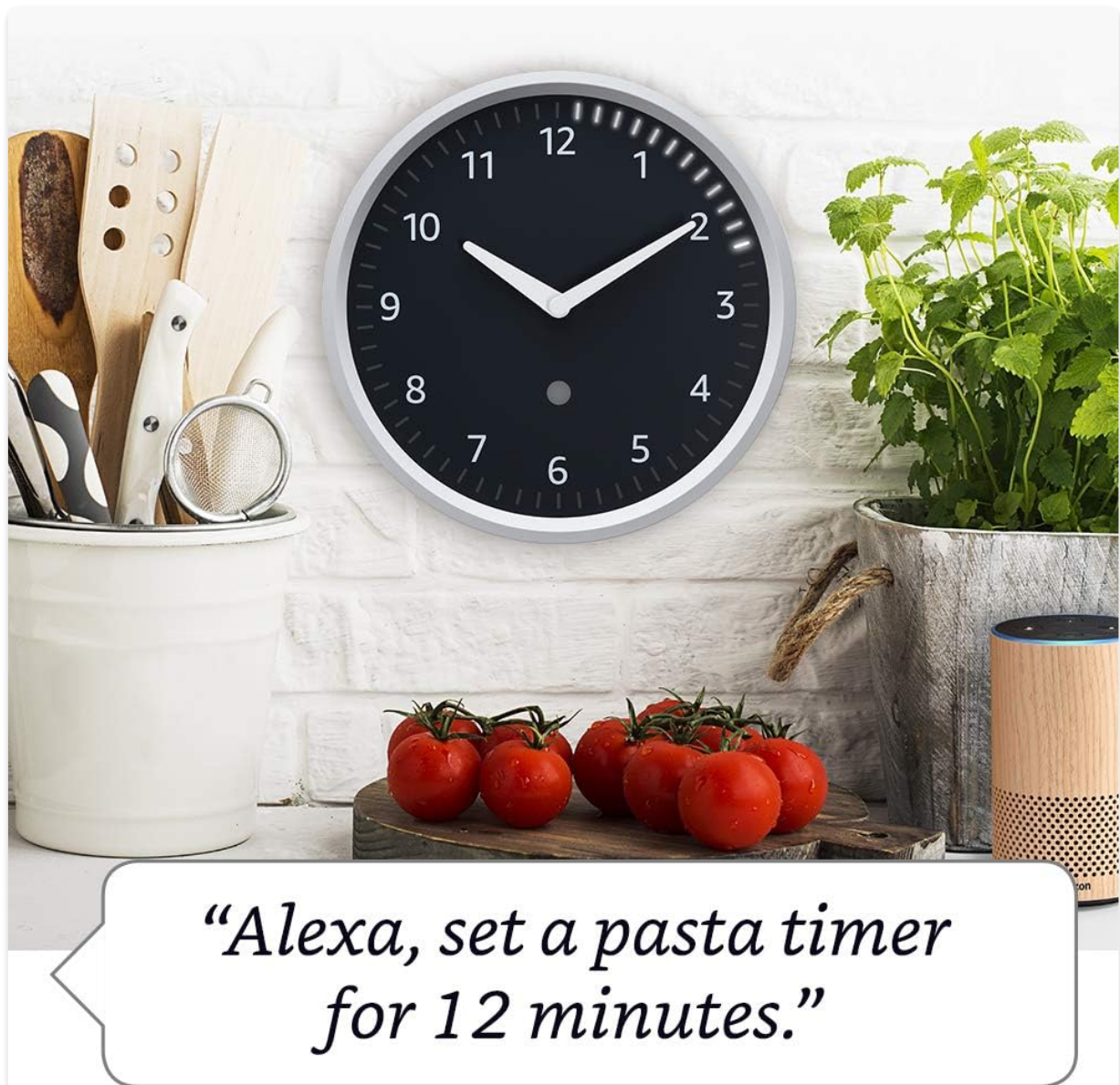
Image: A kitchen scene where a user is setting a pasta timer via voice command, and the Echo Wall Clock is showing the timer's progress.