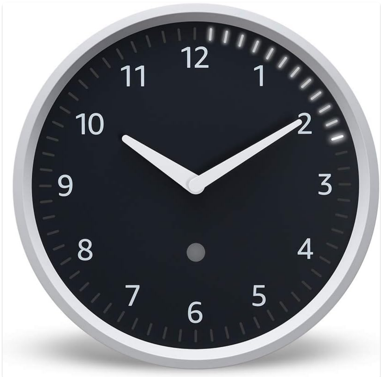
Image: A detailed view of the Echo Wall Clock's face, showing the analog hands and minute markers.

The Echo Wall Clock features a classic analog display with hour and minute hands, providing a clear view of the current time.