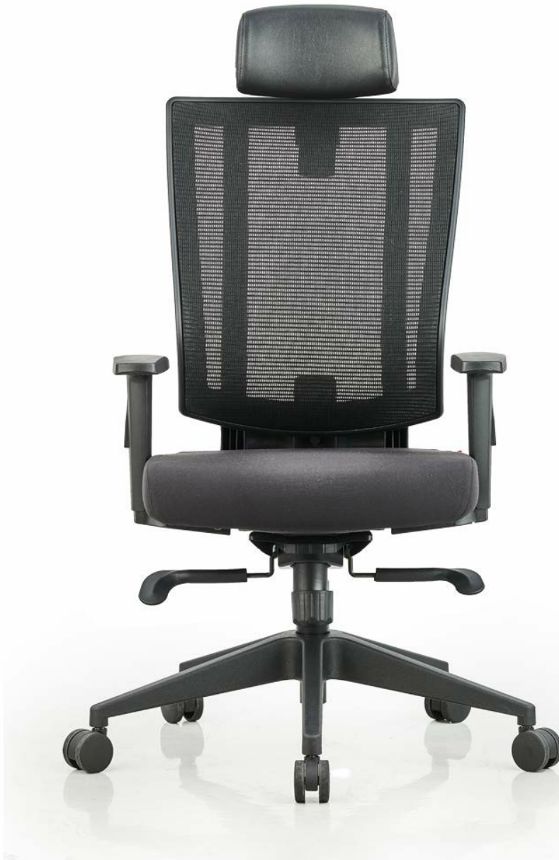
Figure 1: Front view of the Featherlite Liberate High Back Desk Arm Chair. This image shows the chair fully assembled, highlighting its mesh backrest, upholstered seat, and adjustable armrests.