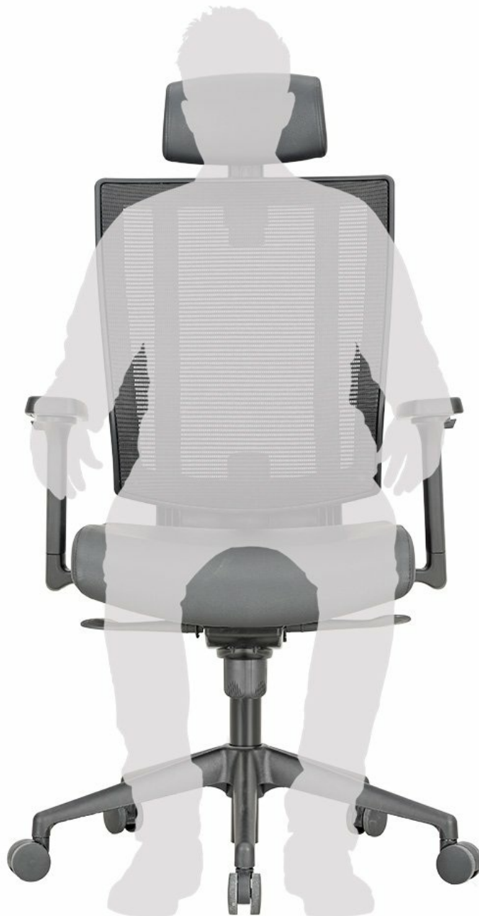
Figure 2: Ergonomic illustration of a user in the Featherlite Liberate chair. This image demonstrates how the chair supports the user's posture and provides a visual reference for proper seating.