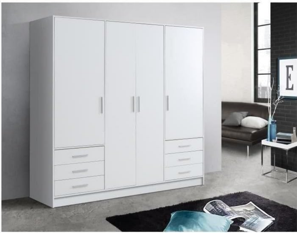
Figure 2: The Forte Jupiter Wardrobe 200 210 integrated into a bedroom setting, demonstrating its size and aesthetic.