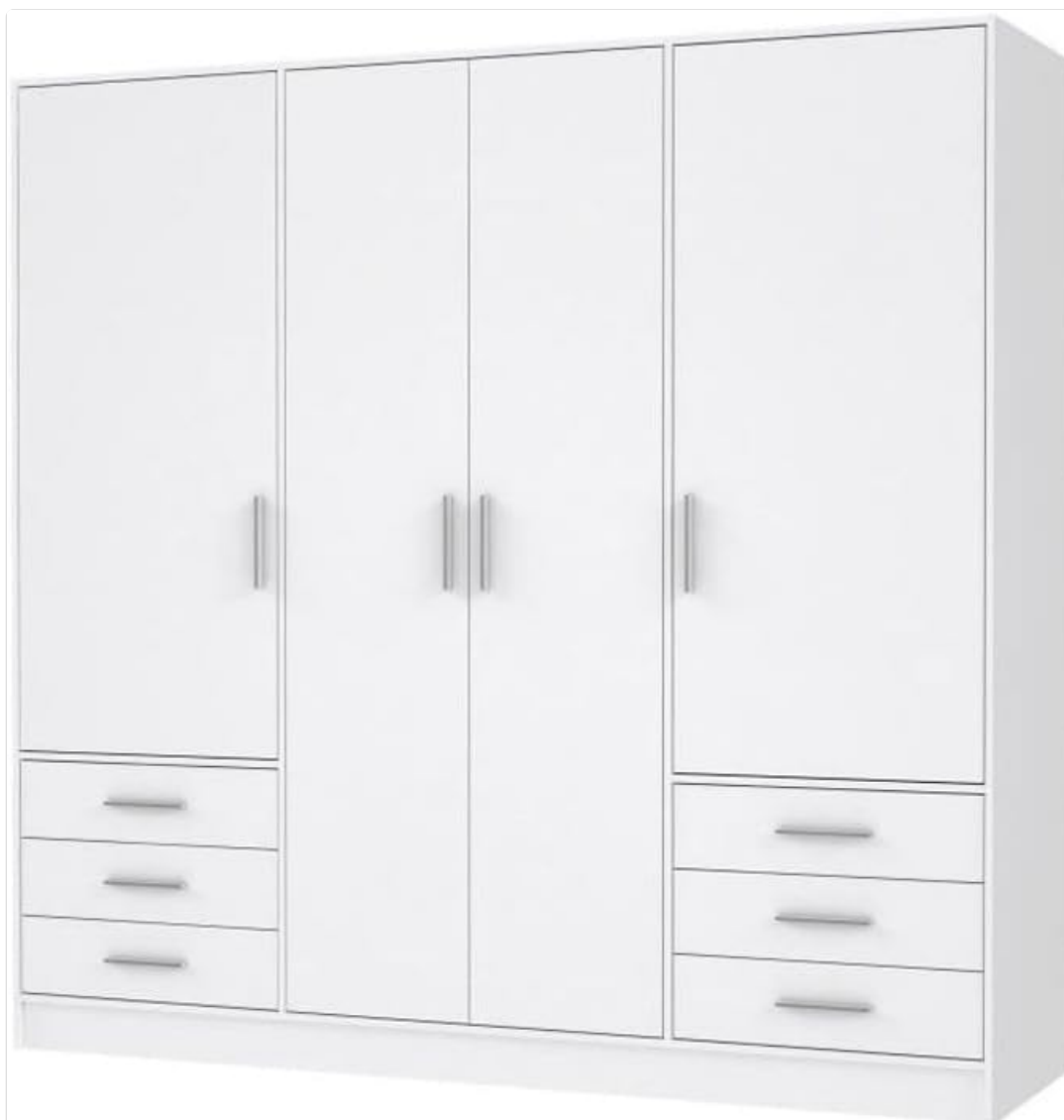
Figure 1: Front view of the Forte Jupiter Wardrobe 200 210, showcasing its four doors and six drawers.

The Forte Jupiter Wardrobe 200 210 is a spacious 4-door wardrobe designed to provide ample storage for your clothing and personal items. It features a clean white finish, with a central section offering a shelf and a hanging rail, and two side sections each equipped with two shelves and three drawers for smaller garments. This wardrobe is delivered disassembled and requires assembly.