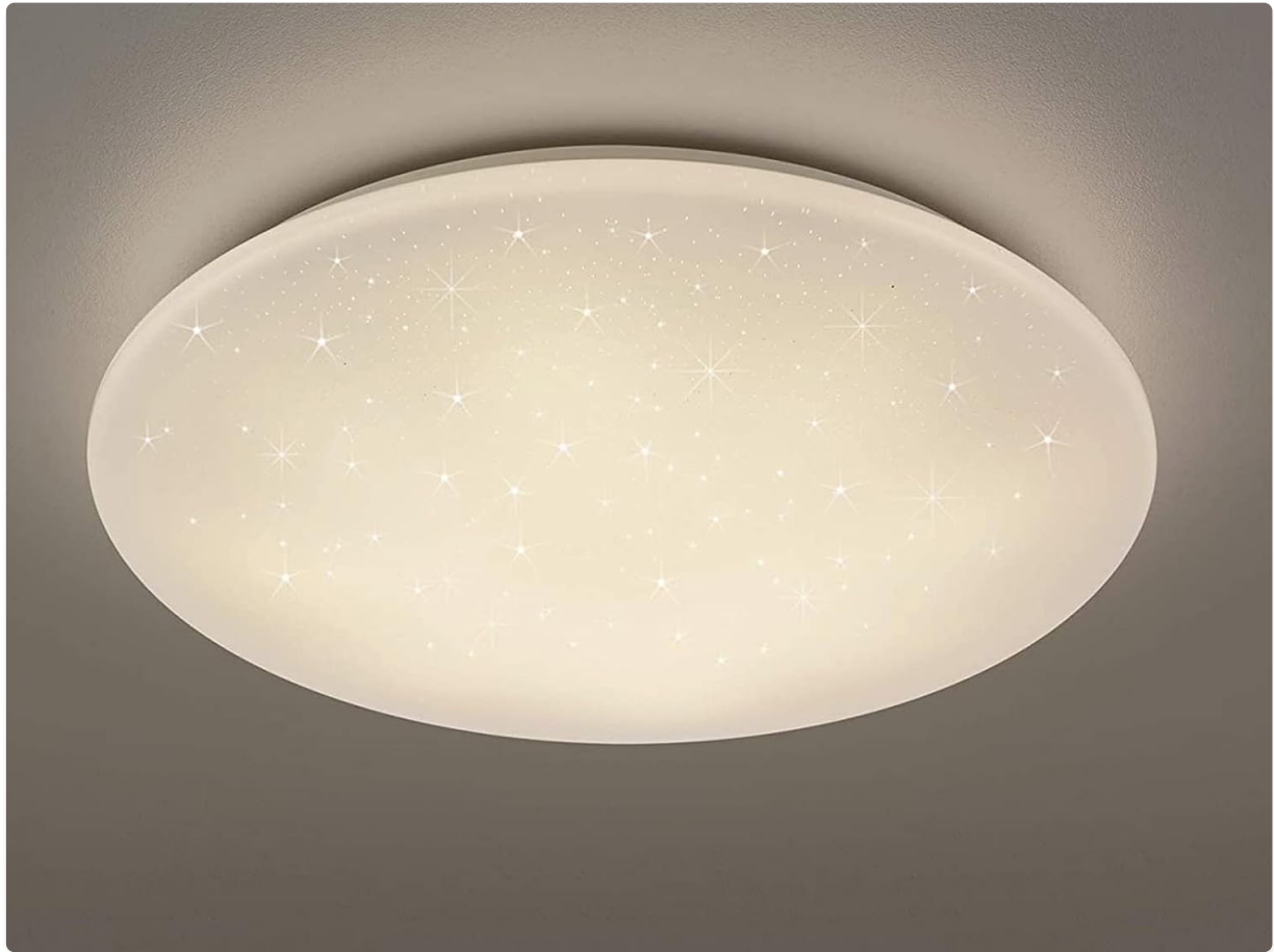
Image: The ceiling light illuminated with warm white light (approx. 3000K).