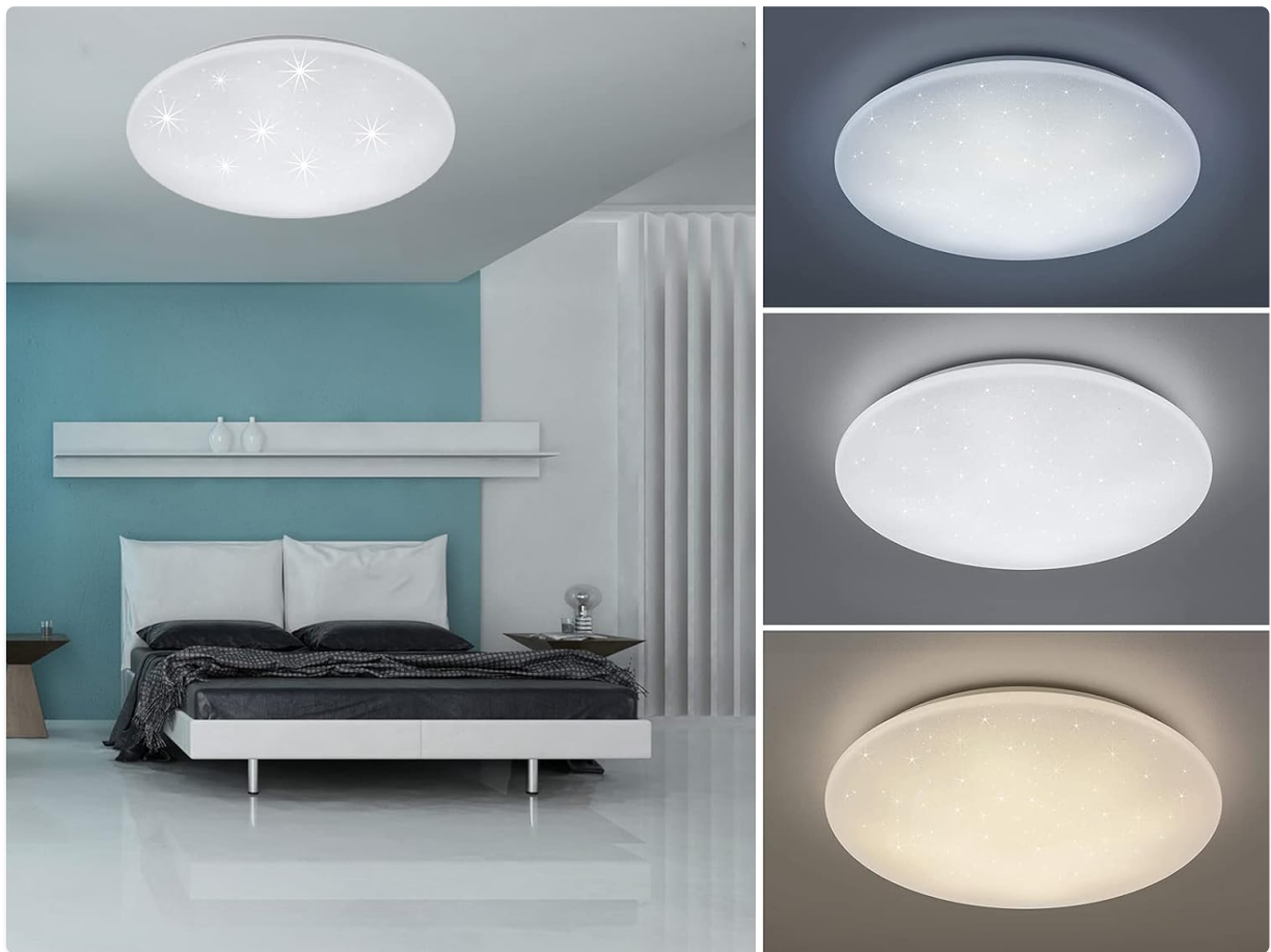
Image: The Kato R67609100 LED Ceiling Light installed, demonstrating its aesthetic and lighting capabilities.