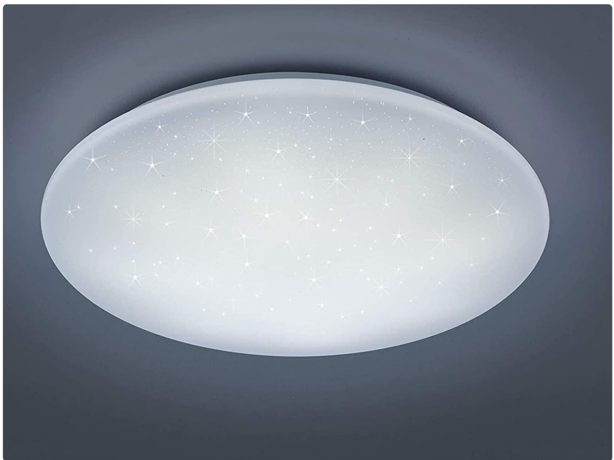
Image: The ceiling light illuminated with cool white light (approx. 5500K).