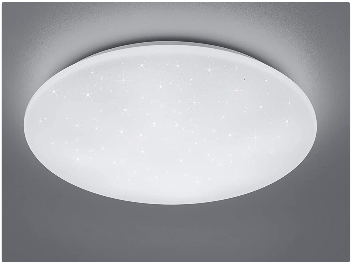
Image: The ceiling light illuminated with neutral white light.