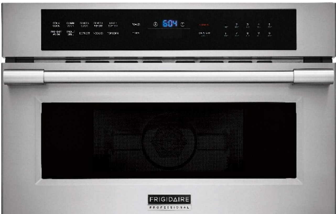
Figure 1: Front view of the Frigidaire FPMO3077TF Convection Microwave Oven.

The Frigidaire FPMO3077TF is a versatile 1.6 cu. ft. capacity appliance featuring 1750 watts of power and 9 power levels. It combines the functionality of a microwave and a convection oven, offering Power Sense Cooking Technology, Power Sense Auto Defrost, Power Sense Broil & Grill, Power Bright LED lighting, and a Keep Warm function with an adjustable timer. Its smudge-proof stainless steel finish ensures durability and ease of cleaning.