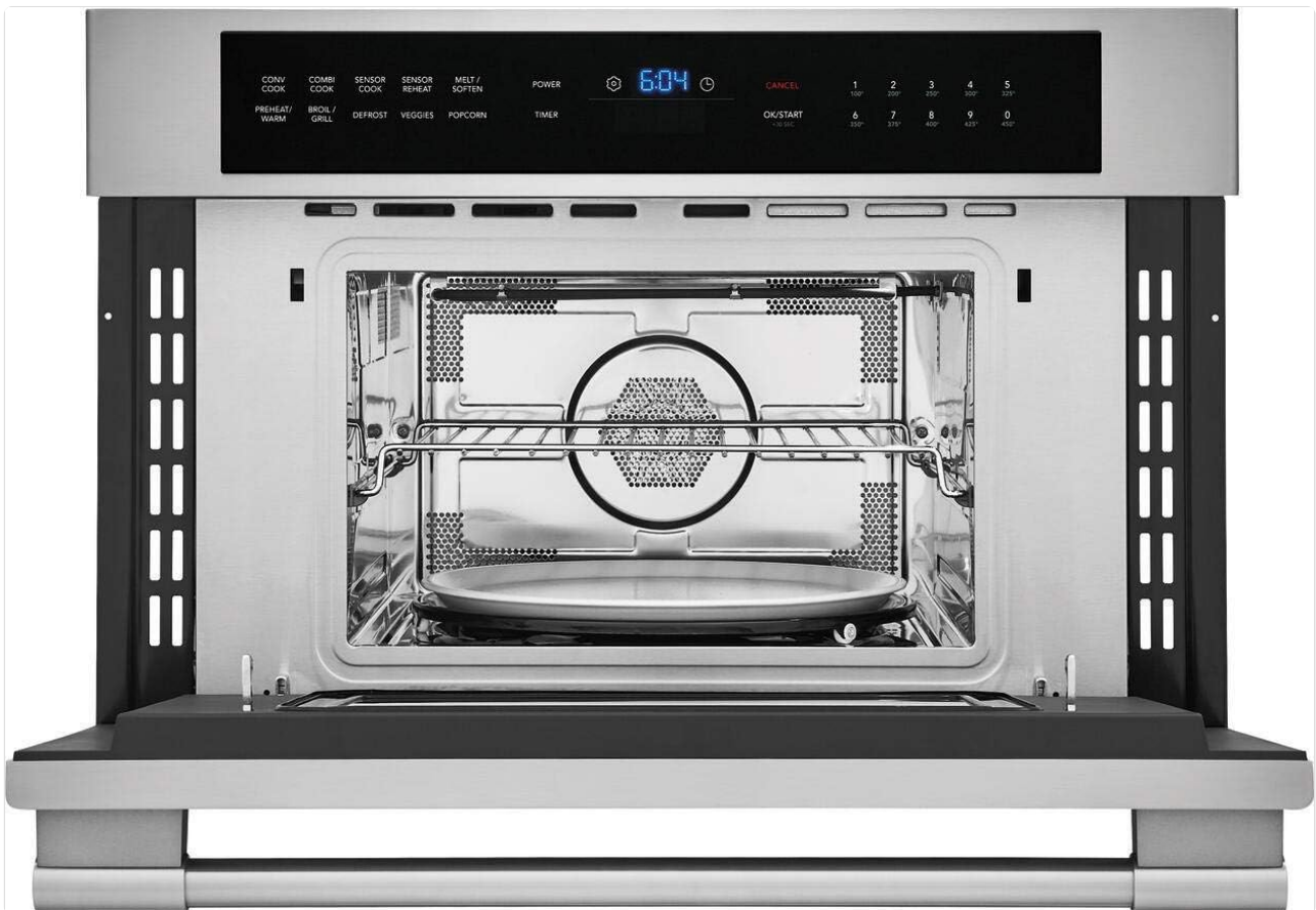
Figure 3: Interior view showcasing the removable metal rack and rotating ceramic plate.