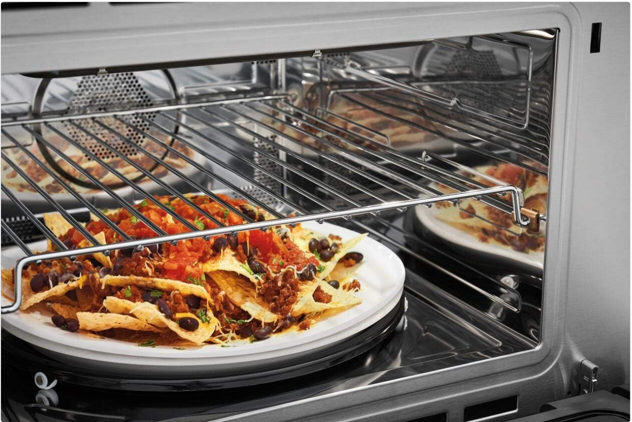
Figure 4: Example of food being prepared using the broil/grill function on the metal rack.