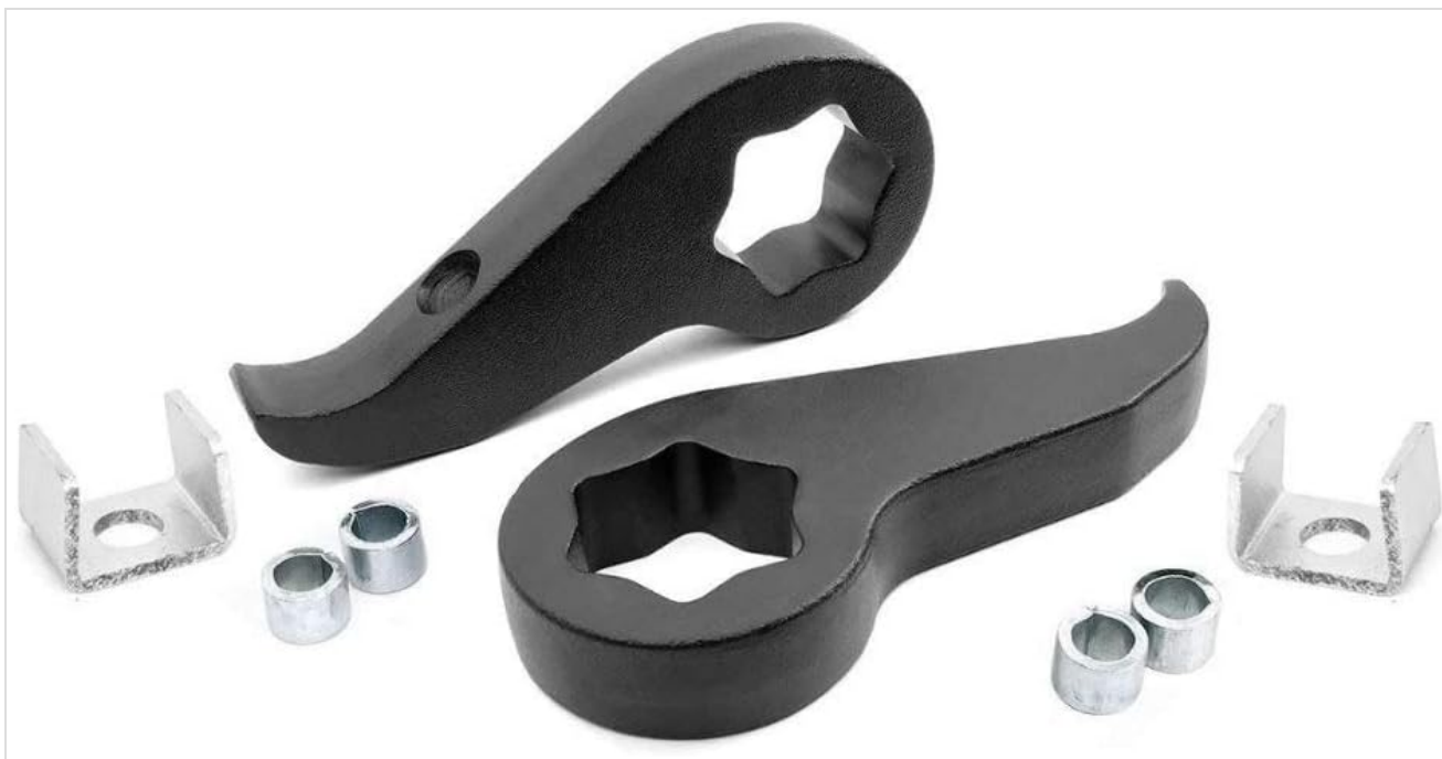
Heavy-duty torsion bar keys, providing enhanced rigidity.