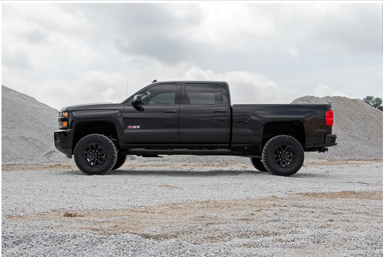
Image: Side profile of a truck showcasing the increased ride height from the lift kit.