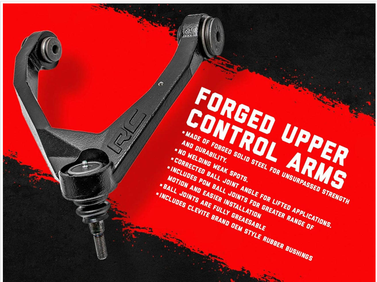
Image: Forged Upper Control Arms, designed for strength and durability.