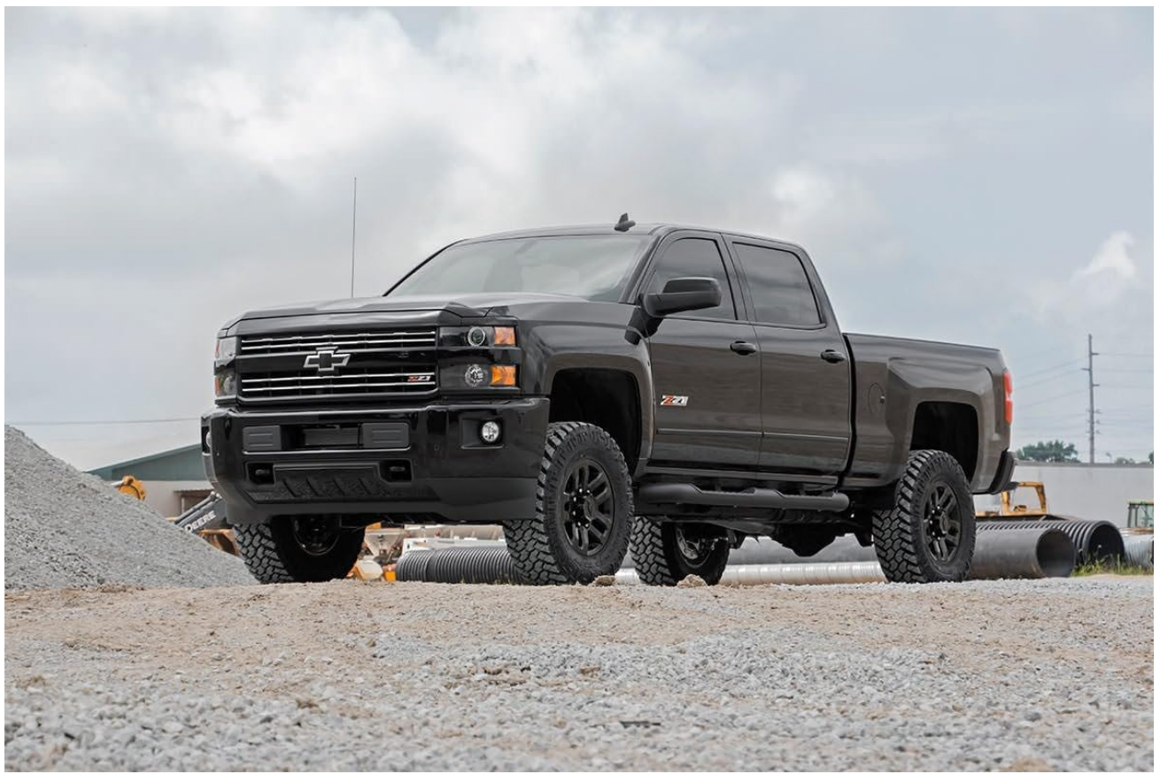
Image: Front view of a truck equipped with the 3.5-inch lift kit.

The included N3 Shock Absorbers are engineered to provide a balanced ride quality for both on-road and light off-road conditions. You may notice a change in the vehicle's center of gravity; always drive cautiously, especially when cornering or on uneven terrain.