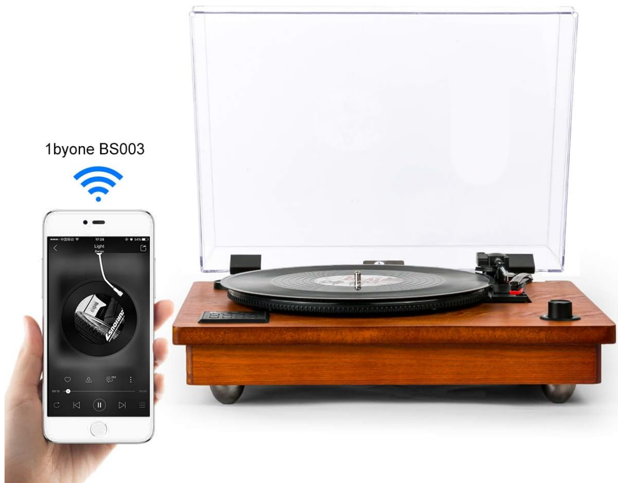
Figure 3: Bluetooth Pairing

Enjoy your favorite music wireless via your mobile phones tablets and other wireless audio devices.