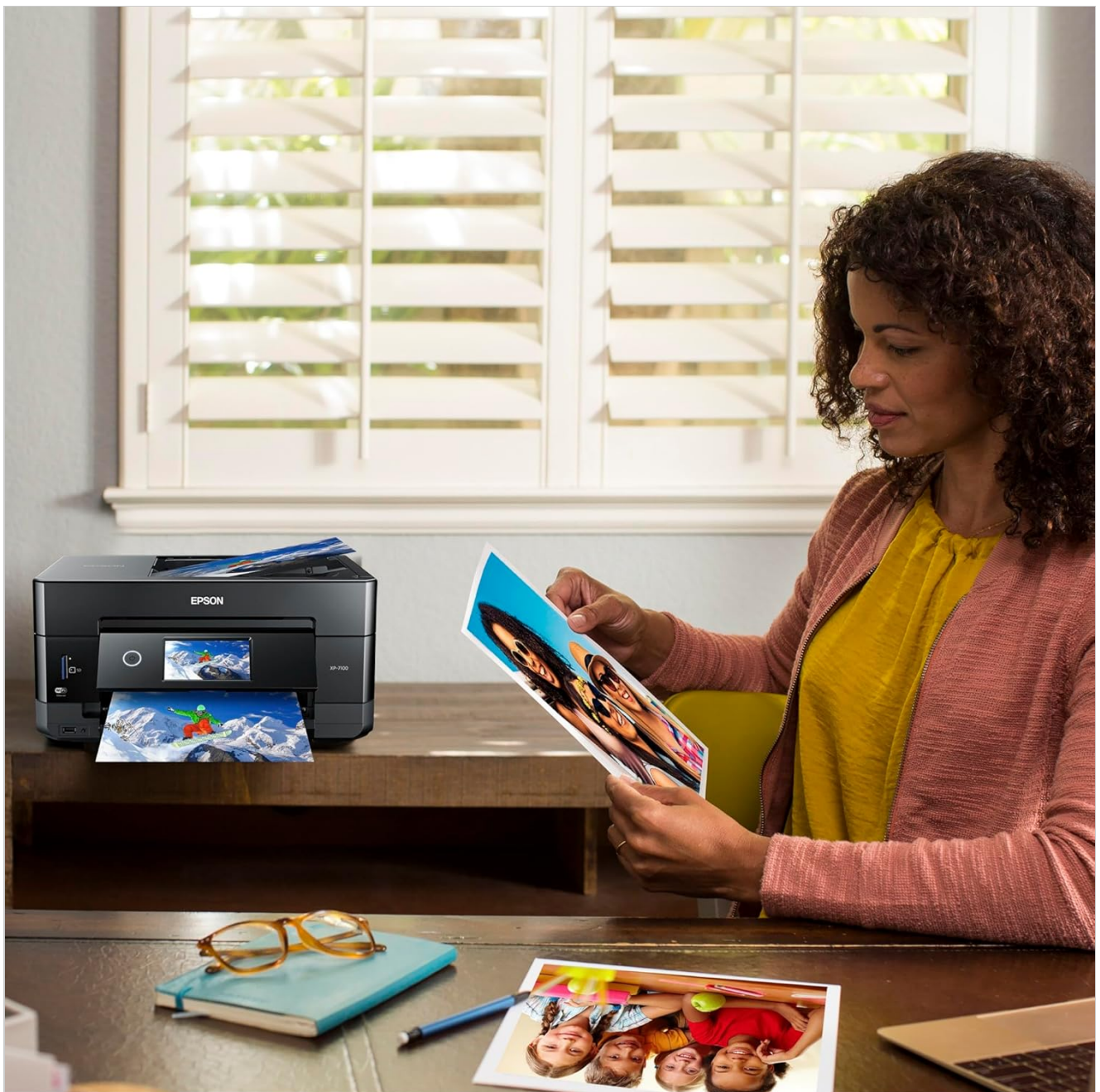
Image: A user examining printed photos, with the Epson XP-7100 printer visible in the background, demonstrating its use in a home setting.