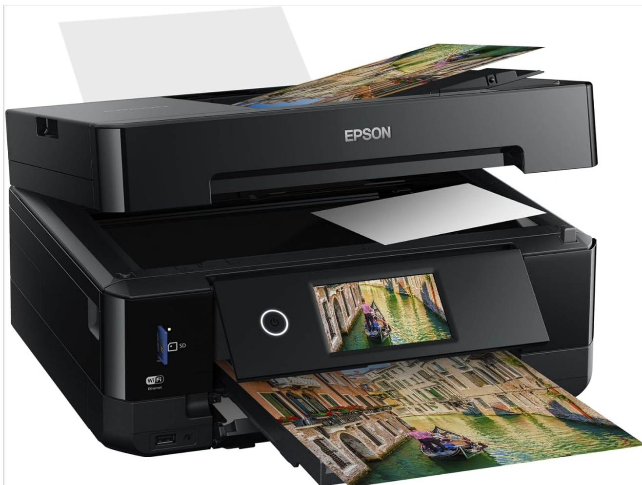
Image: The printer with paper loaded in both the rear specialty media feed and the front paper tray, ready for printing.