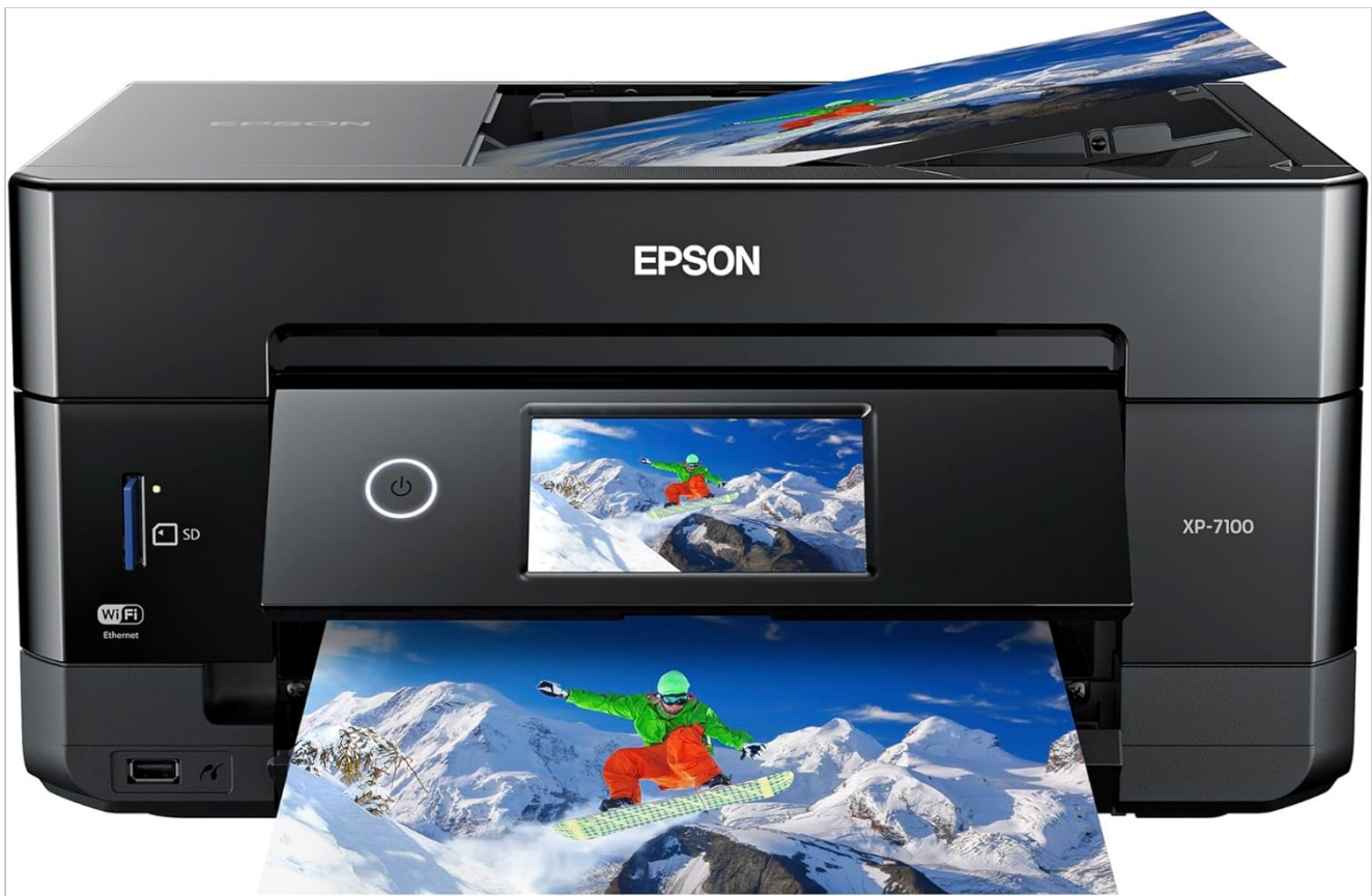
Image: The Epson Expression Premium XP-7100 printer, showcasing its compact design and a vibrant photo being printed from the front tray.