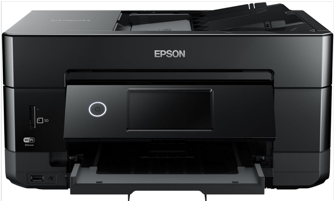
Image: The Epson XP-7100 printer with its automatic output tray extended, ready to receive printed documents.