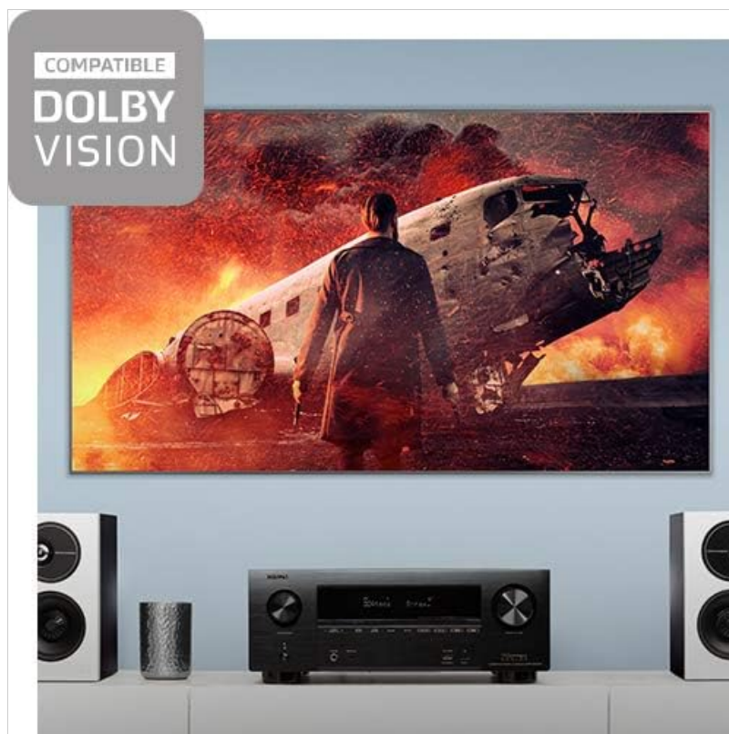
Image: A home theater setup featuring the Denon AVR-X3500H receiver and a television displaying a vibrant movie scene, accompanied by a 'Compatible Dolby Vision' label. This highlights the receiver's support for advanced HDR video technology.

Experience ultra-detailed picture quality with support for 4K Ultra HD, Dolby Vision, HDR10, HLG, BT.2020, and Wide Color Gamut. The advanced HDMI section ensures optimal clarity, contrast, and color for your movies, shows, and games.