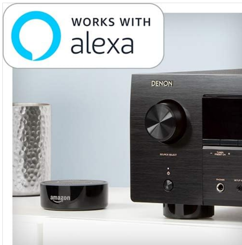
Image: The Denon AVR-X3500H receiver positioned next to an Amazon Echo Dot, illustrating its compatibility with Amazon Alexa for voice control. This allows users to manage receiver functions with simple voice commands.