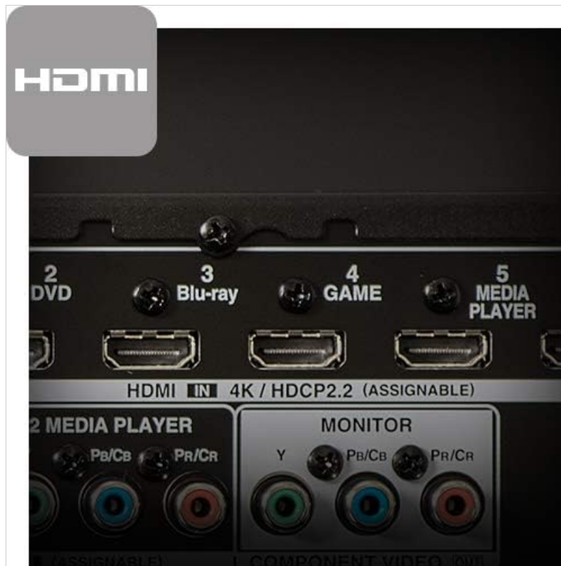
Image: Rear view of the Denon AVR-X3500H receiver, highlighting the HDMI input ports. The receiver features multiple HDMI inputs (8 in/3 out) with HDCP 2.2 support, essential for connecting various 4K Ultra HD devices.