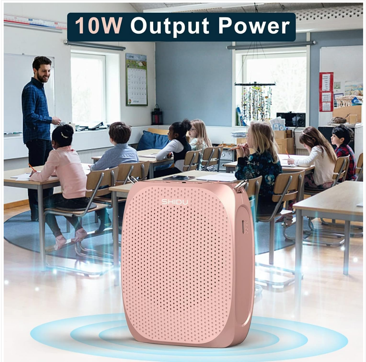
Image: The SHIDU Voice Amplifier effectively projecting sound in a classroom environment, showcasing its 10W output capability.

Connect your mobile phone, computer, or other audio device to the amplifier's microphone port using a 3.5mm AUX cable. The amplifier will function as an external wired speaker for your device.