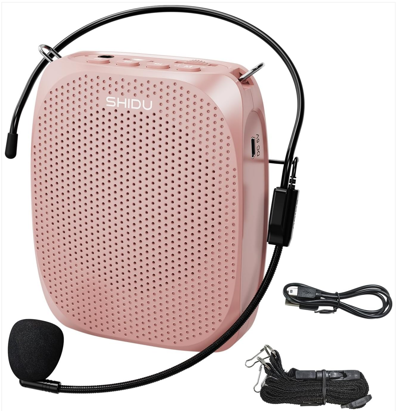
Image: The SHIDU S258 Voice Amplifier in Rose-Gold, shown with its accompanying headset microphone and charging cable.