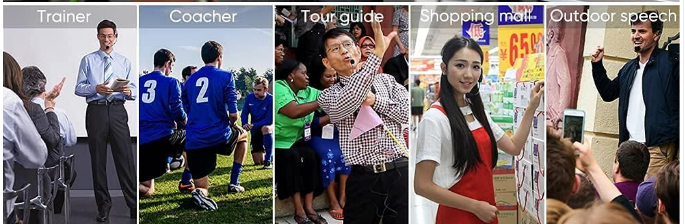
Image: Demonstrations of the SHIDU Voice Amplifier being used in different professional settings, highlighting its versatility.