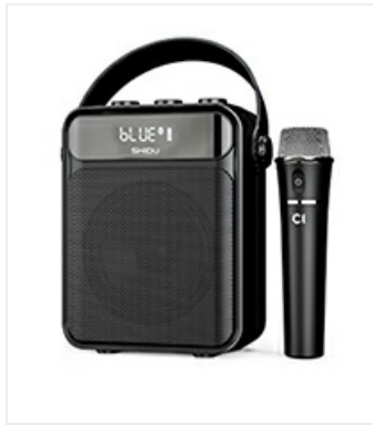
Image: The complete set of items included in the SHIDU Voice Amplifier package.