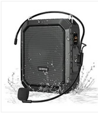
Image: A visual guide to the amplifier's connectivity options and control functions, such as AUX, USB, and TF card playback.