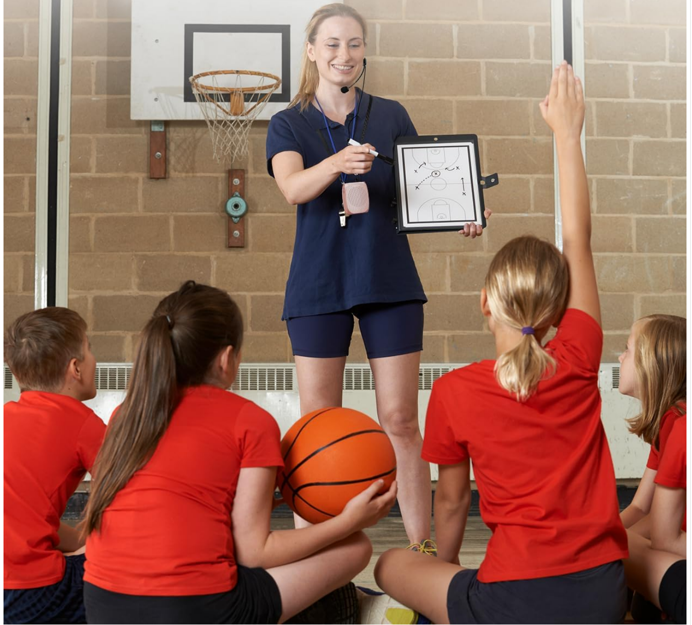
Image: The SHIDU Voice Amplifier's coverage capability, demonstrating its effectiveness in large spaces.