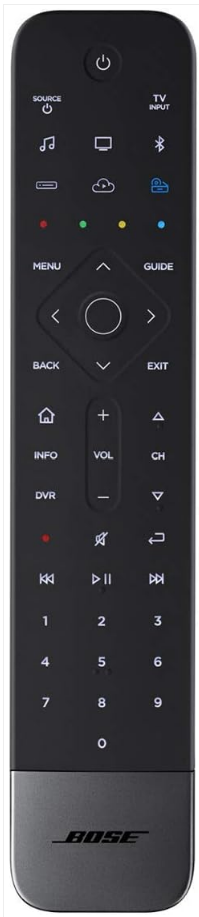
Figure 4.1: Front view of the Bose Soundbar Universal Remote Control.