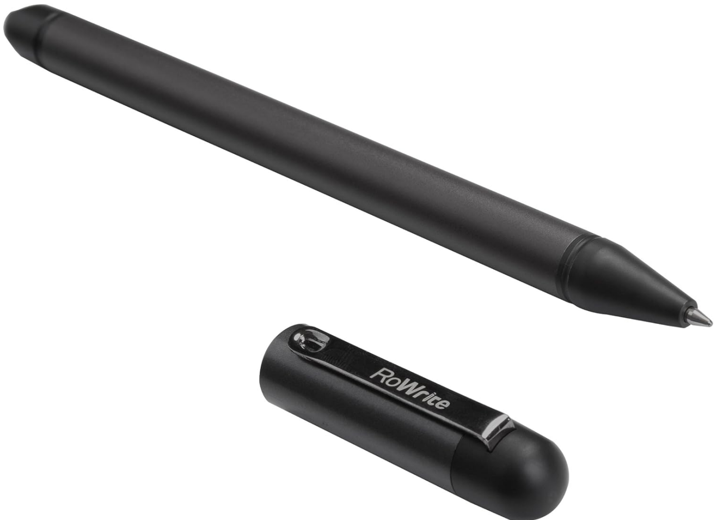
Figure 3.1: Royole RoWrite pressure-sensitive pen.

The pressure-sensitive pen requires a Lithium Ion battery (included). Unscrew the pen barrel, insert the battery according to the polarity indicators, and reassemble the pen.