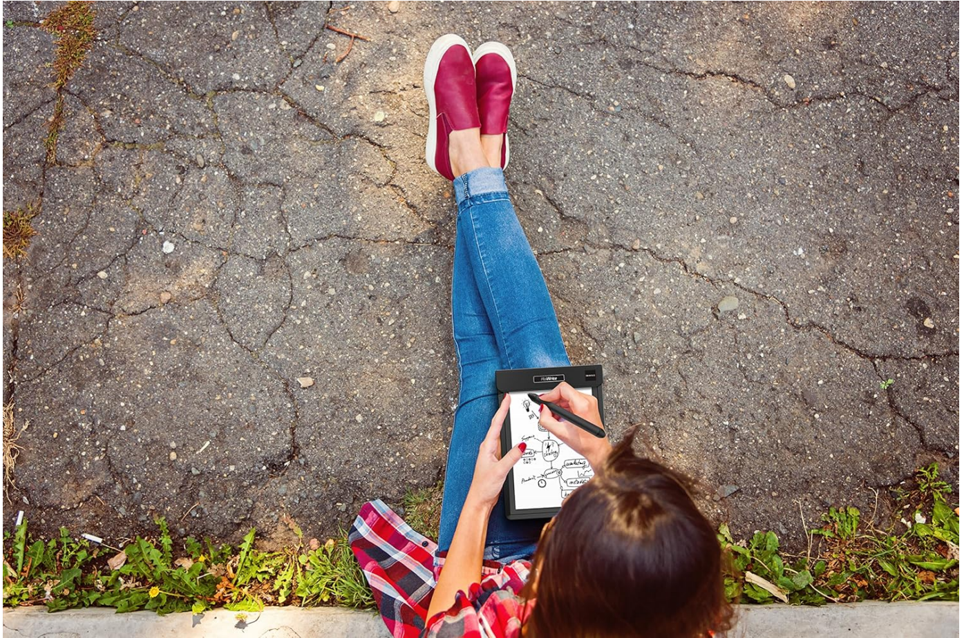
Figure 4.3: RoWrite in an outdoor setting.

The RoWrite is portable and can be used in various settings, from office meetings to outdoor sketching, allowing for flexible note-taking and creative expression.