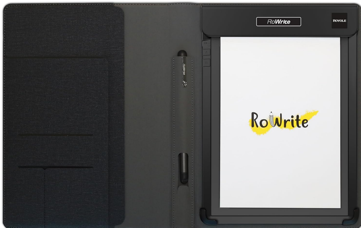
Figure 1.1: Royole RoWrite Smart Writing Pad in open position.

The Royole RoWrite is an innovative smart writing pad designed to bridge the gap between traditional handwriting and digital convenience. It allows you to capture your notes, sketches, and drawings in real-time as digital files, while still using your preferred paper and a standard ballpoint pen. The captured content can be stored, edited, and shared via the dedicated RoWrite app on your smartphone or tablet.