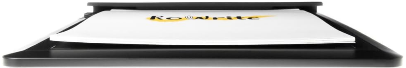
Figure 3.2: Correct placement of paper on the RoWrite pad.

Place the RoWrite notepad (or any standard A5 paper) onto the writing surface of the RoWrite pad. Ensure it is aligned correctly within the designated area for optimal capture.