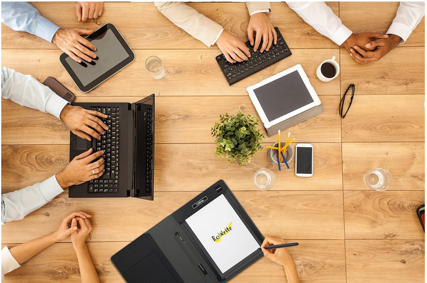
Figure 4.4: RoWrite used in a collaborative environment.