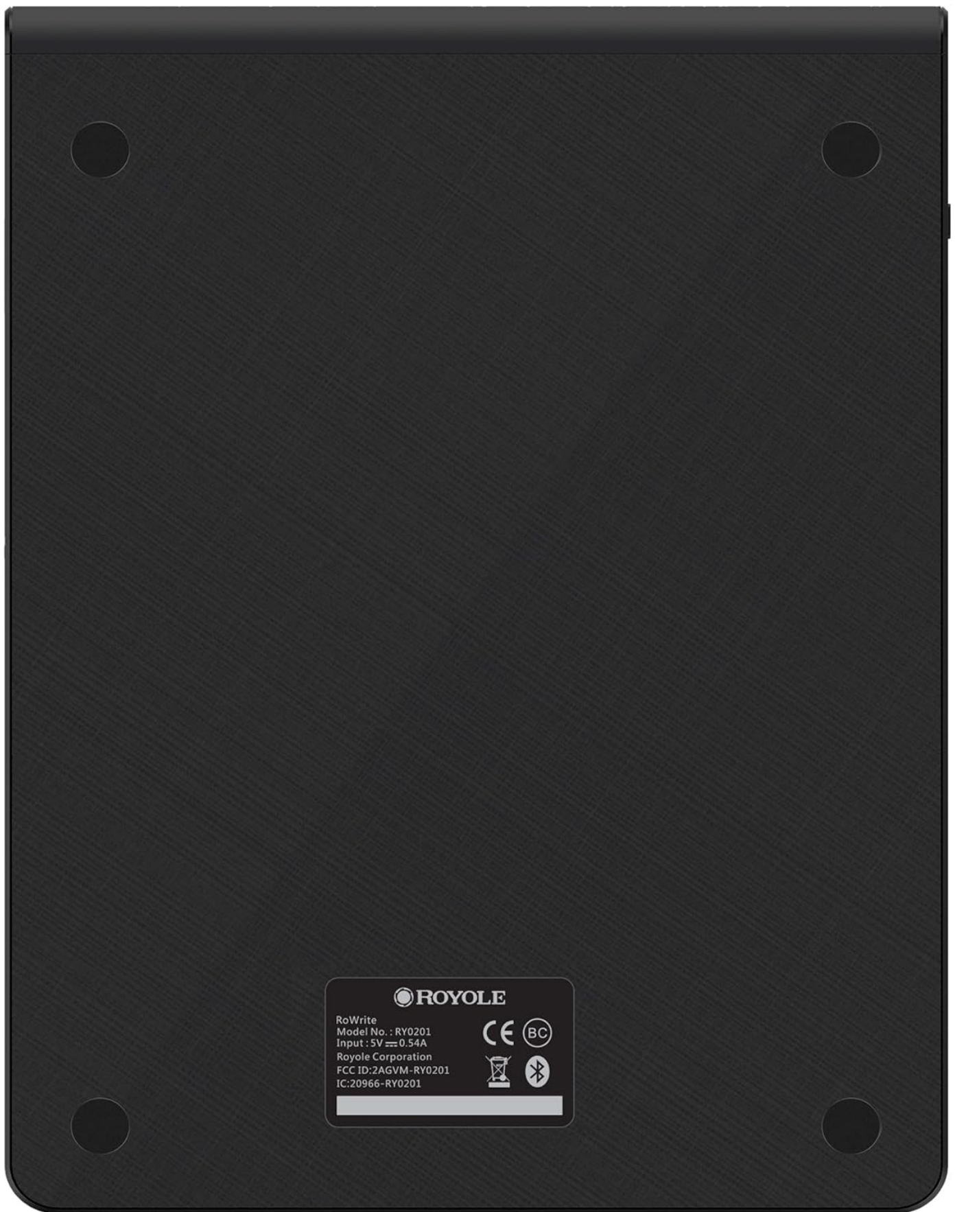
Figure 7.1: Back view of the RoWrite pad.