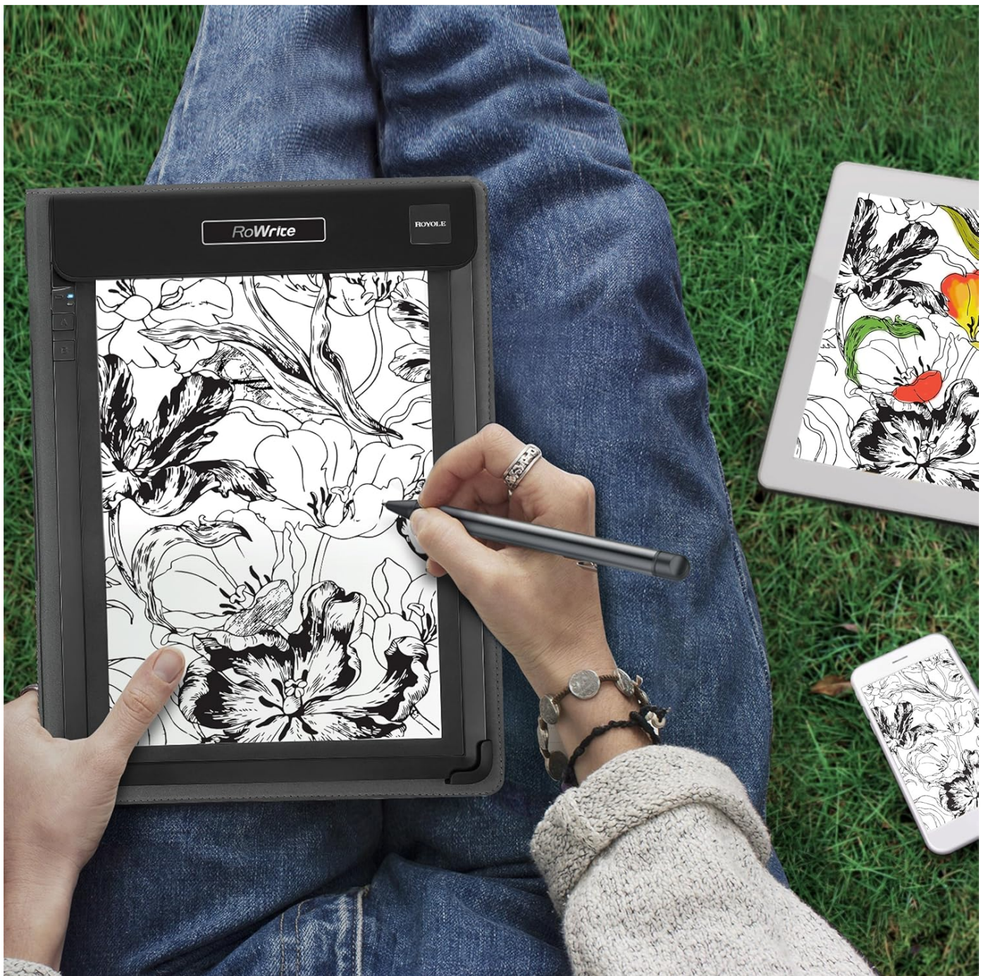
Figure 4.2: Drawing on the RoWrite pad.