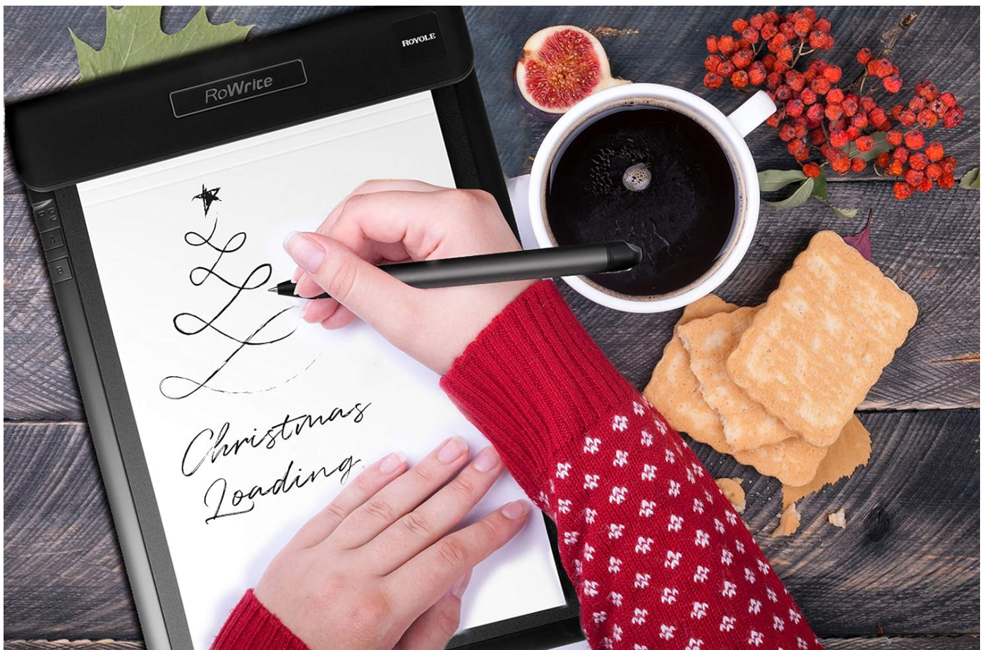
Figure 4.1: Writing on the RoWrite pad.

Once the pad is paired and paper is in place, simply write or draw on the paper with the pressure-sensitive pen as you normally would. The RoWrite pad will automatically digitize your strokes in real-time and display them in the connected app.