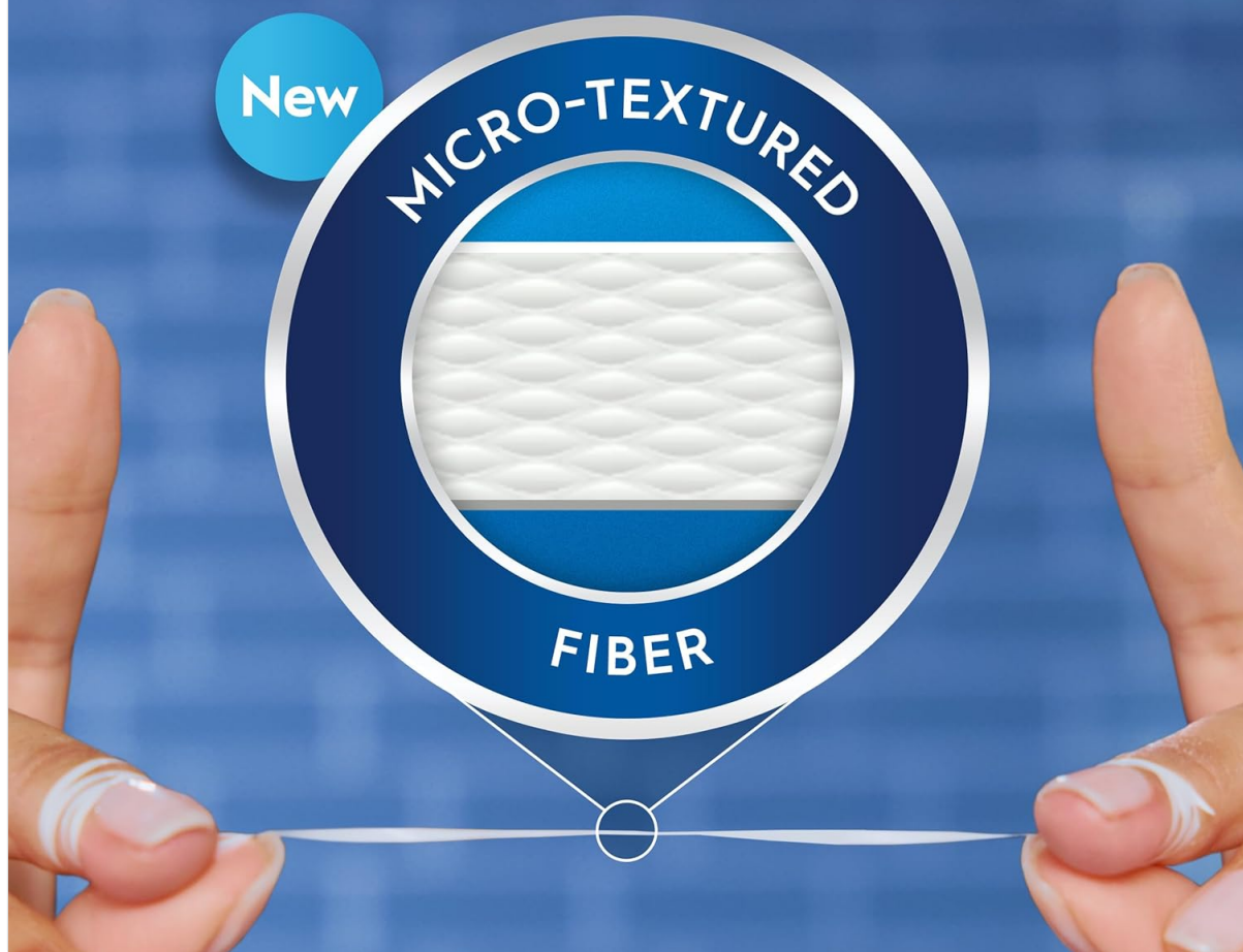
Image: A close-up view of the Oral-B Glide floss, emphasizing its 'Micro-Textured Fiber' which contributes to its durability and gentle sliding properties.