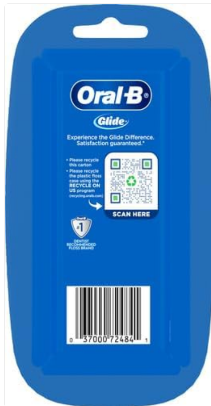
Image: The back of the Oral-B Glide floss packaging, showing the UPC barcode and a QR code for the 'Recycle on Us' program, indicating the recyclability of the plastic case and carton.