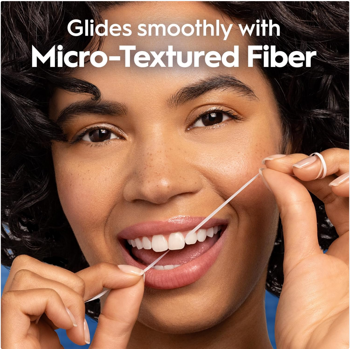
Image: A person demonstrating the proper technique of flossing with Oral-B Glide floss, showing how it glides smoothly with micro-textured fiber.