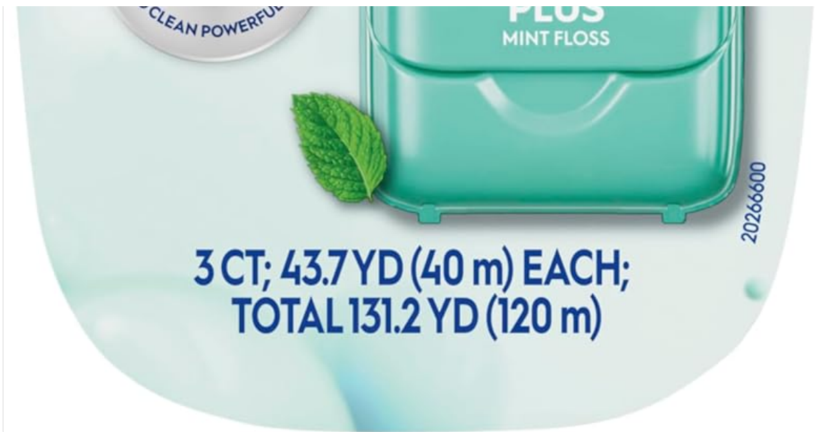
Image: Three individual Oral-B Glide Comfort Plus Mint Floss cases, as they appear when removed from the multi-pack packaging.