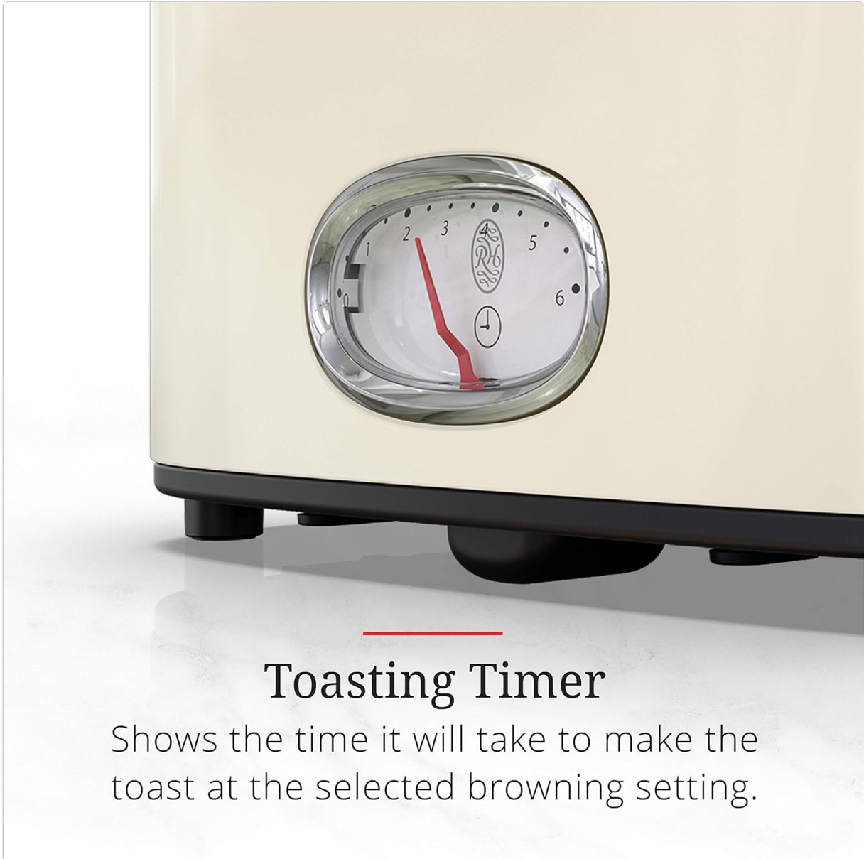
Figure 2: Close-up of the toasting timer on the Russell Hobbs TR9150CRR. The timer visually indicates the remaining time for the selected browning setting.