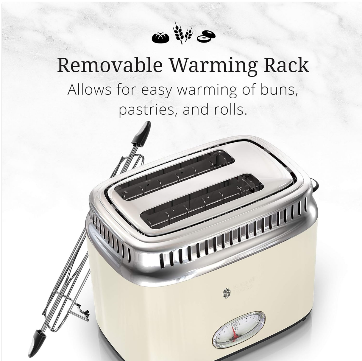
Figure 6: The removable warming rack is used for heating buns, pastries, and rolls.