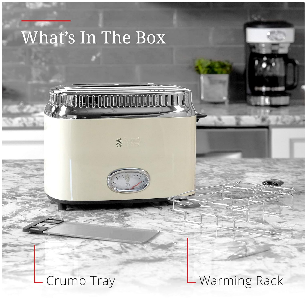
Figure 4: The product package includes the toaster unit, a removable crumb tray, and a warming rack.