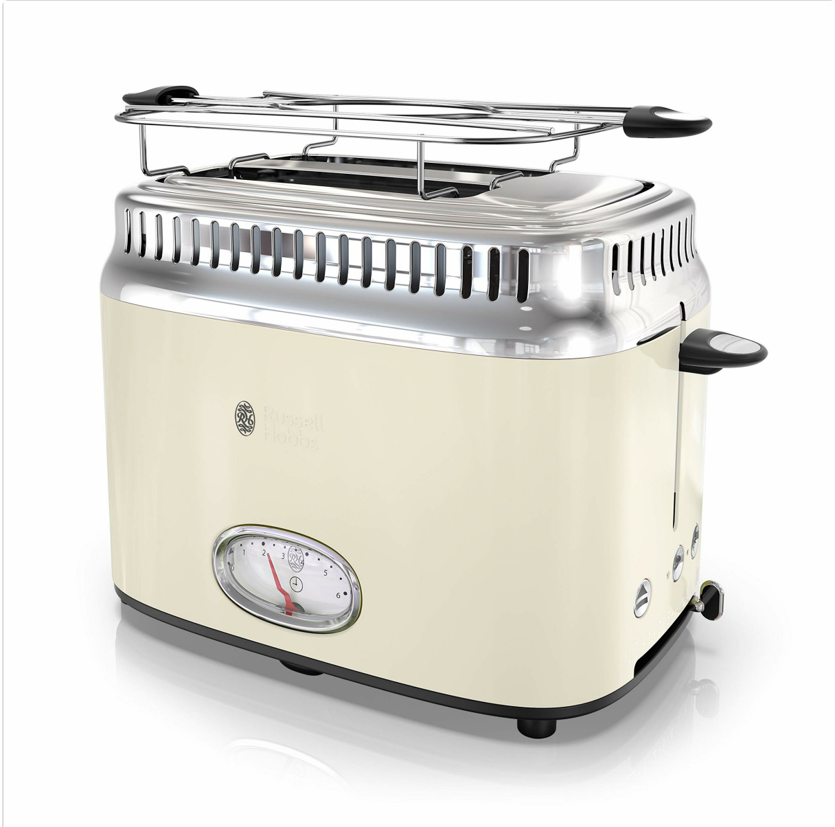
Figure 1: Russell Hobbs TR9150CRR Retro Style 2-Slice Toaster, Cream.

The Russell Hobbs TR9150CRR Retro Style 2-Slice Toaster combines classic design with modern functionality to enhance your kitchen experience. This toaster is designed for efficient and consistent toasting.