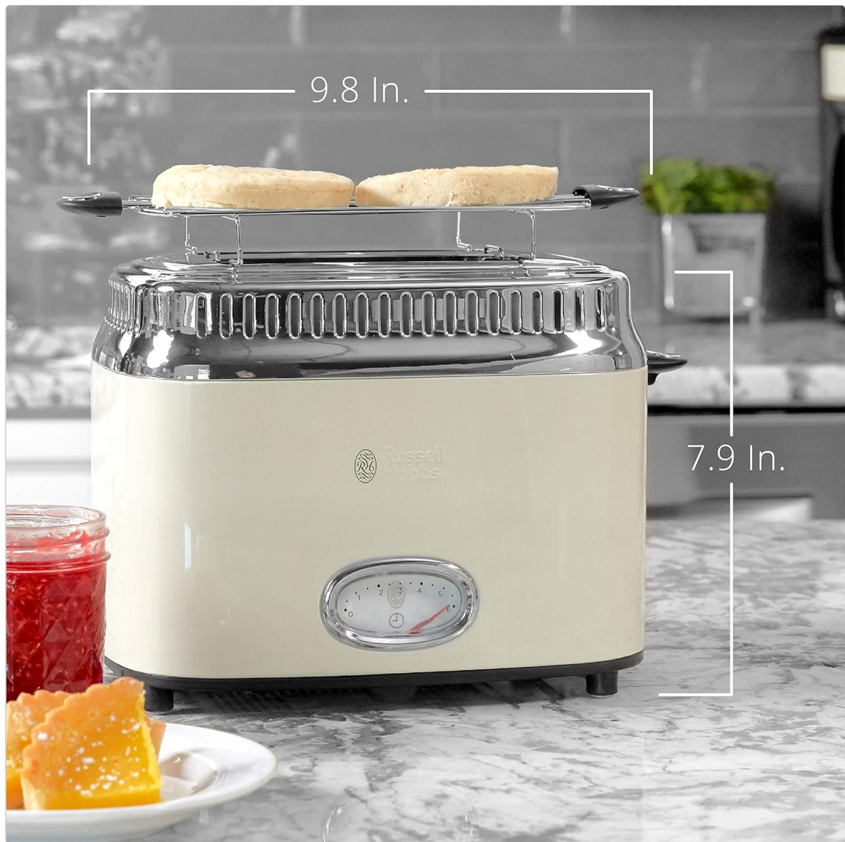
Figure 7: Product dimensions for the Russell Hobbs TR9150CRR Toaster.