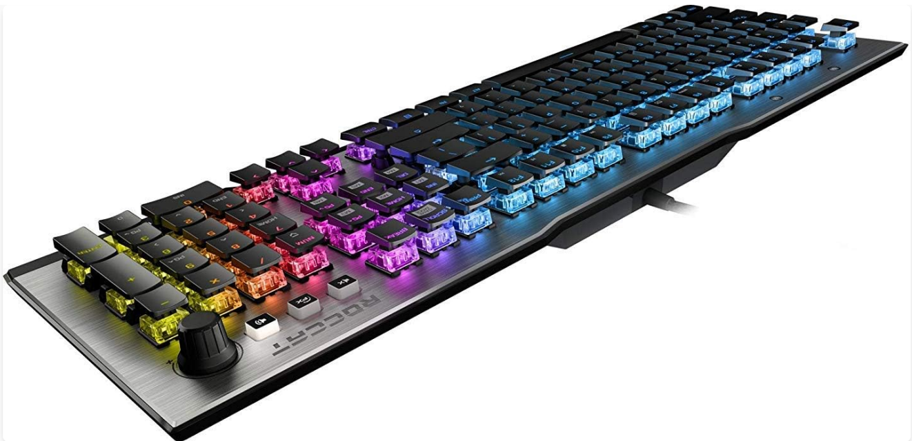
Figure 4: Side view of the keyboard, illustrating the elevated keycap design for easy cleaning.