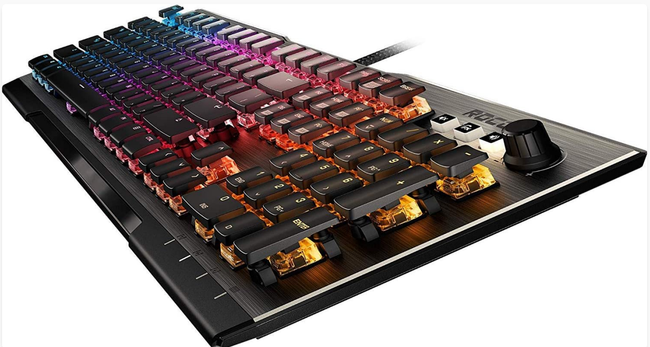
Figure 1: ROCCAT Vulcan 120 AIMO Mechanical PC Gaming Keyboard with RGB lighting.

The ROCCAT Vulcan 120 AIMO is a full-size mechanical gaming keyboard engineered for speed and responsiveness. It features tactile Titan Switches, a low-profile design for comfort, and a durable anodized aluminum top plate. The keyboard includes dedicated mixer-style audio controls, a detachable palm rest, and per-key AIMO RGB lighting. This manual provides essential information for setting up, operating, maintaining, and troubleshooting your keyboard.