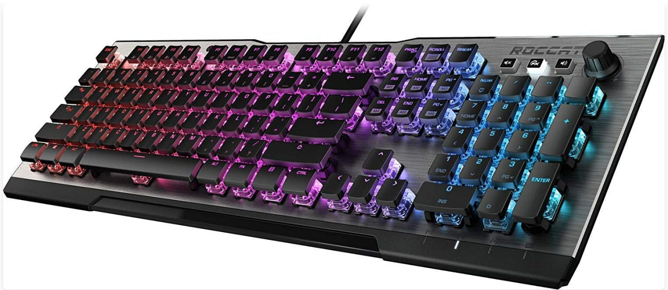
Figure 3: Close-up of the keyboard showcasing vibrant RGB lighting.