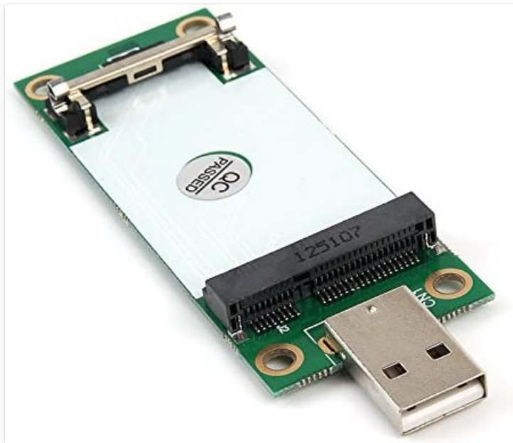
Figure 1: Mini PCIe module installed on the adapter.

Your browser does not support the video tag.