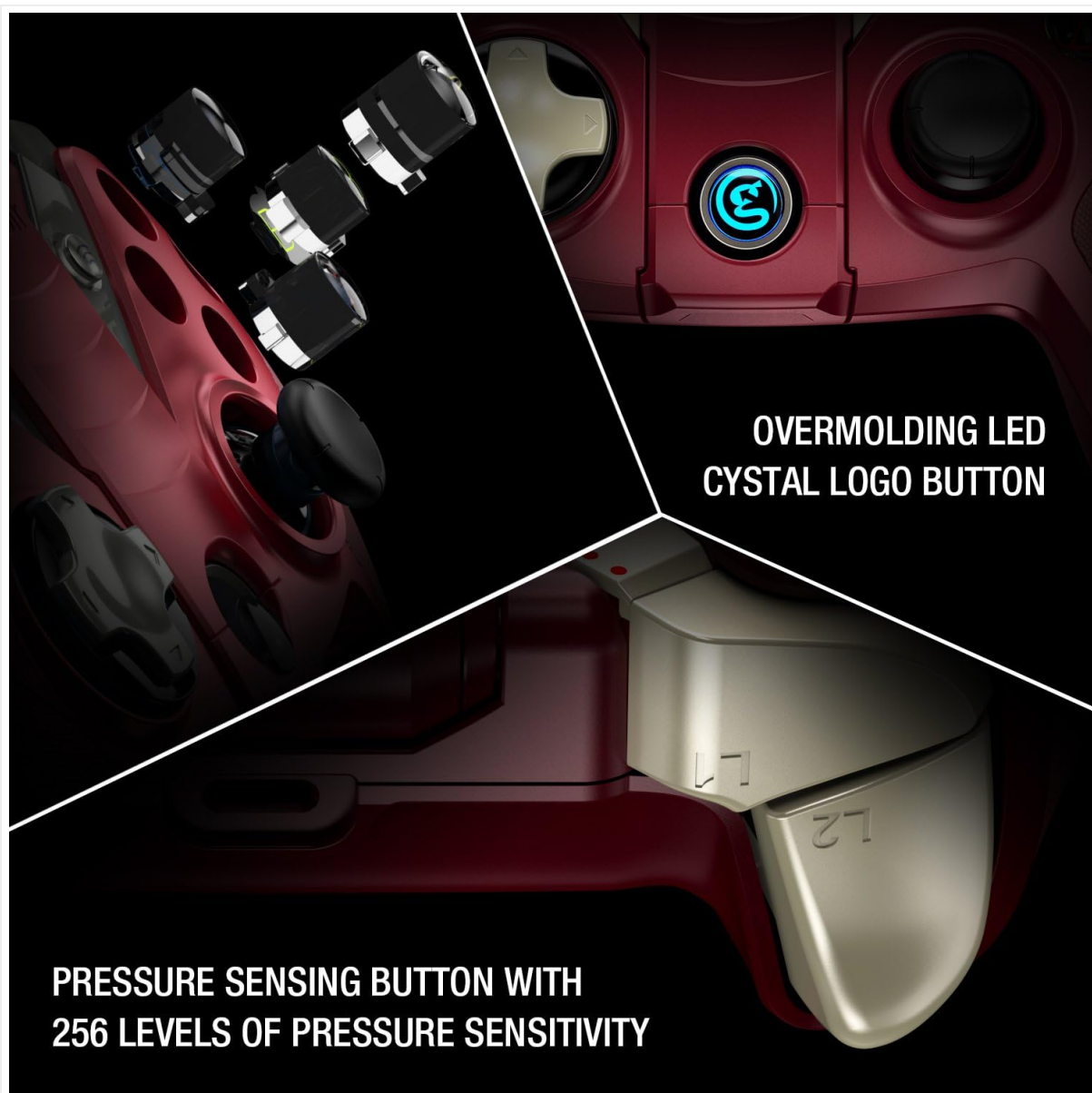
Detail of the GameSir M2's premium buttons, featuring 256 levels of pressure sensitivity for precise control, and the illuminated crystal logo button.