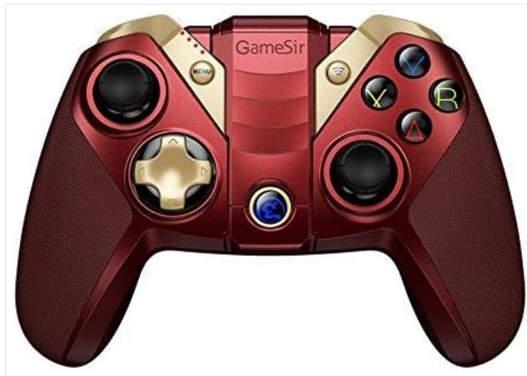
A comprehensive view of the GameSir M2 controller's layout, including dual analog sticks, D-pad, action buttons, and shoulder buttons.