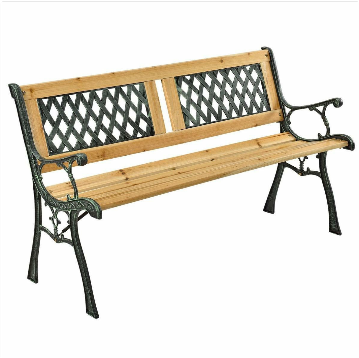
Image Description: A front-facing view of the Jusky's Sanremo Garden Bench. It showcases the natural wood finish of the seat and backrest slats, contrasted with the dark, ornate cast iron side frames and armrests. The backrest features a decorative rhomboid pattern.