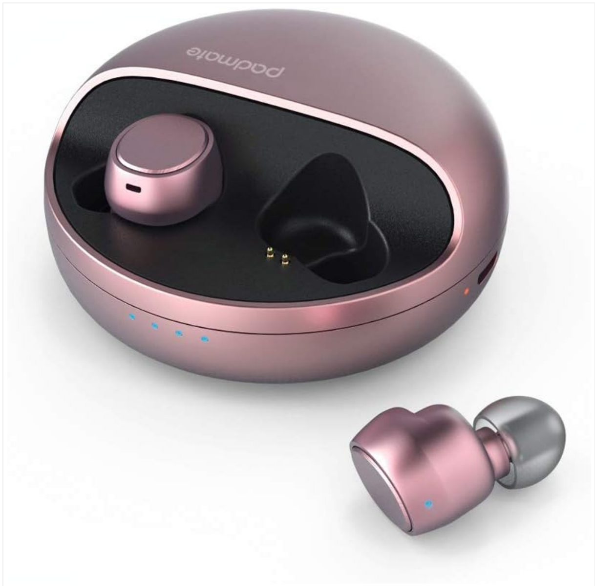
Image: Padmate Wireless Earbuds and their portable charging case.