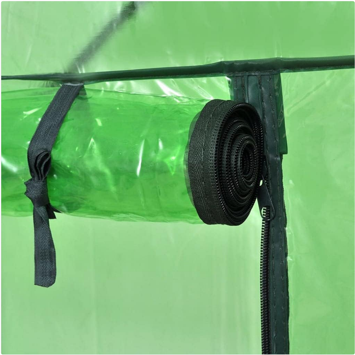
Image: Close-up of the greenhouse door rolled up and secured with fabric ties, demonstrating the ventilation feature.