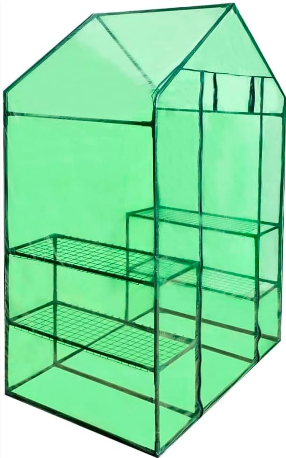
Image: Overview of the assembled vidaXL Greenhouse, showing the green PVC cover and internal shelving.