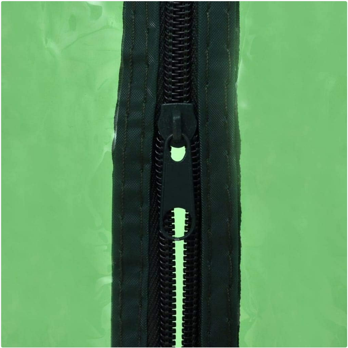
Image: Close-up of the heavy-duty zipper on the greenhouse door, used for opening and closing.