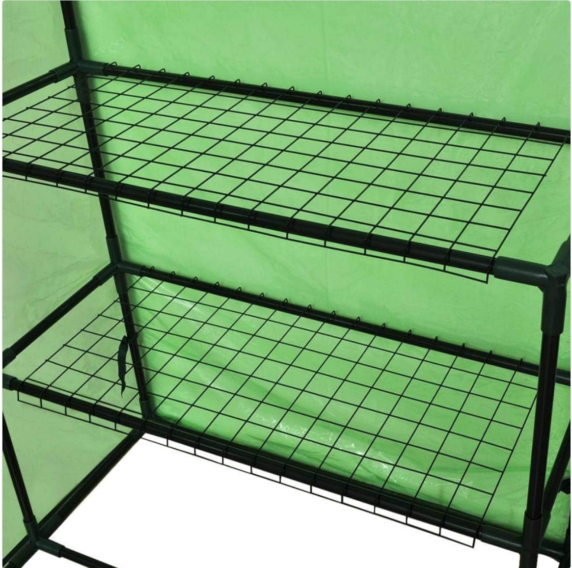
Image: Close-up view of the internal wire shelving units within the greenhouse structure.