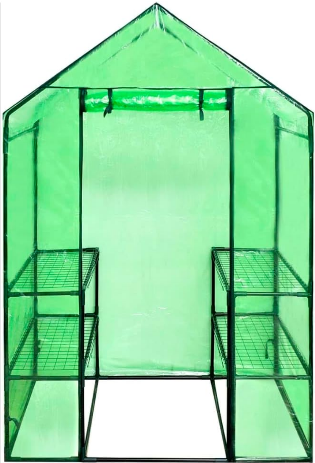
Image: Front view of the greenhouse with the zippered door rolled up and secured, providing access to the interior.