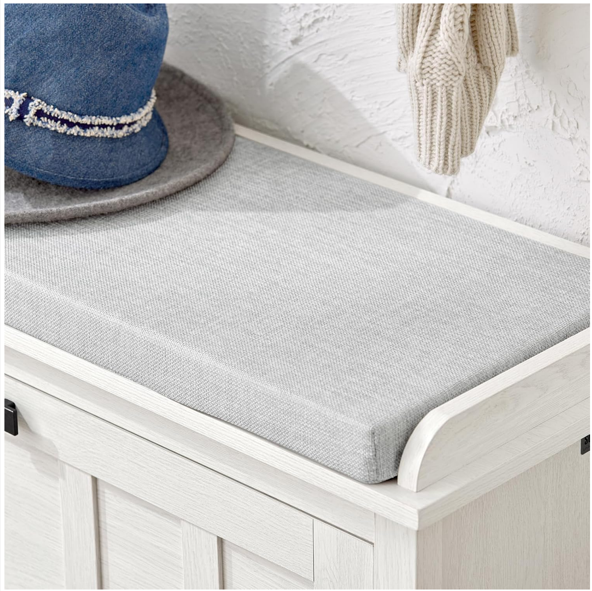
Figure 3: Padded Seat Cushion Detail

Your browser does not support the video tag.