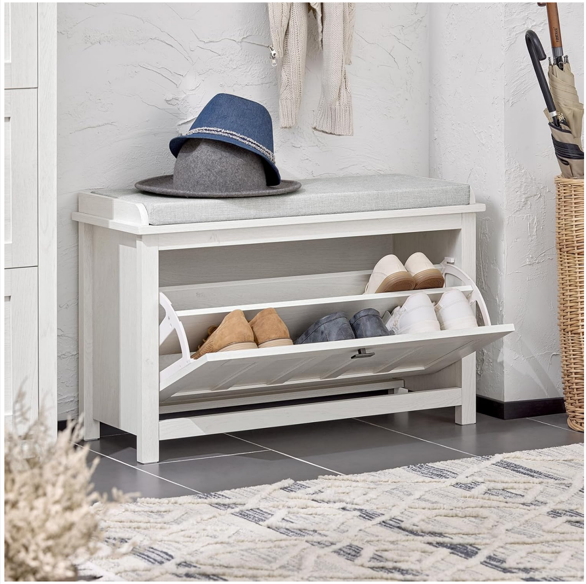
Figure 2: Open Flip-Down Shoe Drawer with Shoes