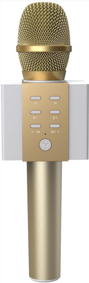
Figure 2.1: Front view of the TOSING 008 microphone, clearly displaying the control panel with buttons for power, volume, echo, and track navigation.