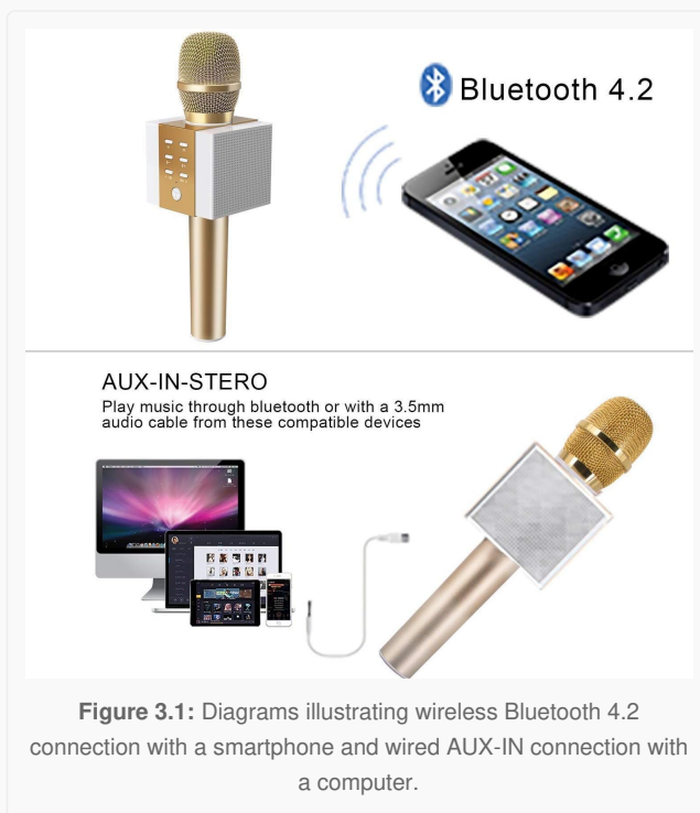
Figure 3.1: Diagrams illustrating wireless Bluetooth 4.2 connection with a smartphone and wired AUX-IN connection with a computer.