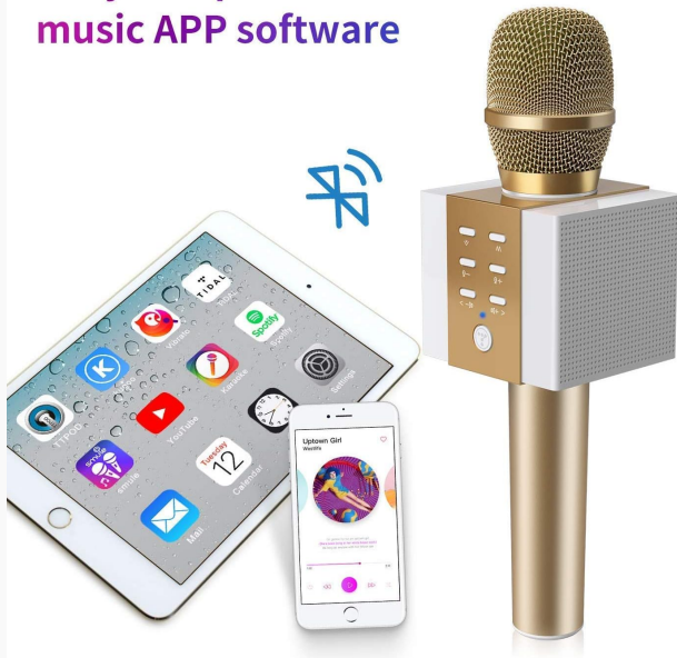
Figure 4.2: Image demonstrating the TOSING 008 microphone's compatibility with various music applications on a tablet and smartphone.