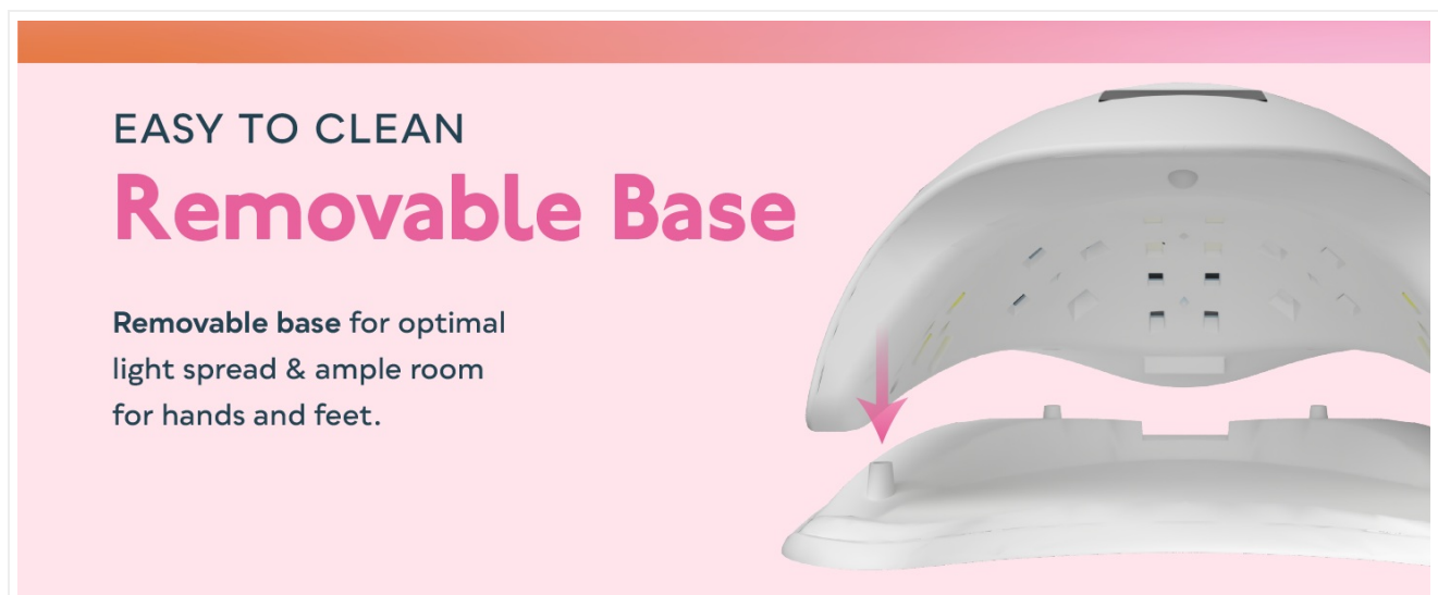
Figure 5: Detailed steps for using the SUN5Plus Nail Lamp.

Your browser does not support the video tag.