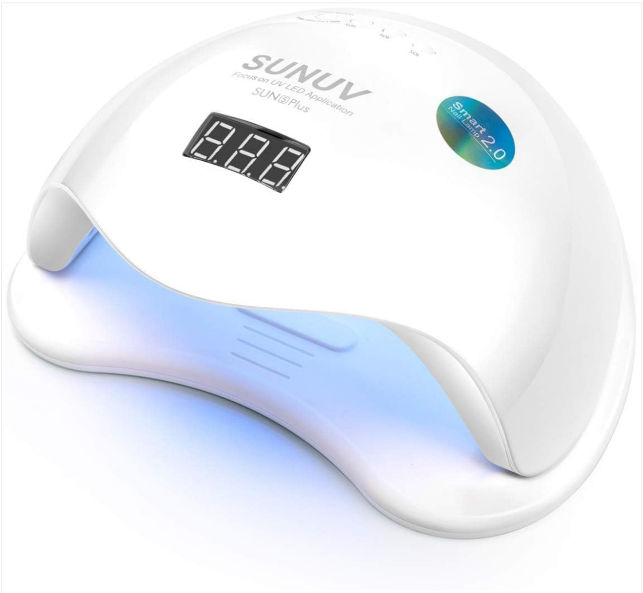
Figure 1: SUNUV UV LED Nail Lamp SUN5Plus