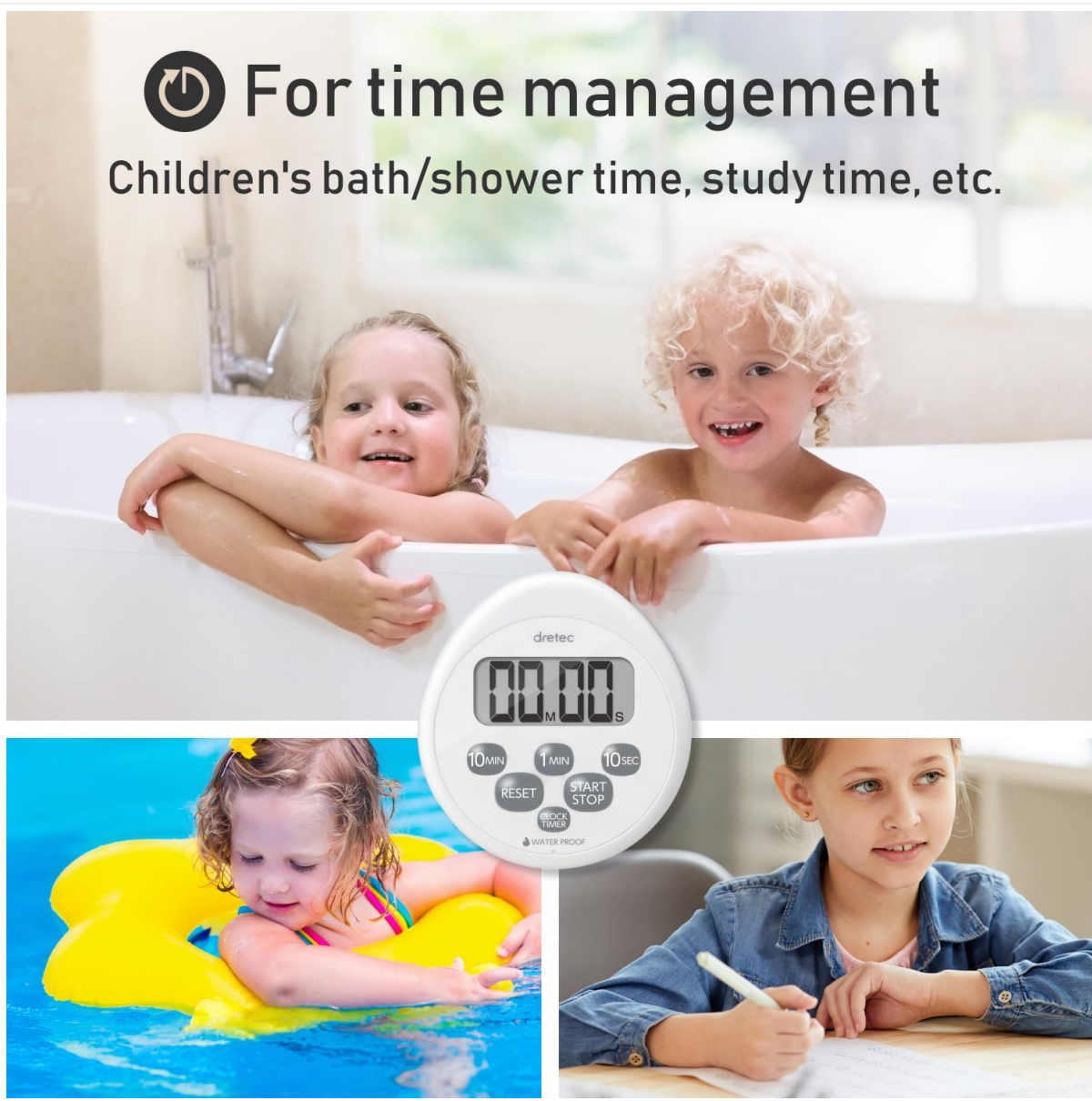
Image: The dretec Digital Timer displayed with various scenes of use, including children in a bath, a child studying, and a child swimming, illustrating its versatility for time management.

Children's bath/shower time, study time, etc.