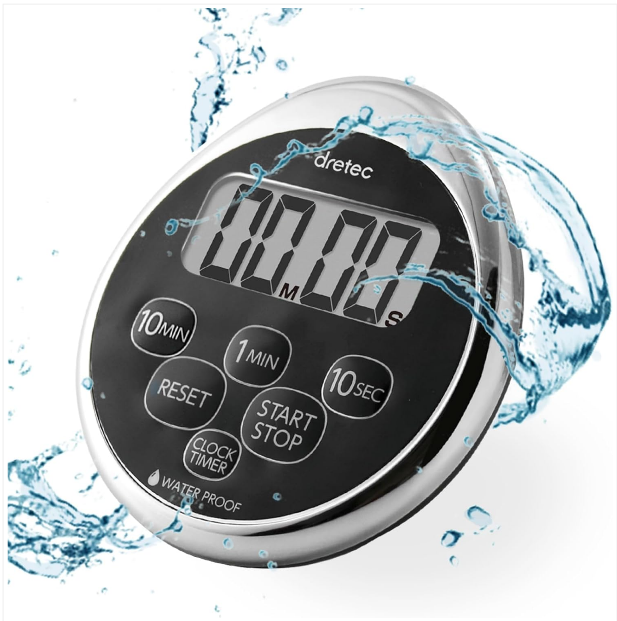
Image: The drettec Digital Timer, showcasing its sleek design and water-resistant nature with water splashes around it.