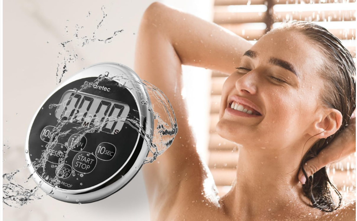
Image: The dretec Digital Timer shown in a shower environment, emphasizing its waterproof capability. A person is showering in the background.

Since it is a waterproof timer, you can use it safely even in the bathroom.