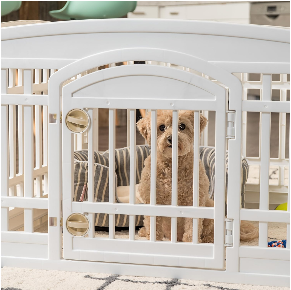
Image: Easy open door mechanism for pet access.