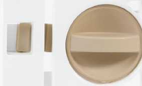
Image: Easy Assembly. Panels snap together for quick setup.

Keep them (and your house) safe with the easy and pet proof lock. Just twist to open and to lock into place.