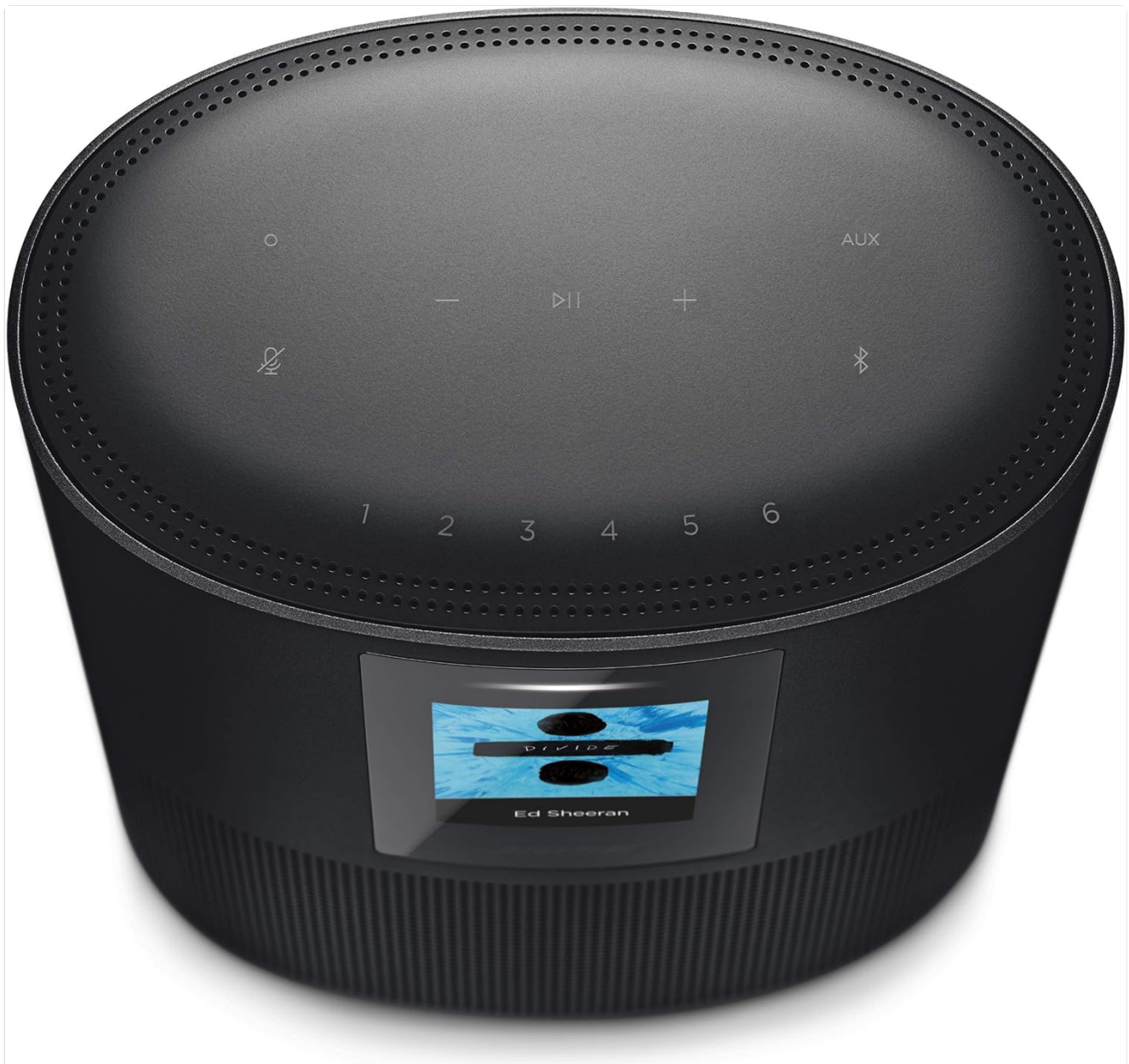
Figure 3: Top panel controls for the Bose Home Speaker 500.