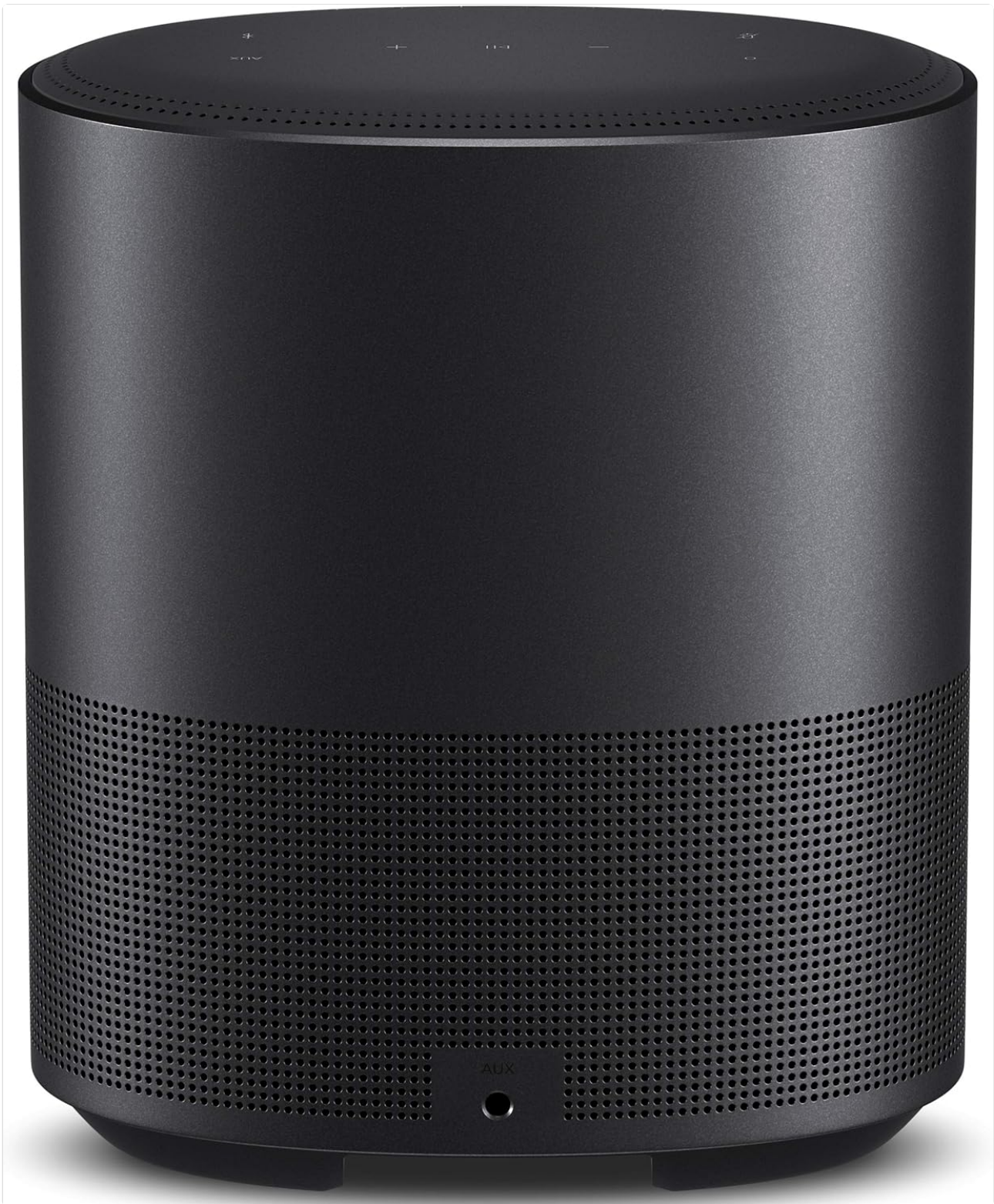
Figure 2: Rear view of the speaker showing the power input and AUX port.