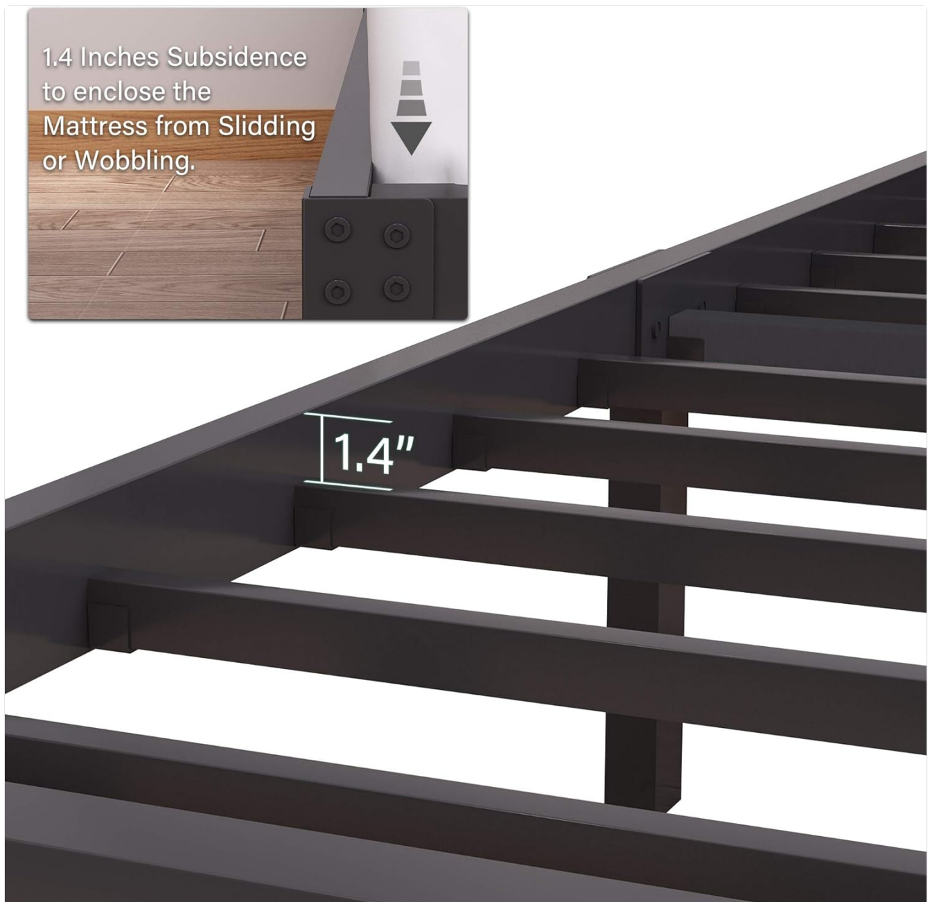
Figure 4.1: Visual representation of the integrated structure designed for extremely easy assembly.

Tip: Assembly is significantly easier with two people.