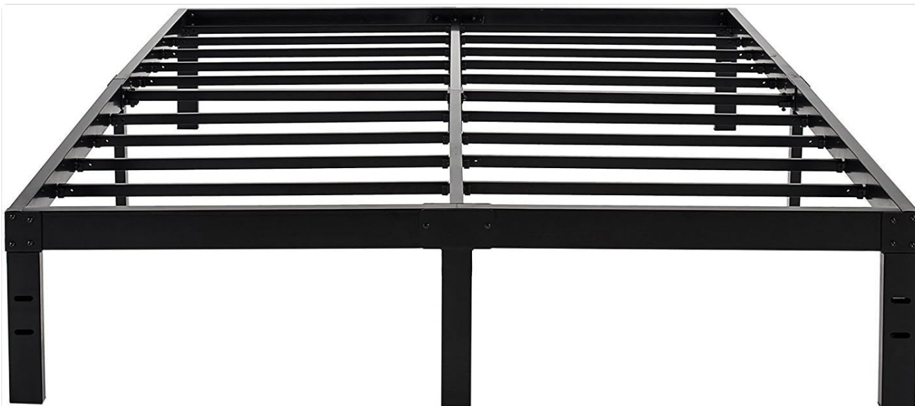
Figure 1.1: The 45MinST 14 Inch Reinforced Platform Bed Frame, showcasing its sturdy black steel construction and slat design.

This manual provides detailed instructions for the assembly, use, and care of your new 45MinST 14 Inch Reinforced Platform Bed Frame. Designed for durability and ease of use, this bed frame offers robust support for your mattress without the need for a box spring, and provides ample under-bed storage space. Please read all instructions carefully before assembly and use.