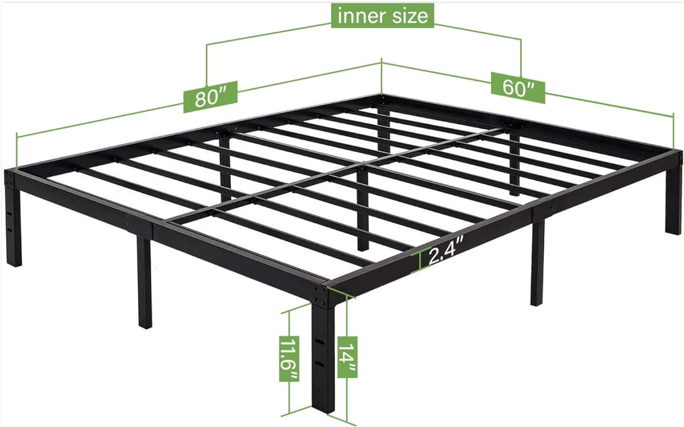
Figure 8.1: Key dimensions of the 45MinST Queen Platform Bed Frame.