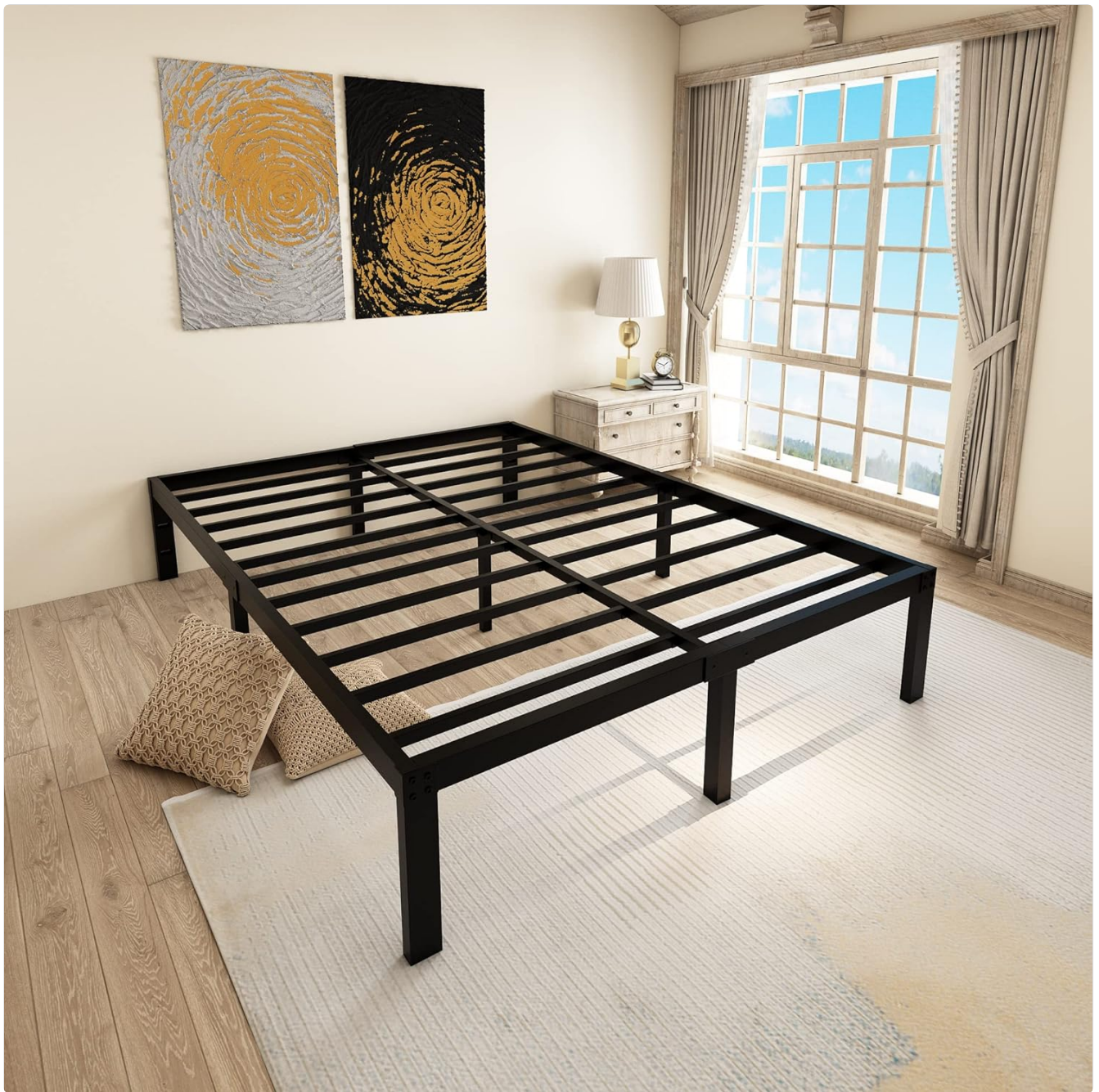
Figure 5.2: The bed frame integrated into a bedroom, highlighting the ample space available underneath for storage.