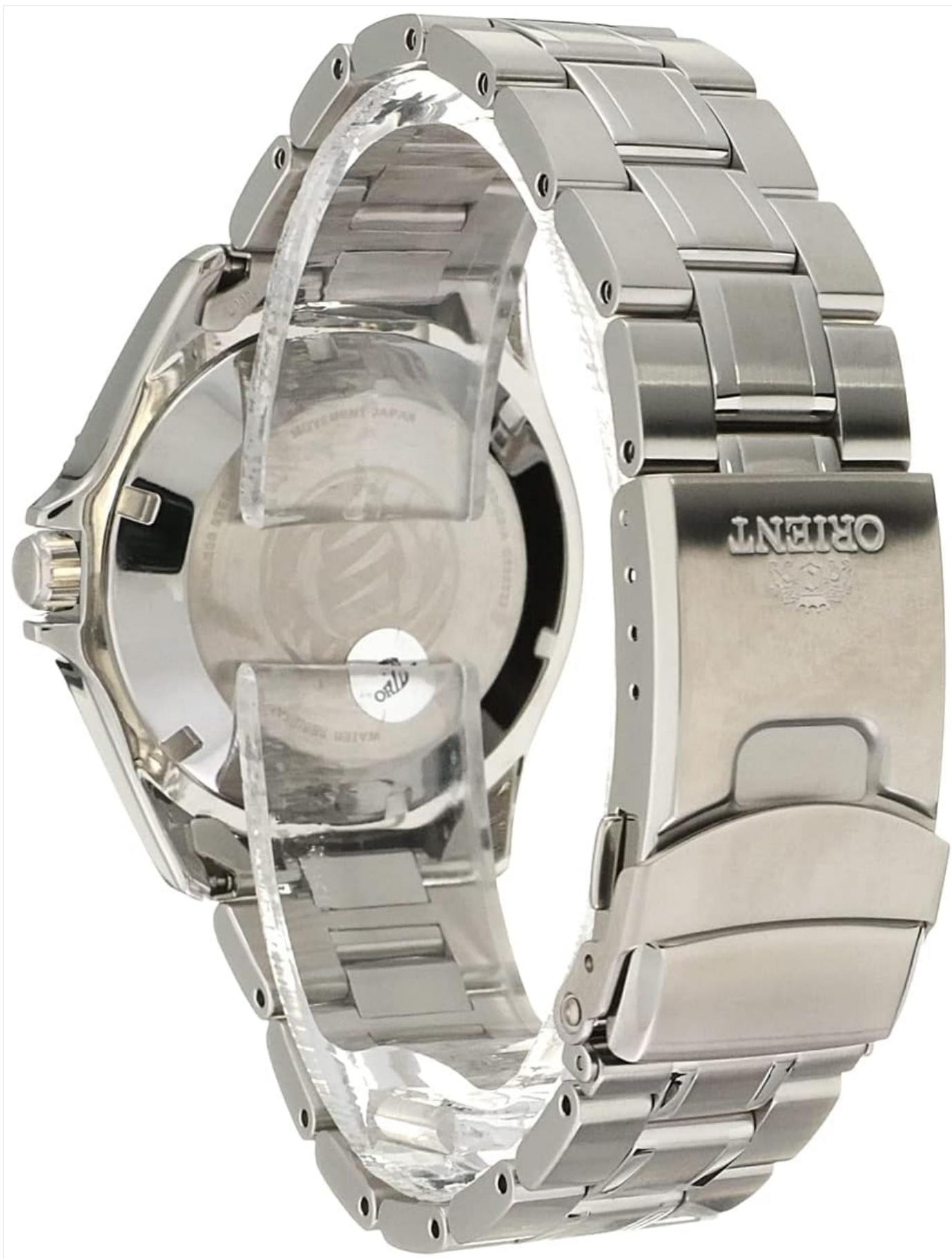
Image: Side view of the Orient Ray 2 watch, showing the crown and the unidirectional rotating bezel. The stainless steel bracelet and case back are also visible.