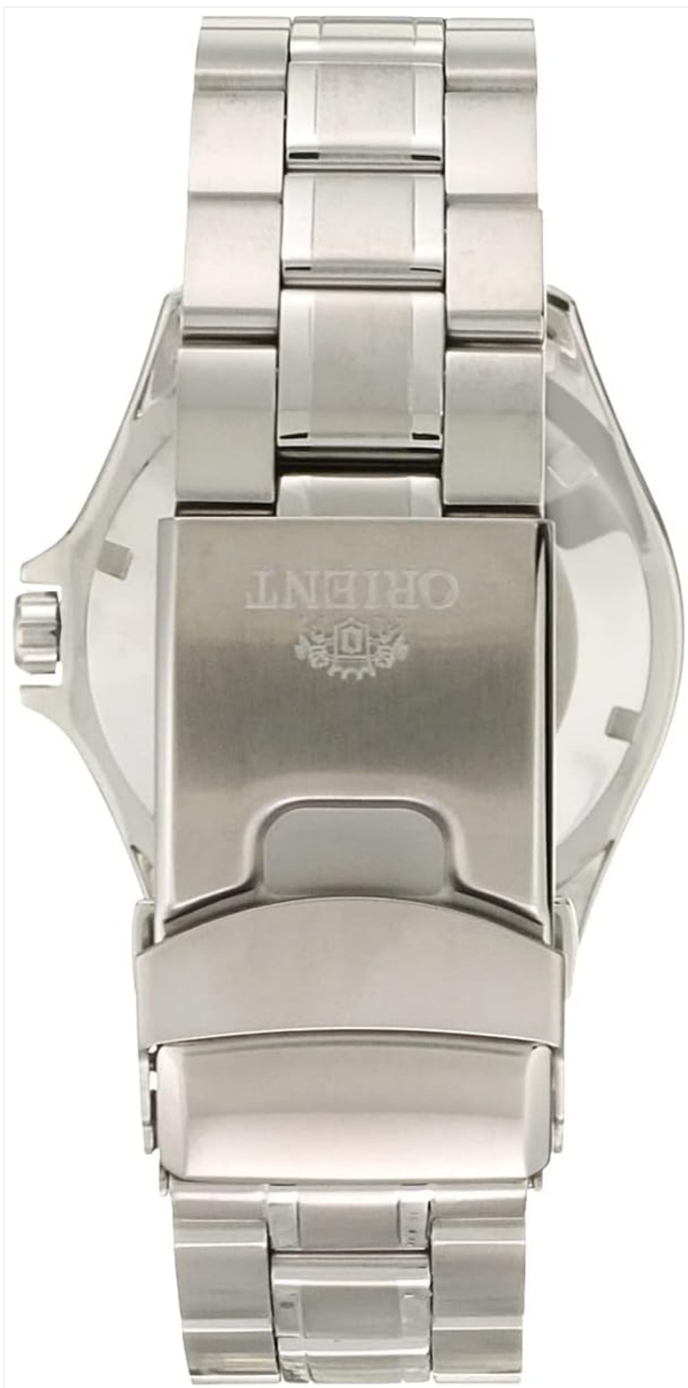
Image: Close-up view of the case back of the Orient Ray 2 watch, showing the Orient logo and engravings. The stainless steel bracelet clasp is also visible.