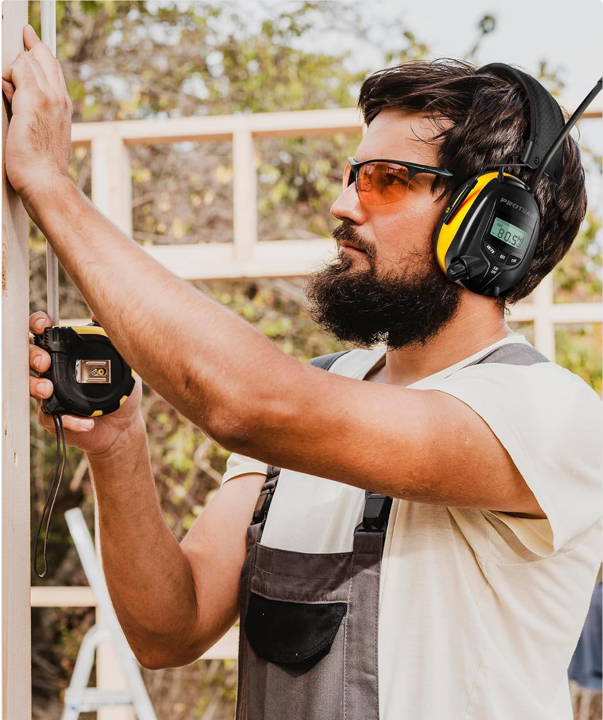
Image: A man wearing the PROTEAR headphones while engaged in construction work, demonstrating practical use in a noisy environment.