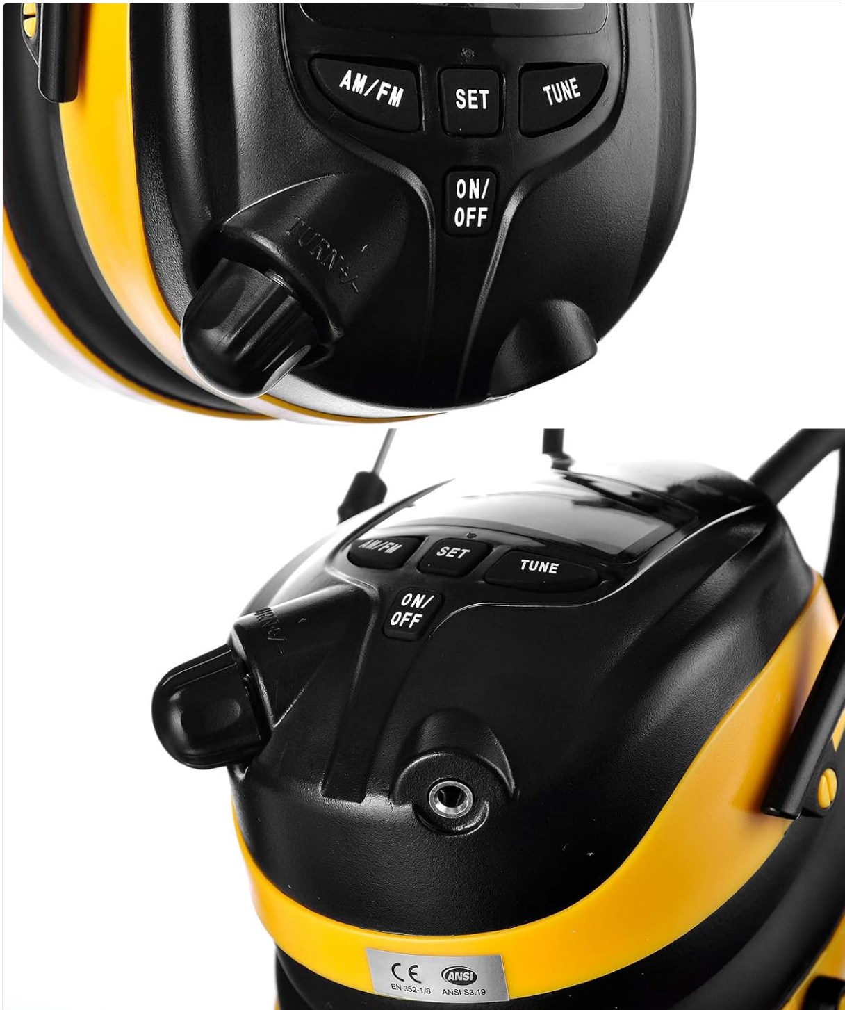
Image: A detailed view of the control panel, showing the AM/FM, SET, TUNE buttons, and the ON/OFF/Volume knob, along with the AUX port.