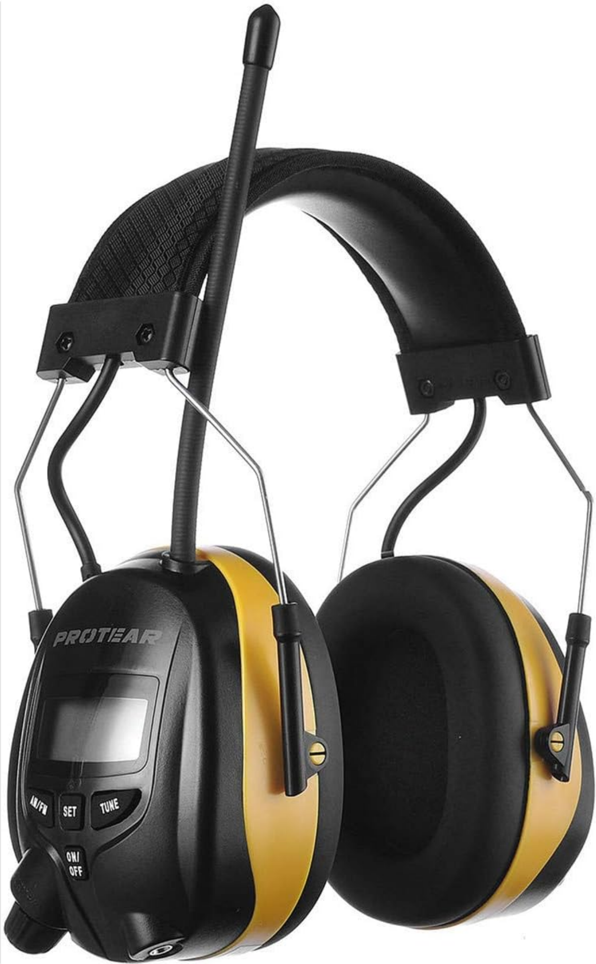
Image: PROTEAR AM/FM Radio Headphones in yellow and black, showcasing the digital display and antenna.