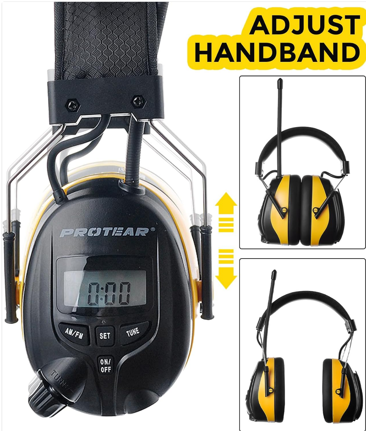
Image: Demonstrates the adjustable nature of the headband, showing how it can be extended and retracted to fit various head sizes.