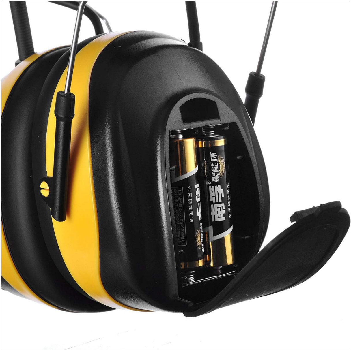
Image: A close-up view of the open battery compartment, showing where to insert the two AA batteries.