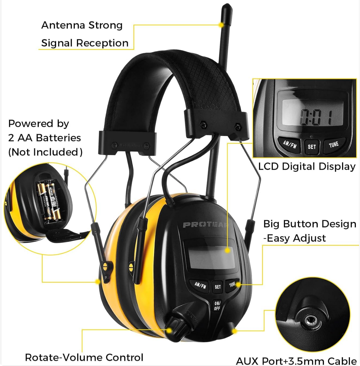
Image: A detailed diagram highlighting the antenna, LCD digital display, big button design, rotate-volume control, AUX port, and battery compartment.