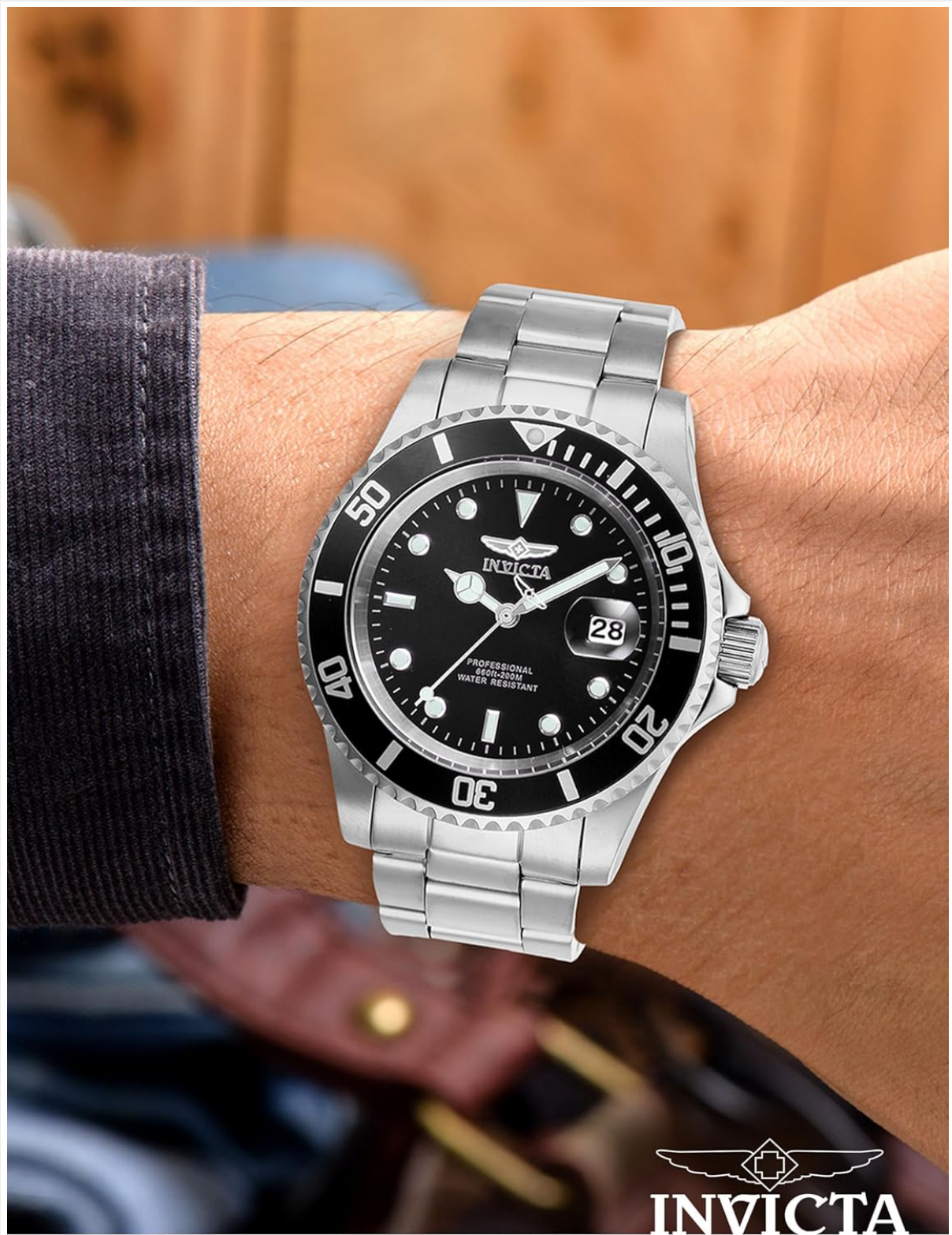
Image: Detailed view of the watch's crown and the magnified date window on the dial.