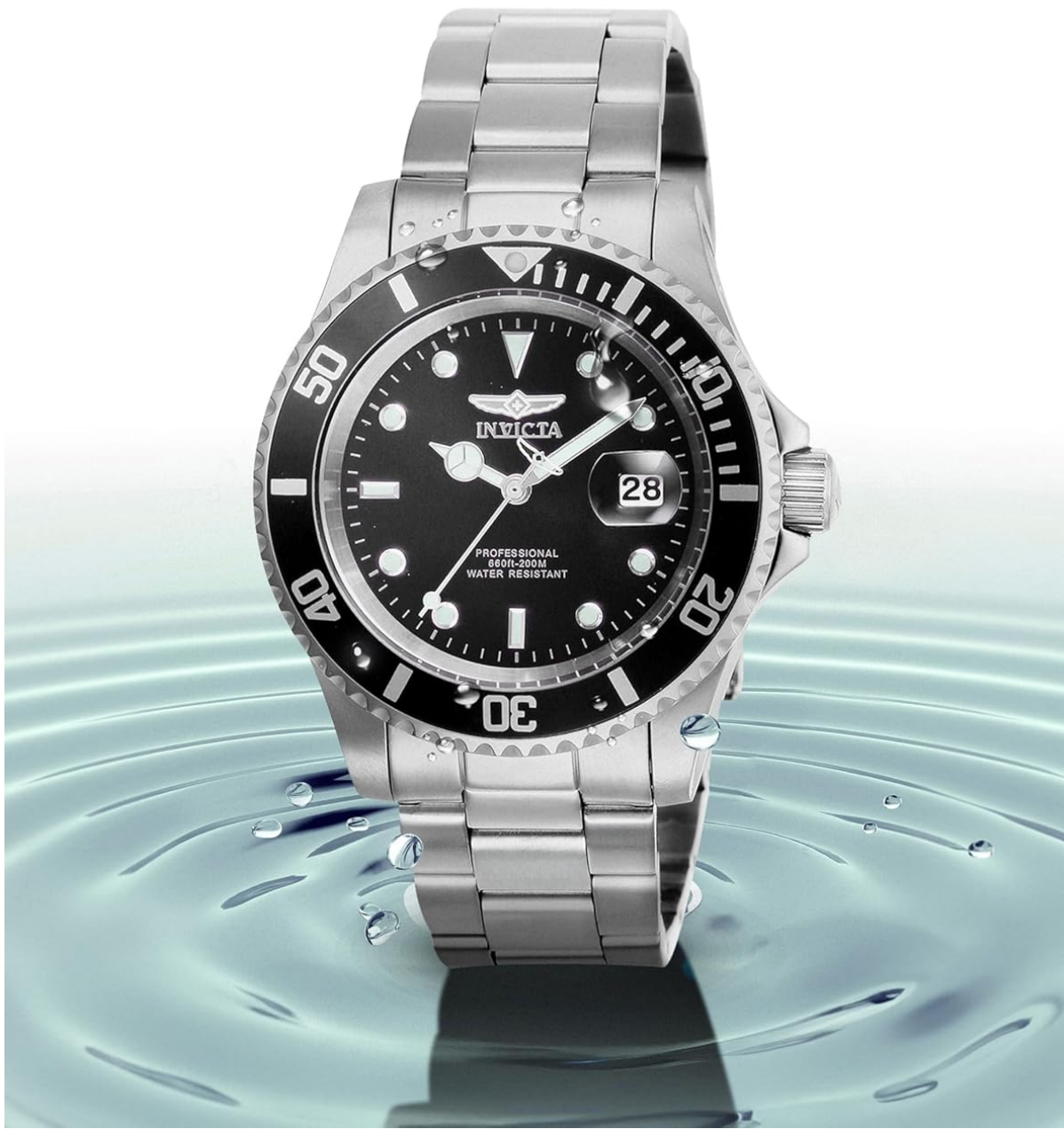
Image: The Invicta Pro Diver watch partially submerged in water, illustrating its water-resistant capabilities.