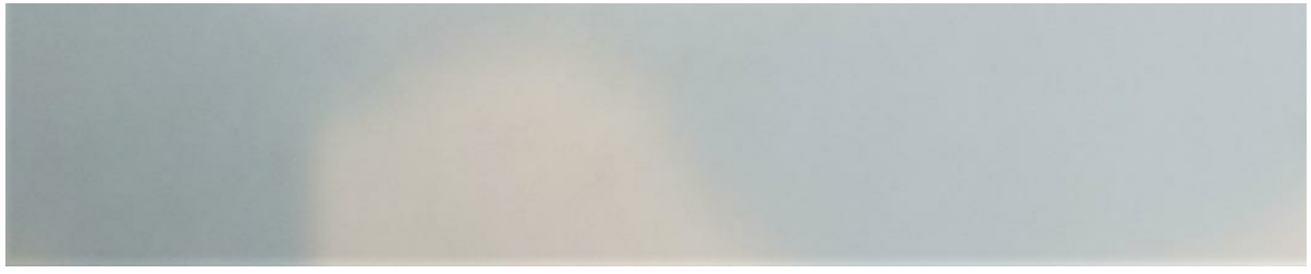
Image: Close-up view of the watch's stainless steel band, highlighting the removable links and pins for size adjustment.