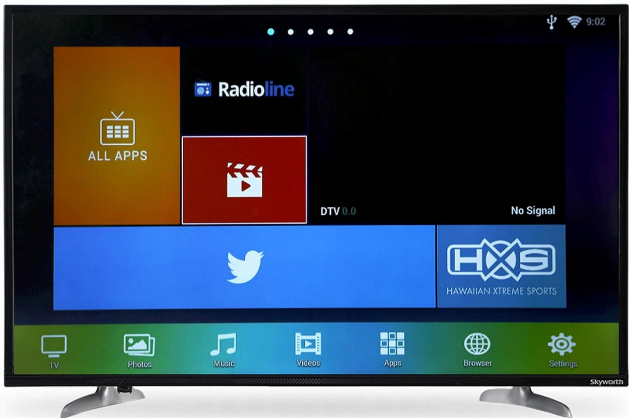
The Skyworth 32 M20 Smart TV displaying its intuitive smart interface with various application tiles.

Use the arrow keys and OK button on your remote to navigate through menus and select options. The 'Back' or 'Return' button will take you to the previous screen, and the 'Home' button will bring you to the main Smart TV interface.