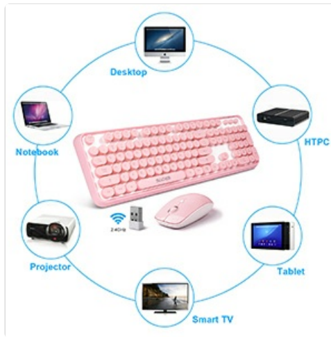
Image: A circular diagram illustrating the wide compatibility of the keyboard and mouse combo with devices such as desktops, notebooks, HTPCs, projectors, tablets, and Smart TVs.