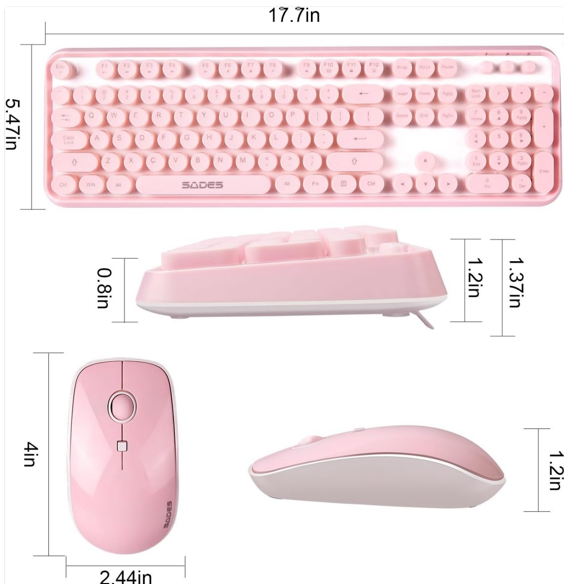
Image: A top-down view of the keyboard, illustrating the full key layout and the position of the indicator lights.