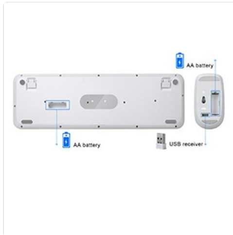
Image: Close-up of the USB receiver and AA batteries, indicating their inclusion with the product.