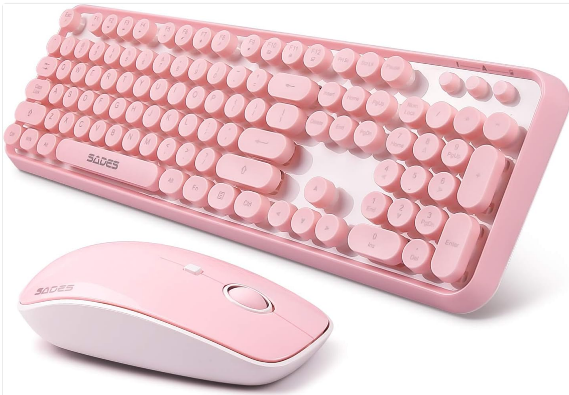
Image: The SADES V2020 Wireless Keyboard and Mouse Combo, showcasing the pink keyboard with round

Thank you for choosing the SADES V2020 Wireless Keyboard and Mouse Combo. This product combines a retro-style keyboard with round keycaps and an ergonomic optical mouse, offering a comfortable and efficient wireless experience. This manual will guide you through the setup, operation, and maintenance of your new device.