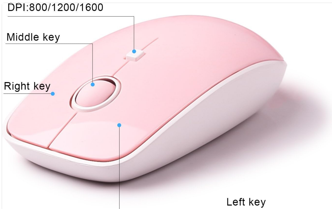
Image: A close-up view of the mouse, pointing out the left key, right key, middle key (scroll wheel), and the DPI adjustment button.