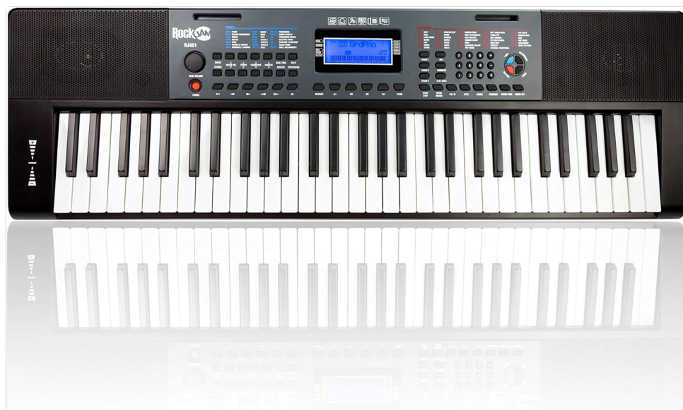
Figure 6: The pitch bend wheel for expressive playing.

Use the pitch bend wheel on the left side of the keyboard to smoothly alter the pitch of notes while playing, adding expressive effects to your music.