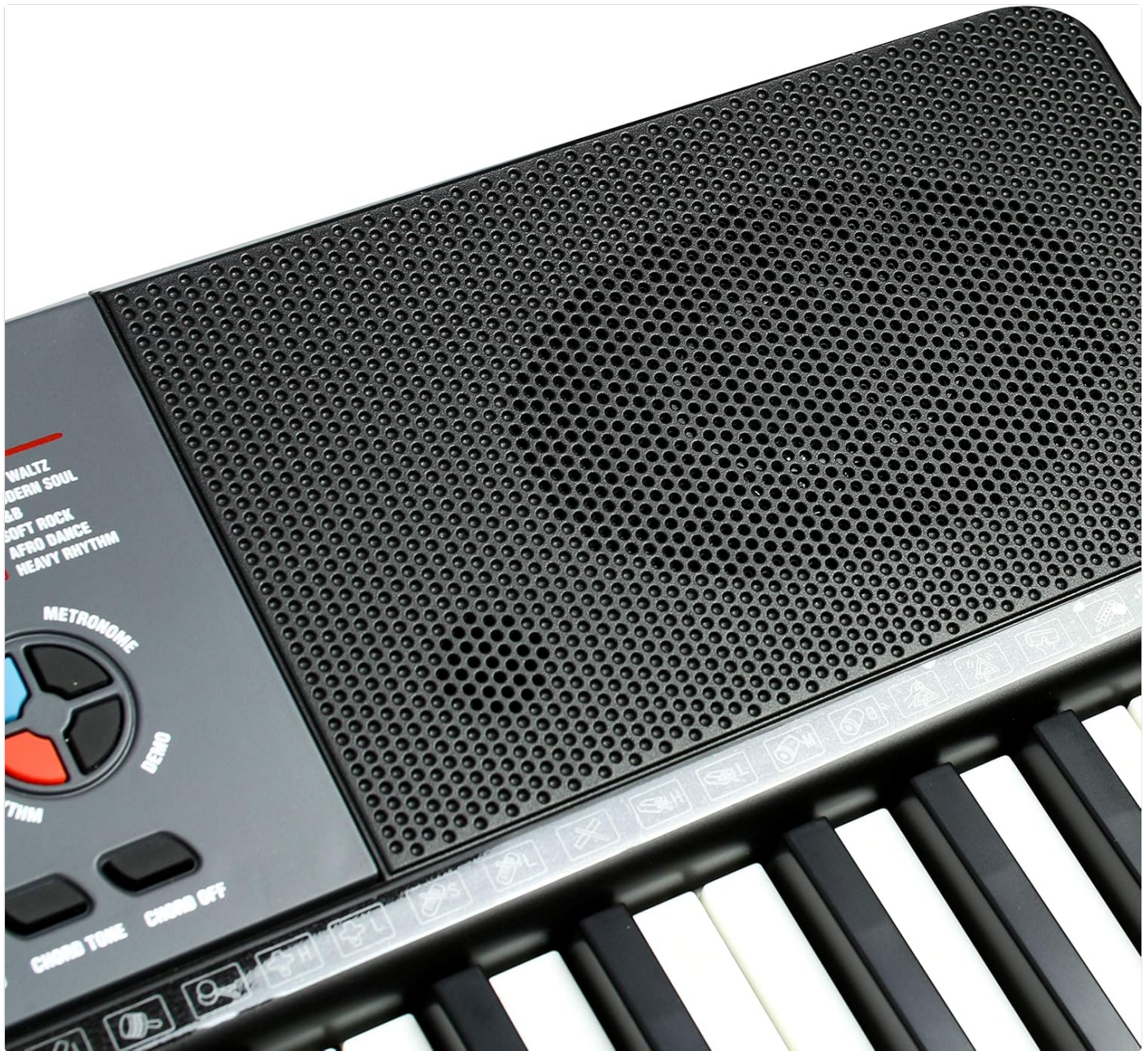
Figure 5: Detailed view of the control panel.