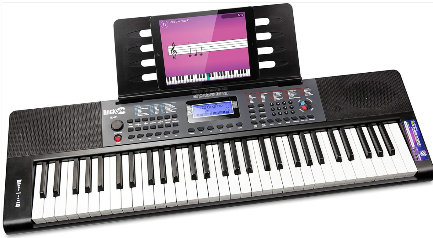
Figure 1: The RockJam 61 Key Keyboard Piano with an attached music stand and a tablet displaying learning software.

Unlock your musical potential with the RockJam 461 Keyboard Piano, a versatile and portable keyboard designed for both beginners and experienced players. This electric piano features 61 full-size keys, offering the feel of a traditional piano in a compact, portable design. With built-in learning modes, access to Simply Piano content, and included keynote stickers, this digital piano is perfect for kids and adults alike. The RockJam 461 also boasts a variety of sound effects, rhythms, and pre-recorded songs to enhance your music experience, making it an ideal choice for any aspiring musician.