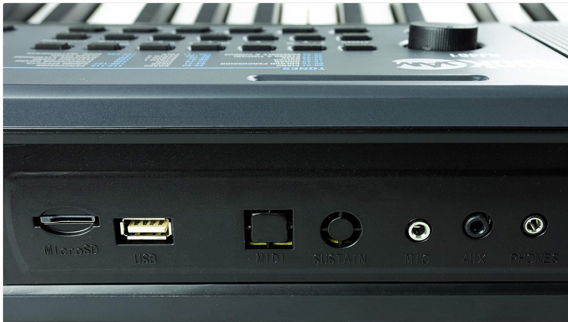
Figure 4: Rear panel connections for power, USB, MIDI, and audio.