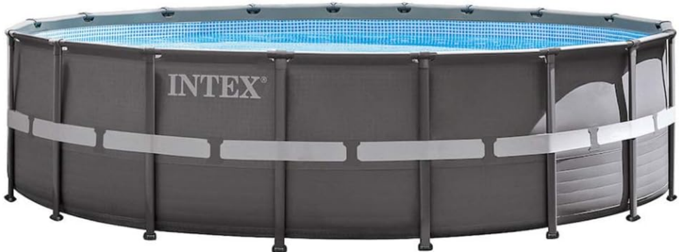
Figure 1.1: Intex Ultra XTR Round Frame Pool (610x122 cm)

This manual provides essential information for the safe and efficient setup, operation, and maintenance of your Intex Ultra XTR Round Frame Pool. Designed for durability and ease of use, this premium pool offers a refreshing experience for your outdoor space. Please read all instructions carefully before assembly and use to ensure proper functioning and safety.