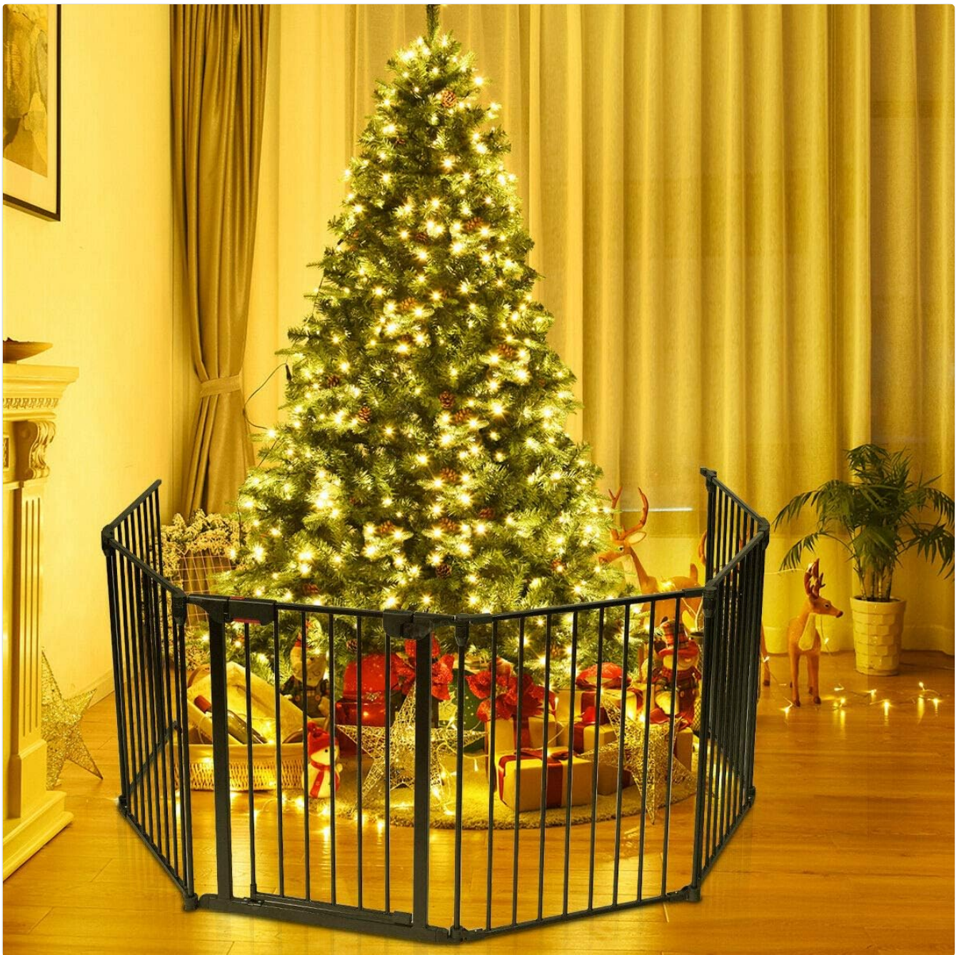
Image: The Costzon 6-Panel Baby Safety Gate configured to surround and protect a Christmas tree and gifts from children or pets.

Your browser does not support the video tag.