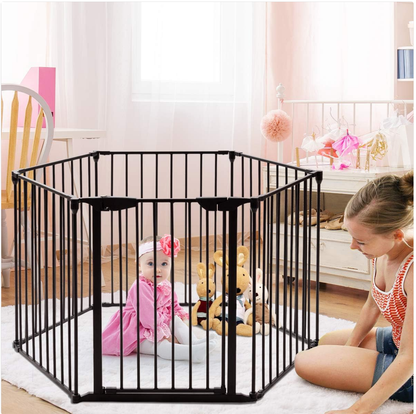
Image: A baby playing safely inside the hexagonal configuration of the Costzon 6-Panel Baby Safety Gate, used as a playpen.