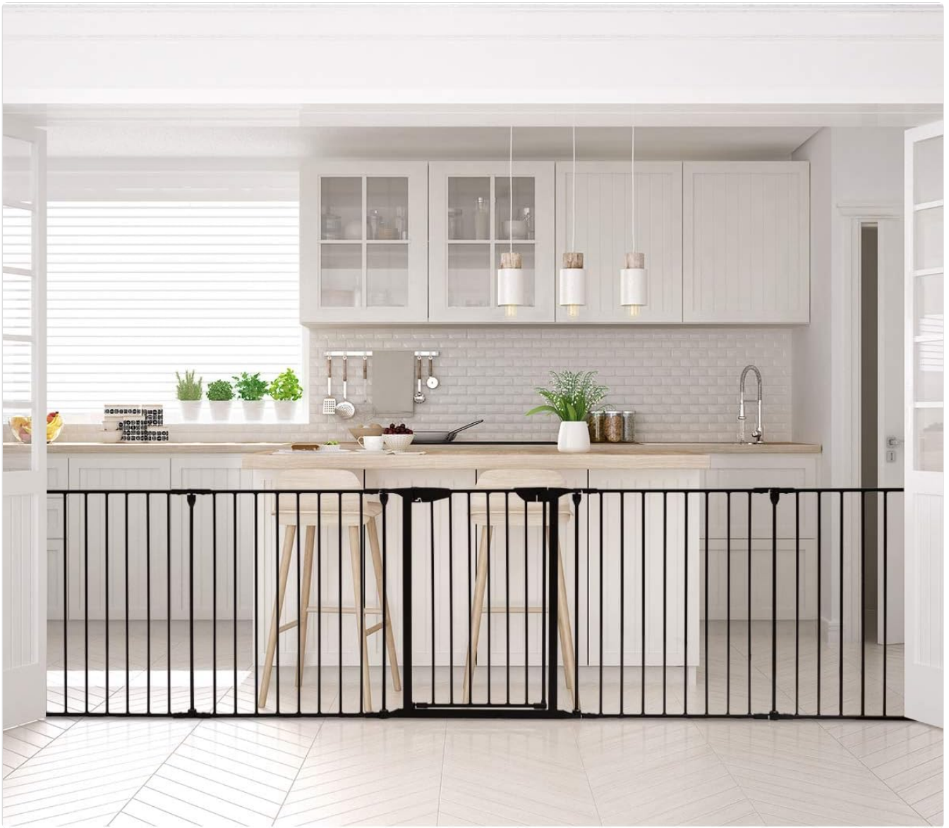
Image: The Costzon 6-Panel Baby Safety Gate configured to block a wide kitchen entrance, demonstrating its extra-wide capability.