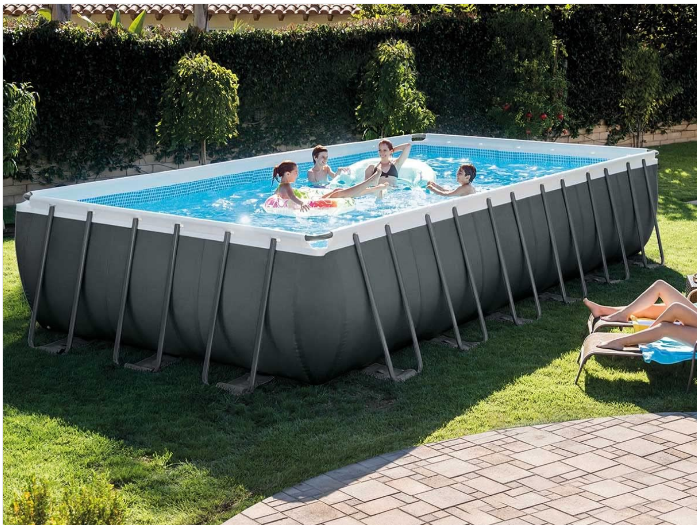
Image: Children enjoying water activities in the Intex pool, highlighting its suitability for family recreation.