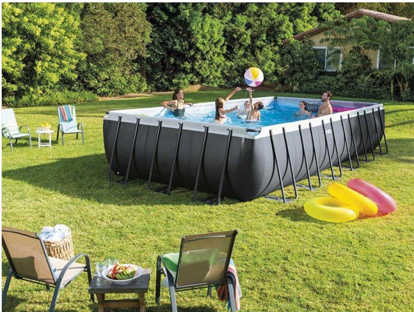
Image: The Intex pool set up in a garden, illustrating the required space and surrounding area.