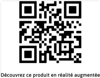
Image: Scan this QR code to discover the product in augmented reality. Access AR Experience