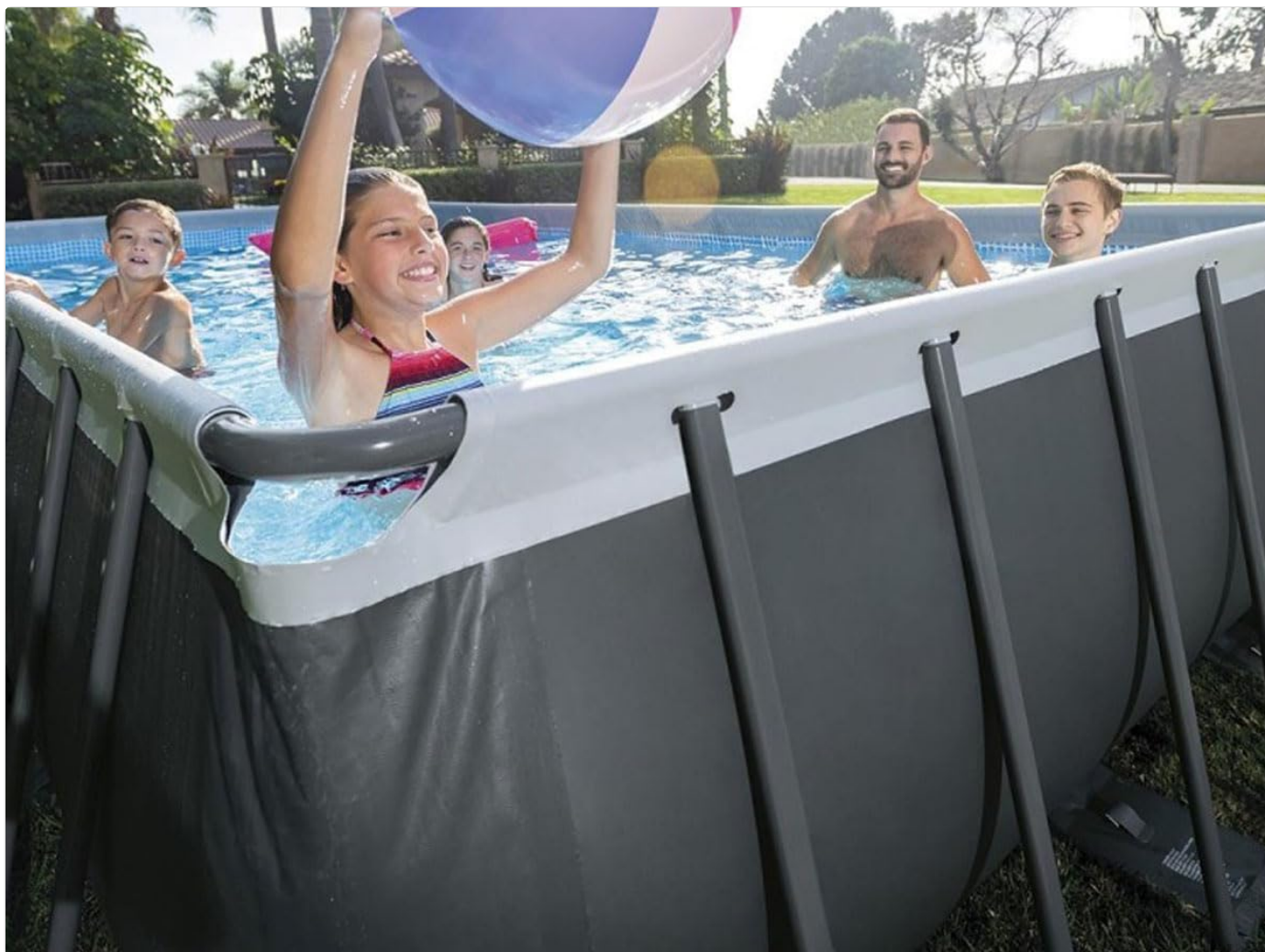
Image: A family enjoying the Intex pool, demonstrating the pool's capacity and recreational use.