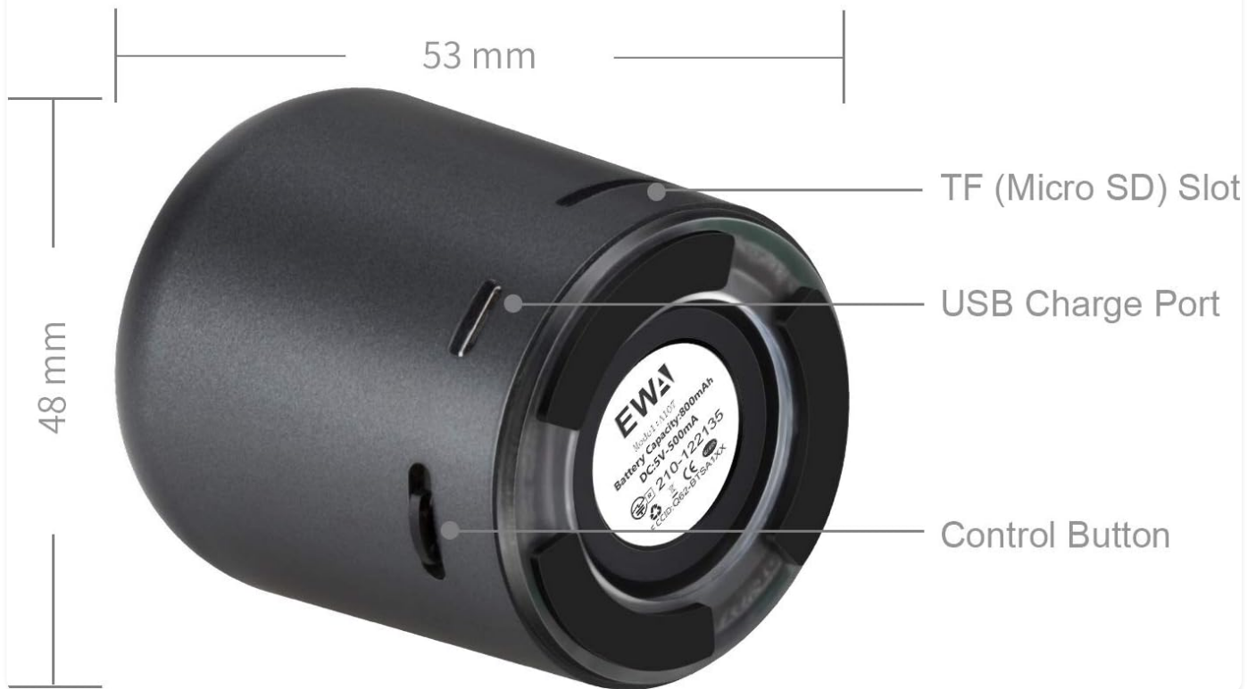
Image: Diagram illustrating the dimensions (53mm diameter, 48mm height) and key components of the EWA A107 speaker, including the TF (Micro SD) Slot, USB Charge Port, and Control Button located on the bottom and side.

One Button Features All Necessary Functions