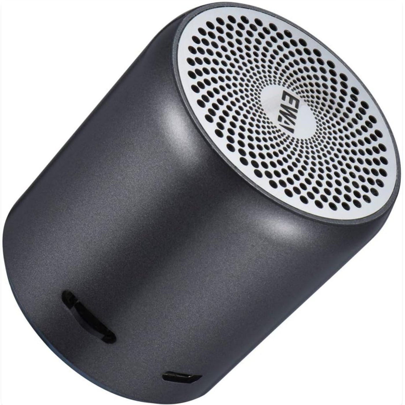
Image: The EWA A107 Mini Metal Bluetooth Speaker, showcasing its compact, cylindrical design and metal grille.